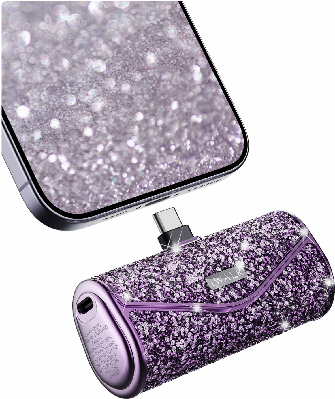
Image 1: The iWALK Sparkly Portable Charger, showcasing its compact size and glittery purple finish.