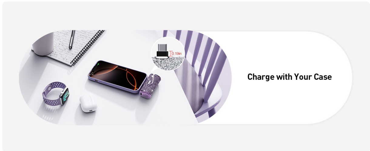
Image 3: The iWALK portable charger directly connected to a smartphone, demonstrating its compact and cordless design.