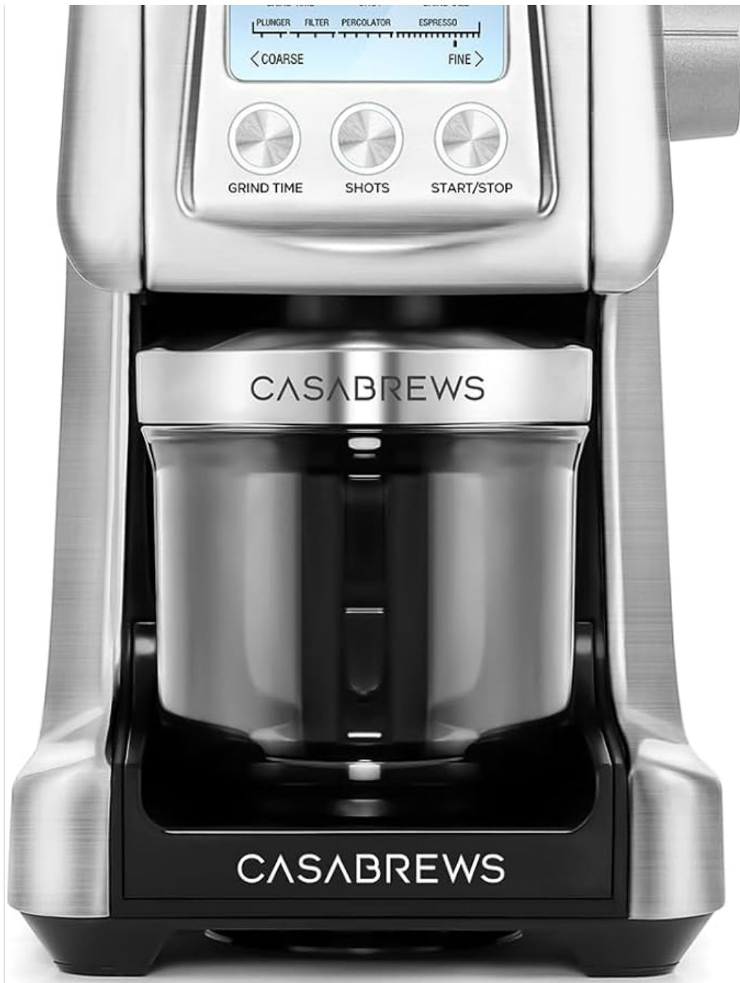
Image: Front view of the CASABREWS Tornado Electric Conical Burr Coffee Grinder.