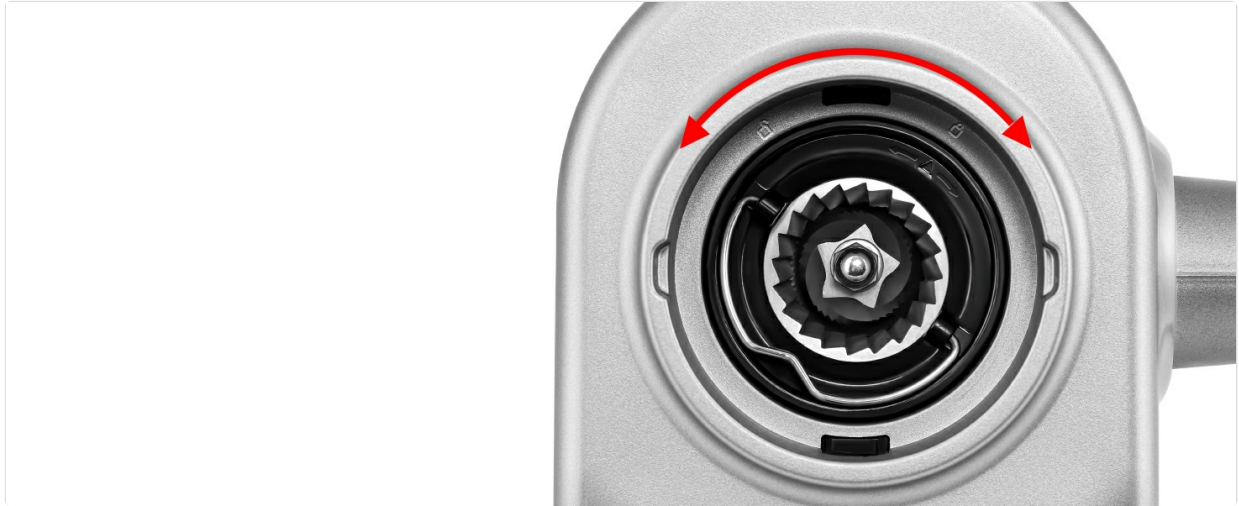
Image: Close-up view of the conical burr mechanism, showing its removable design for easy cleaning.