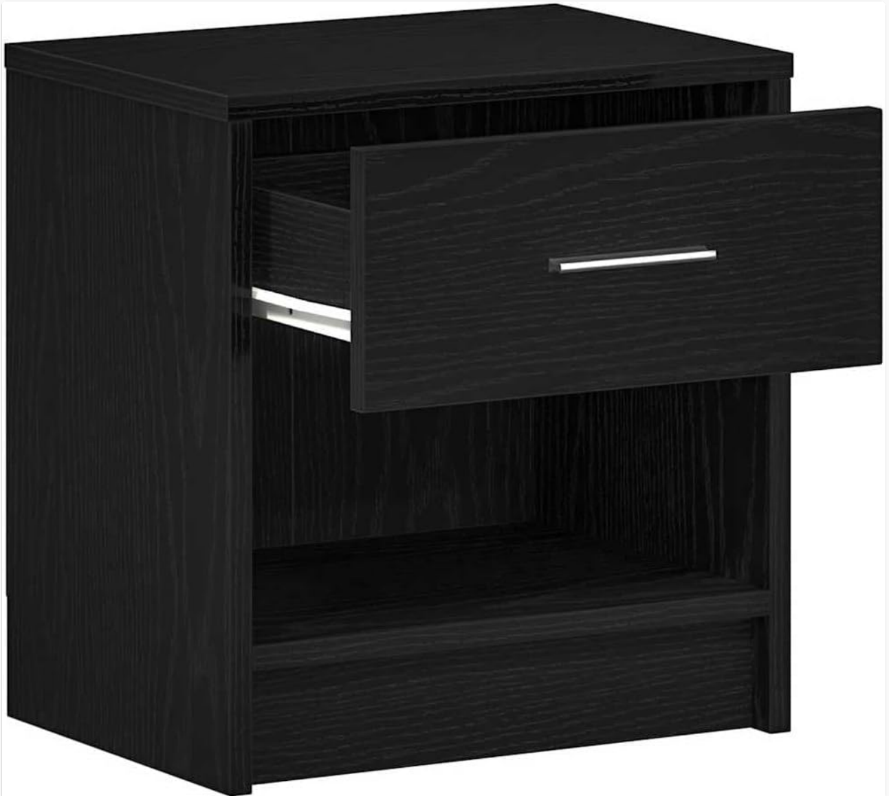
Image: A single bedside cabinet with its drawer pulled open, revealing the interior storage space and the drawer slides.