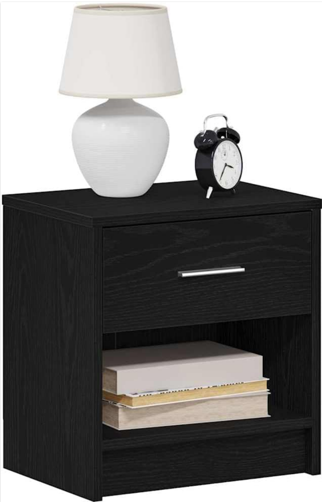
Image: A bedside cabinet in use, featuring a white lamp and a black alarm clock on its top surface, and books neatly stacked on the open shelf.