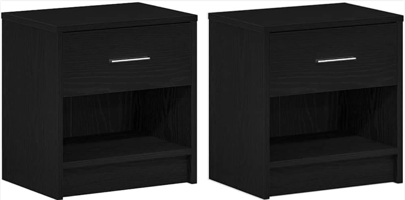
Image: A pair of vidaXL bedside cabinets, showcasing their sleek black finish and compact design.

This manual provides instructions for the assembly, operation, and maintenance of the vidaXL Bedside Cabinet Set of 2. These cabinets are designed to offer functional storage and complement various interior styles.