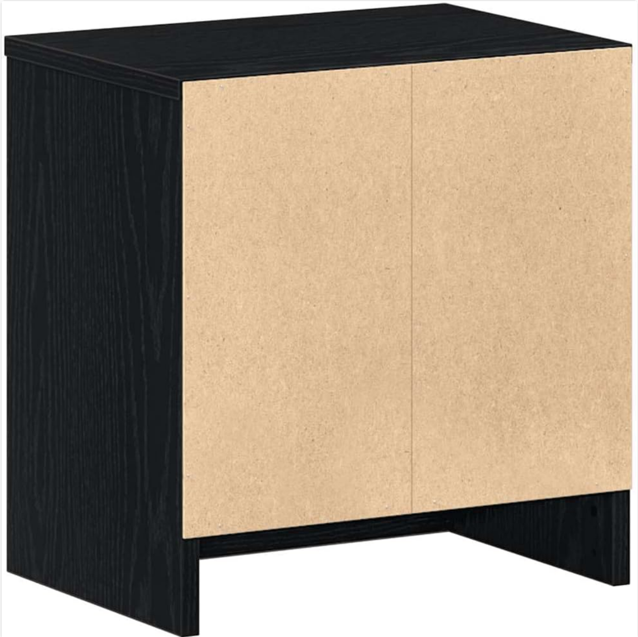
Image: The back view of the bedside cabinet, showing the engineered wood back panel which provides structural integrity.