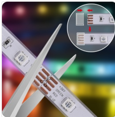
Image: Diagram showing where to safely cut the LED strip using scissors at the marked points.

The LED strips can be cut to your desired length. Look for the designated cutting marks (usually indicated by a scissor icon or copper pads) along the strip. Only cut at these marks to avoid damaging the circuit.