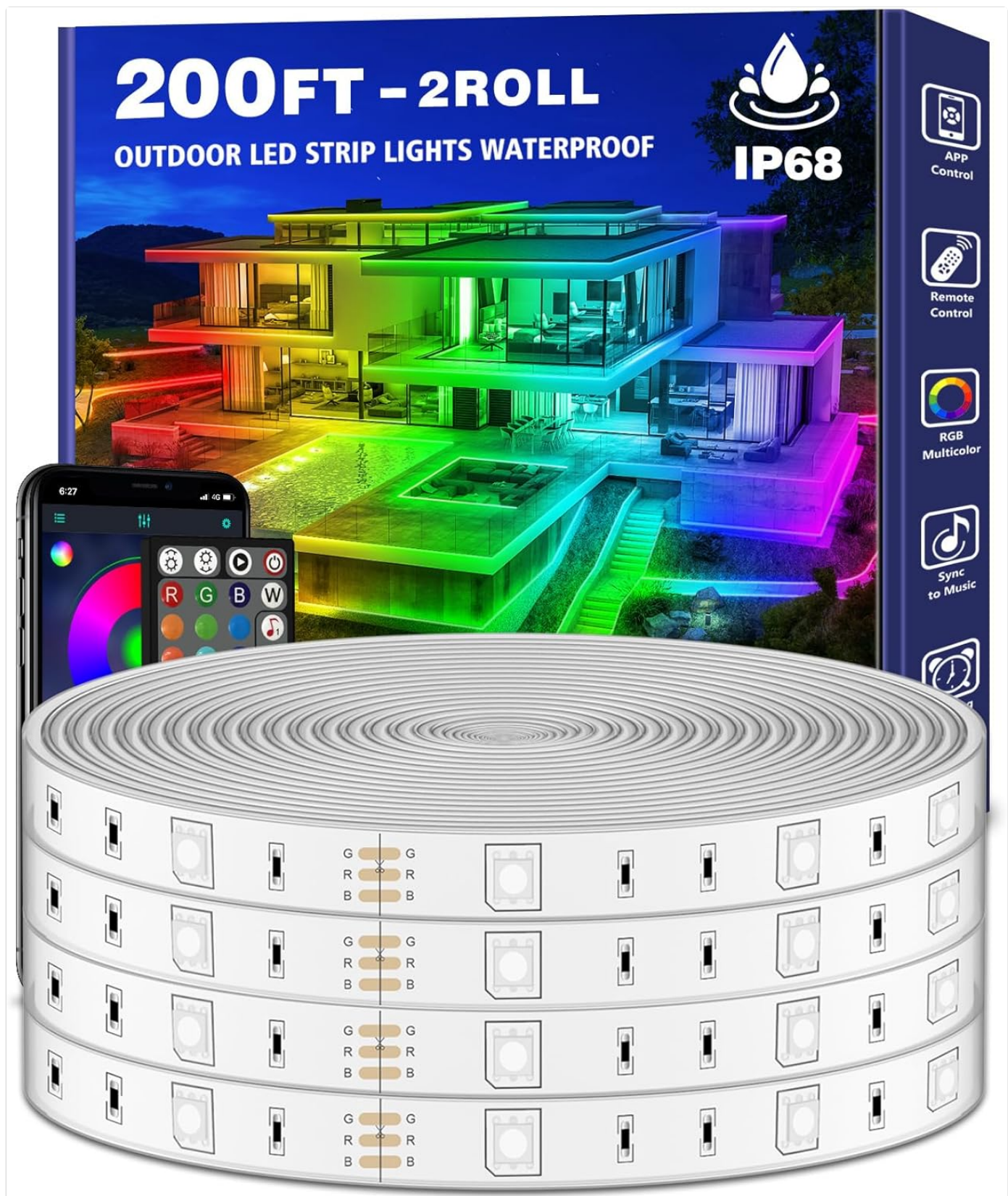
Image: Product packaging displaying the remote control and a smartphone with the app interface.