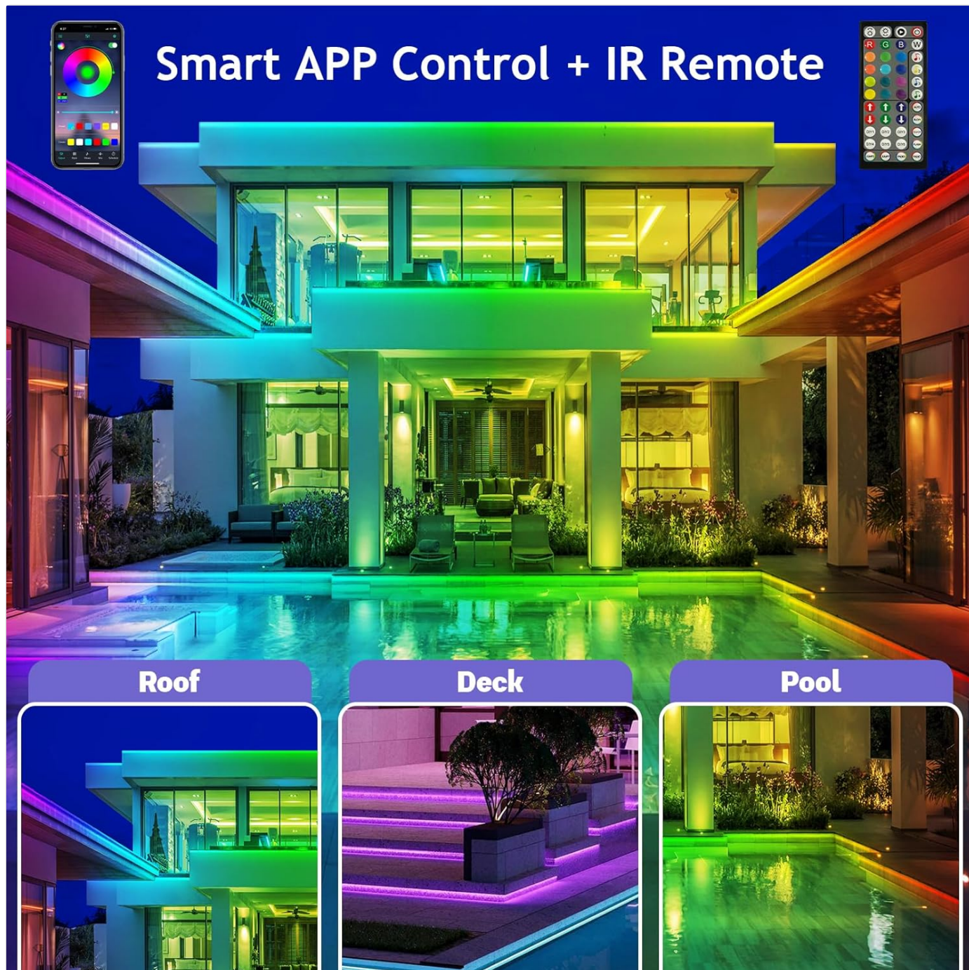
Image: Example installation of LED strip lights on a house, deck, and pool area, showcasing various applications.