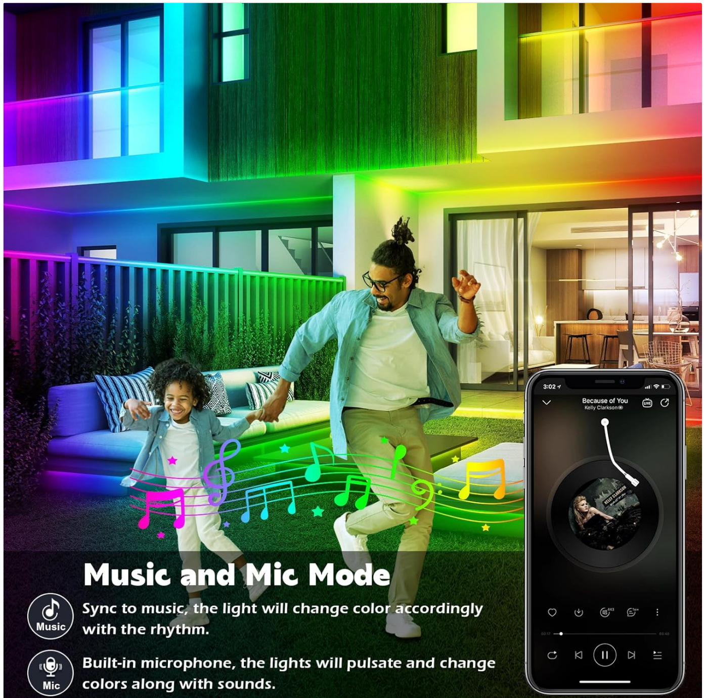
Image: A smartphone screen showing the "Lotus Lantern" app interface, highlighting the music and microphone sync features.