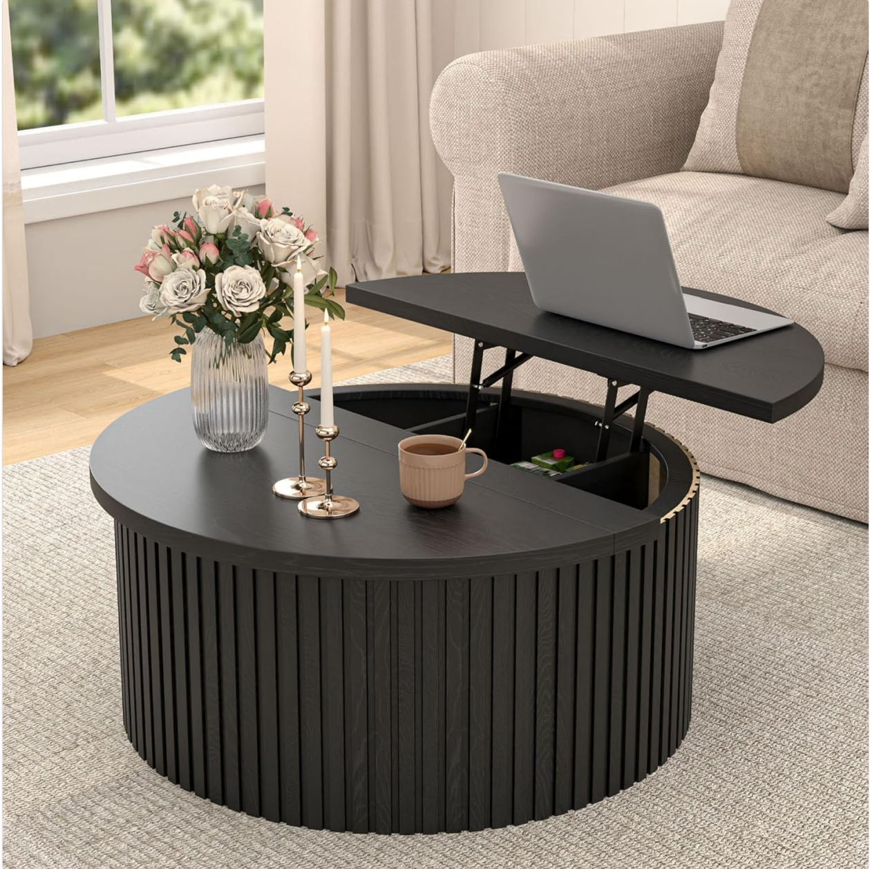
Image: The coffee table with its lift-top extended, providing an ergonomic surface for activities like using a laptop.

To raise the tabletop, gently pull the designated section of the tabletop upwards. The pneumatic struts will assist in a smooth and controlled lift. To lower, gently push the tabletop down until it rests securely in its closed position. Avoid forcing the mechanism.