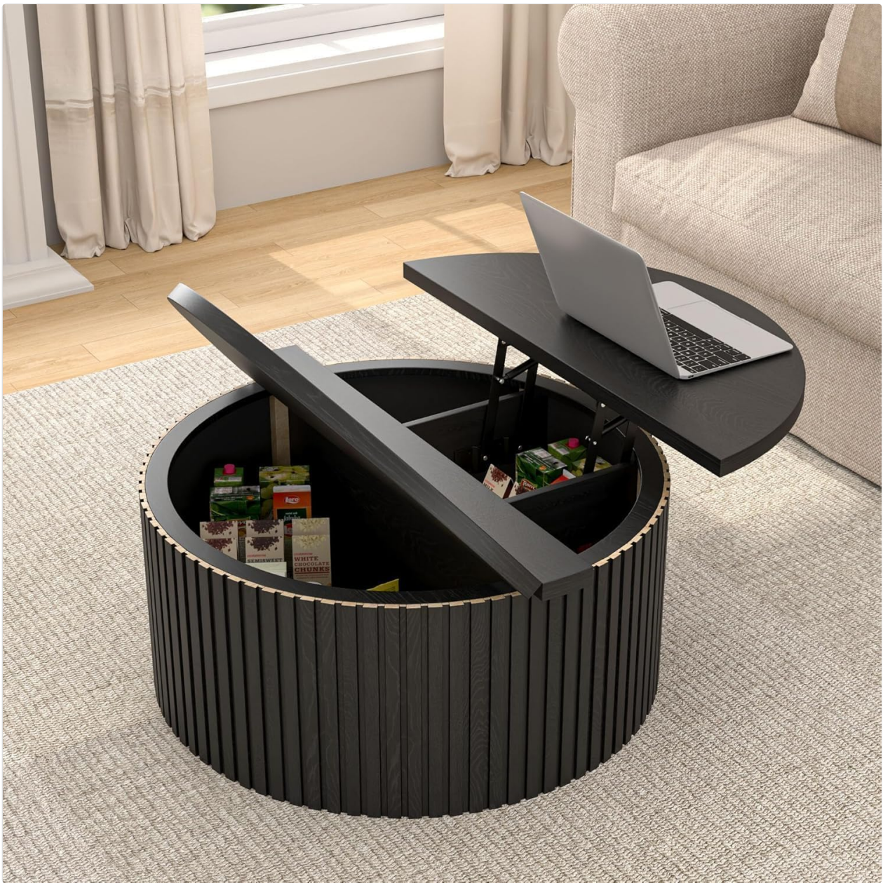
Image: The coffee table with its lift-top open, revealing the organized internal storage space.