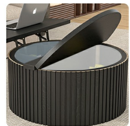
3 Large storage space