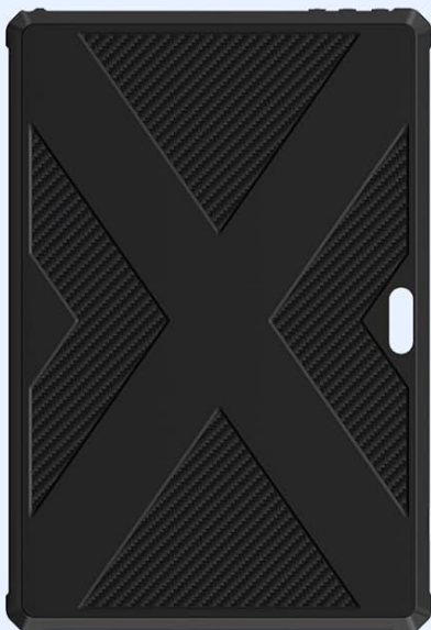
● Protective Case