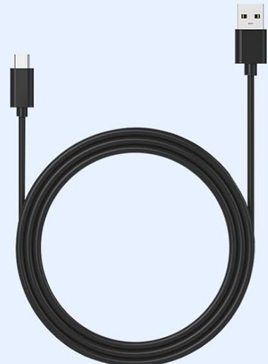
● Type-c Data Cable

Image: A visual representation of the tablet, protective case, USB-C cable, and power adapter included in the package.