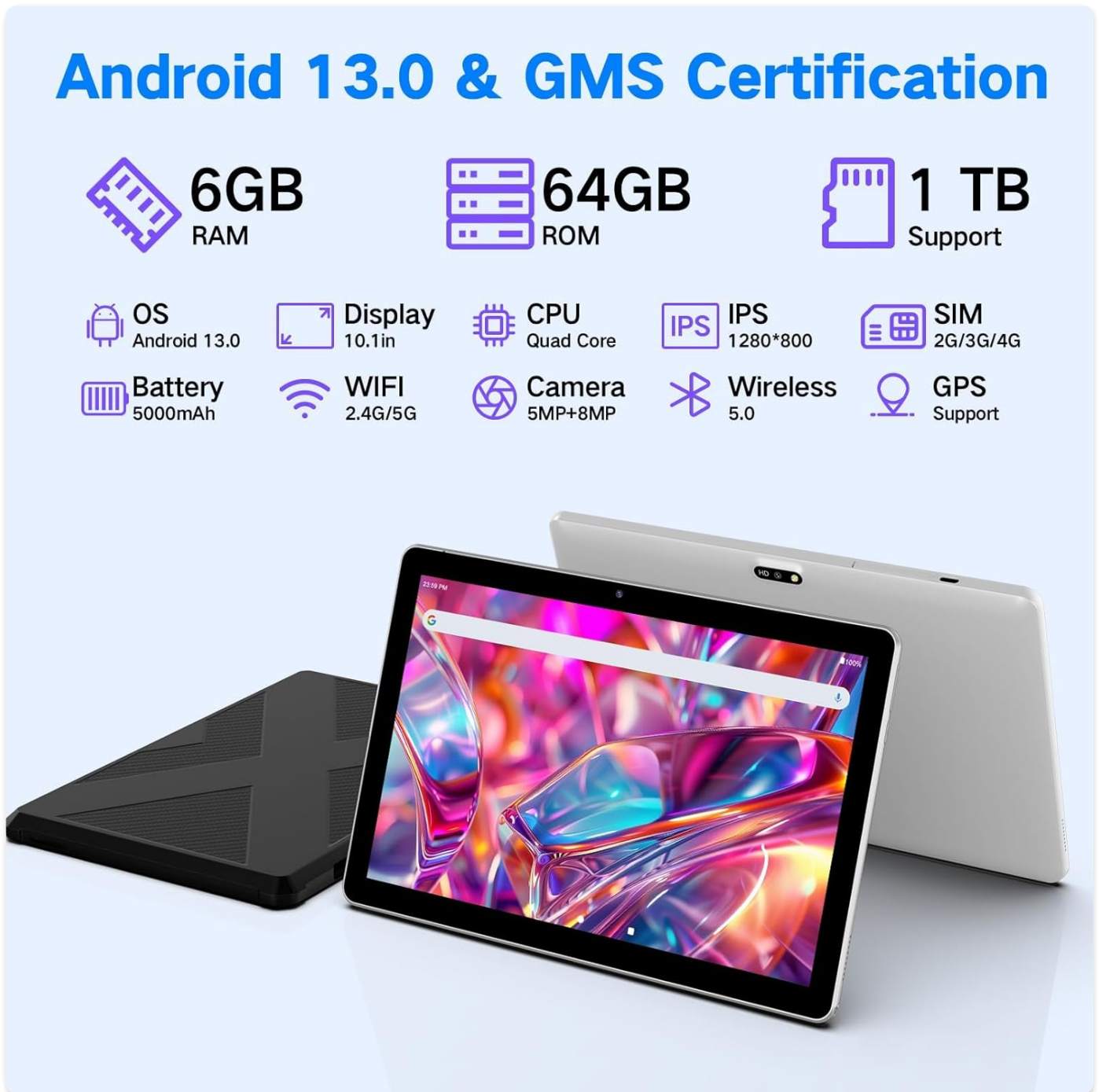
Image: Screenshot of the Android 13 home screen with an overlay highlighting key specifications like 6GB RAM, 64GB ROM, 1TB support, 5000mAh battery, and 10.1-inch IPS display.

Your tablet runs on Android 13. Swipe up from the bottom of the screen to access the app drawer. Swipe down from the top for notifications and quick settings.