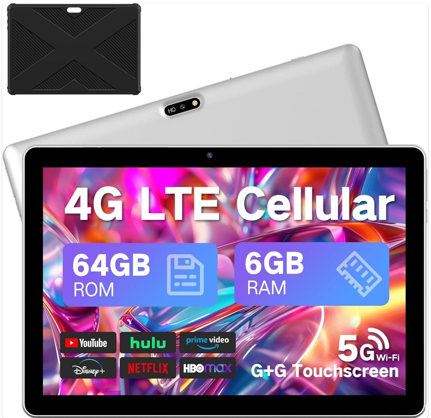
Image: Front view of the LECTRUS Android Tablet 10.1 inch, showcasing its display and the included protective case.