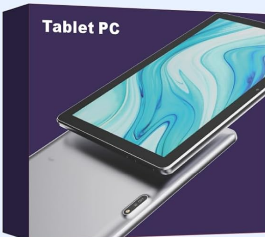
● Quality Packaging Box