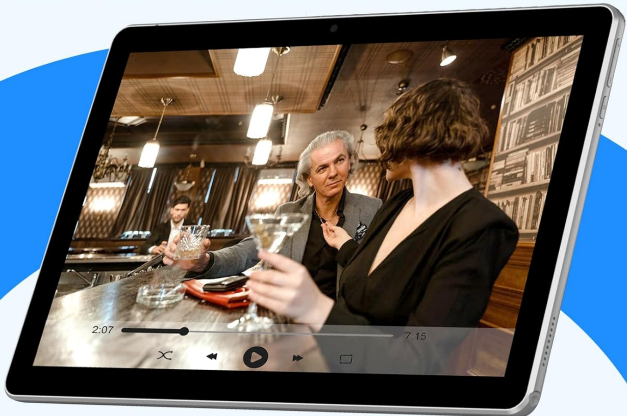
Image: A tablet displaying a video, emphasizing its long battery life with a prominent "5000mAh" graphic.