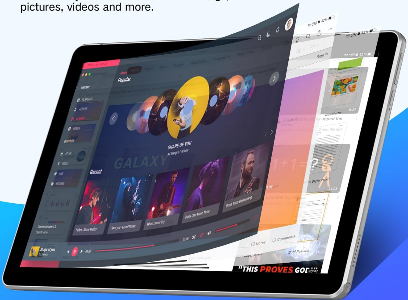
Image: A tablet screen displaying various media files and applications, illustrating the ample storage capacity.

The tablet supports 1TB TF card expansion. It can easily store various files like songs, pictures, videos and more.