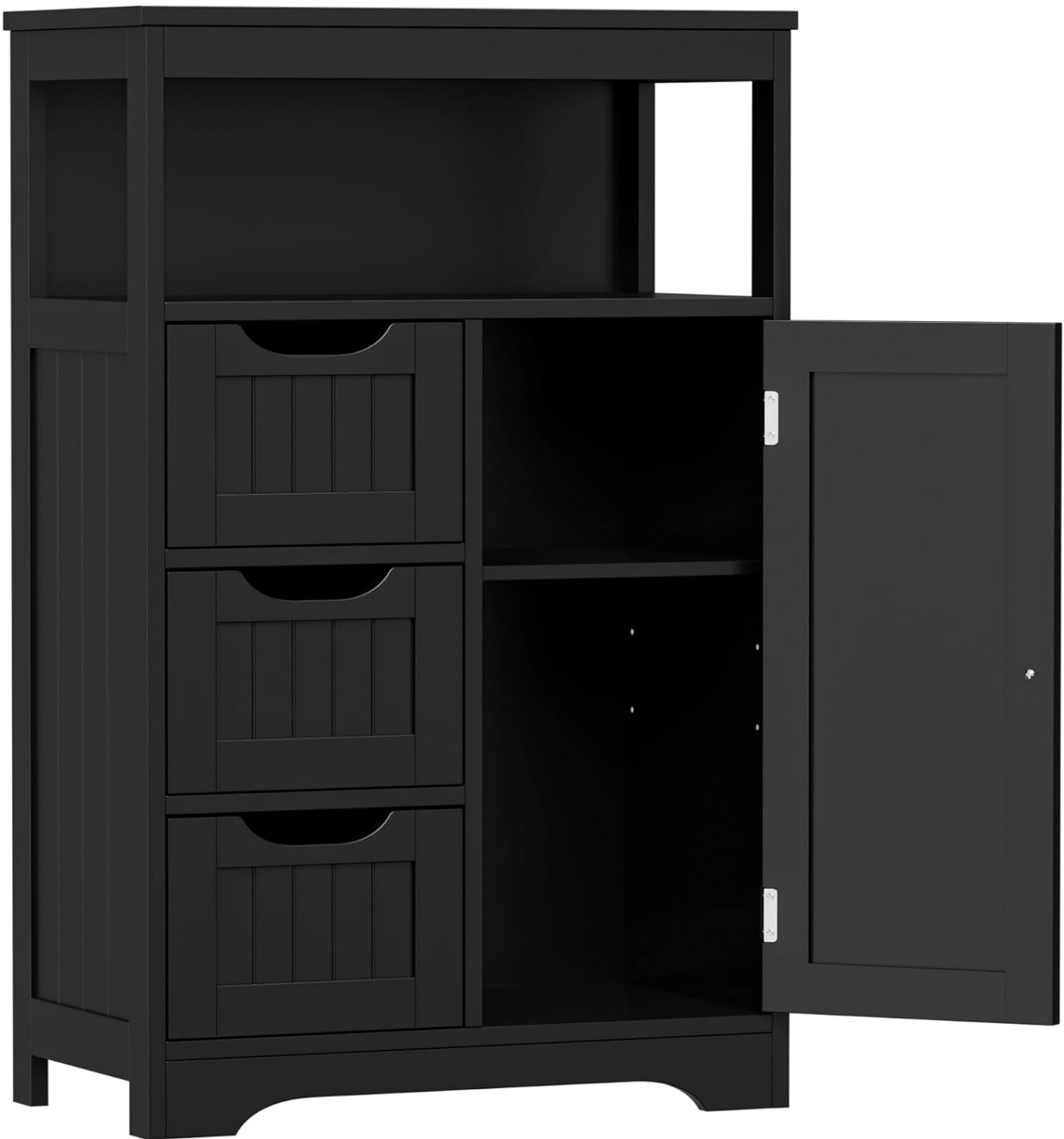
Image 1.1: Front view of the assembled ZENY Bathroom Floor Cabinet.