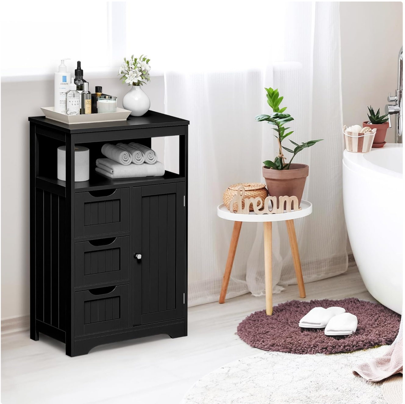
Image 6.1: The cabinet positioned in a bathroom, demonstrating its use for storing towels and toiletries.