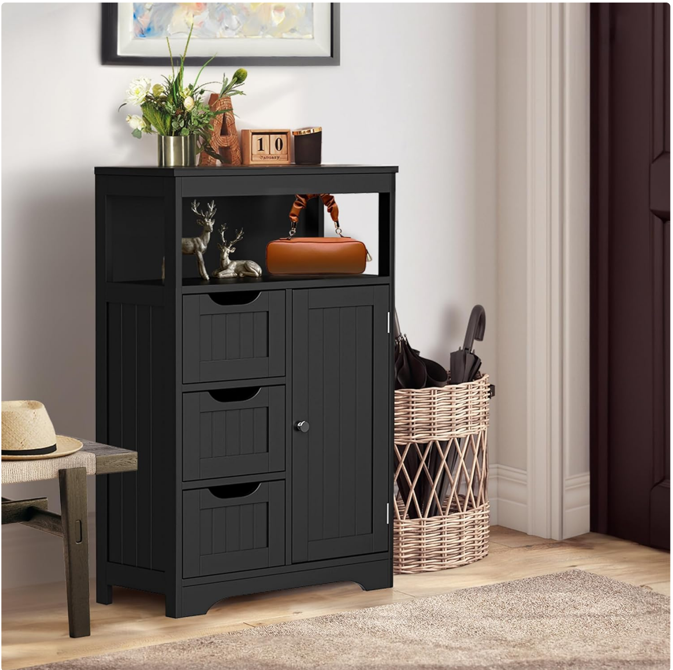
Image 6.2: The cabinet used in a living room, showcasing its versatility as an accent furniture piece.