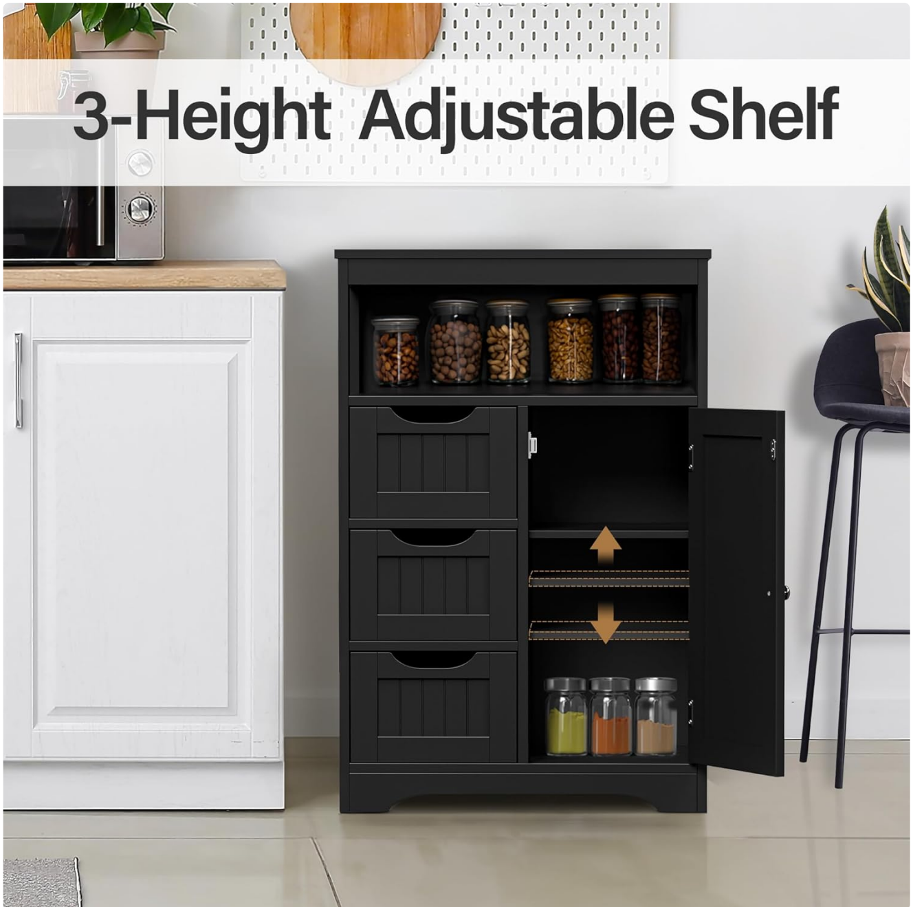
Image 5.1: The cabinet features a 3-height adjustable shelf, allowing customization of storage space. This image shows the shelf being adjusted.