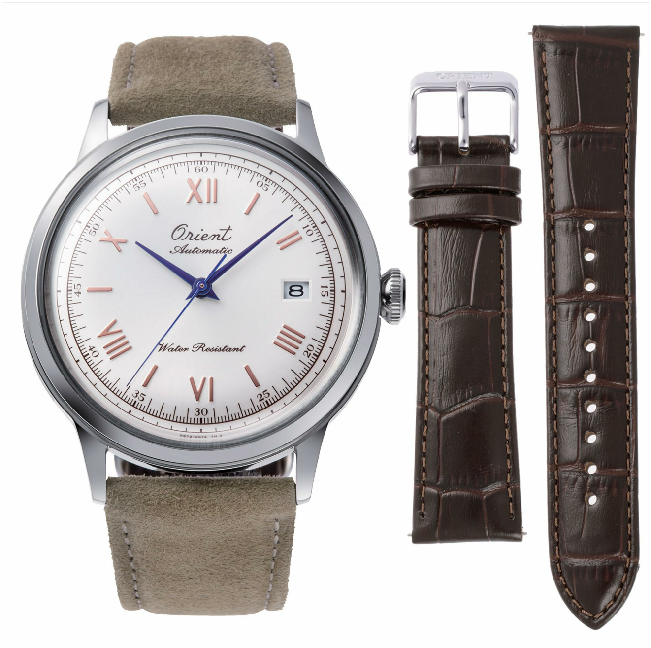
Figure 1.1: Front view of the Orient RA-AC0027S watch, showcasing its white dial with Roman numerals, blue hands, and beige leather strap.