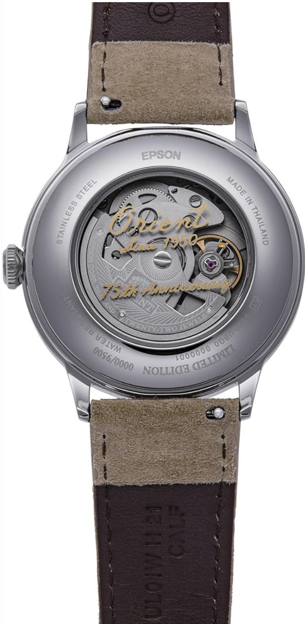
Figure 6.1: Rear view of the watch, featuring the exhibition caseback that reveals the mechanical movement (Calibre F6724) and its