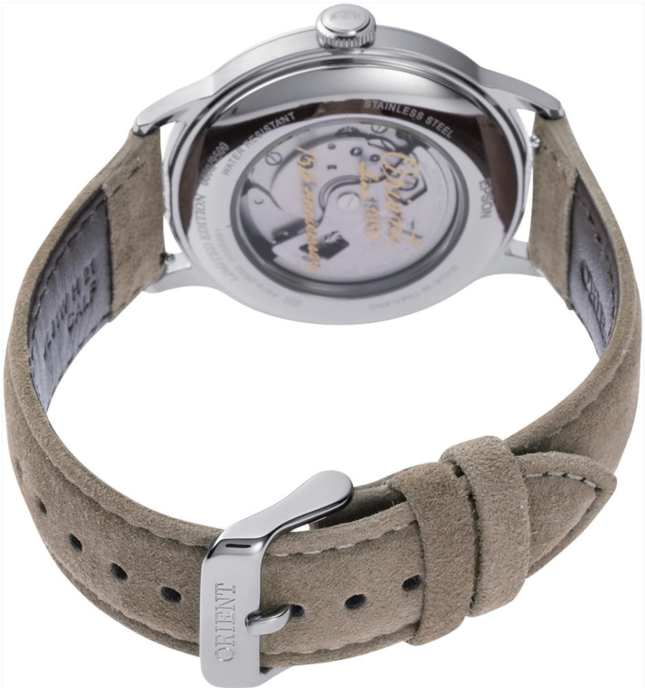
Figure 2.2: Rear view of the watch, showing the beige leather strap and the buckle closure with the Orient logo.