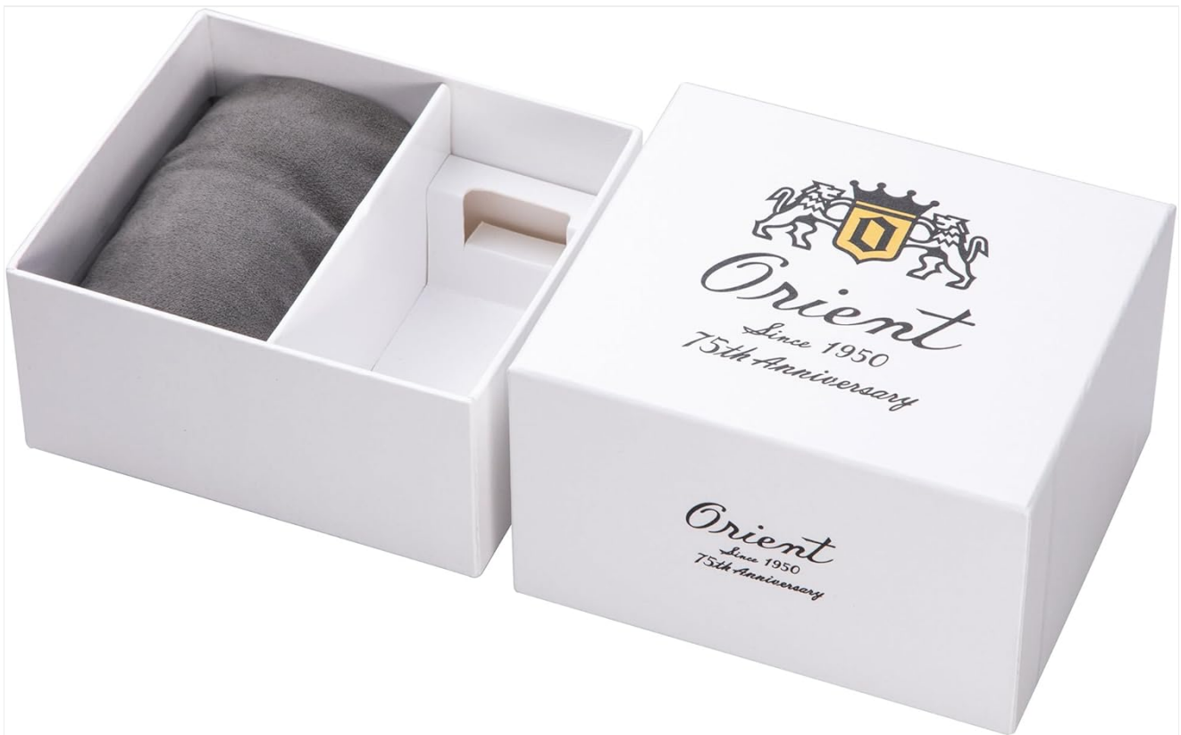
Figure 4.1: The Orient RA-AC0027S watch presented in its white box, suitable for storage.

When not wearing the watch for extended periods, store it in a cool, dry place away from direct sunlight, extreme temperatures, and strong magnetic fields. The original watch box is suitable for storage.