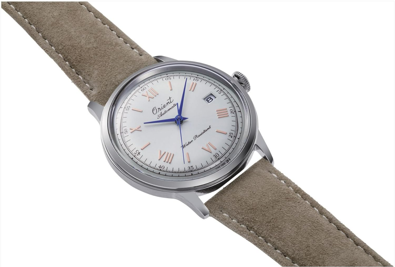
Figure 2.1: Angled view of the watch, highlighting the crown on the side, used for winding and setting.