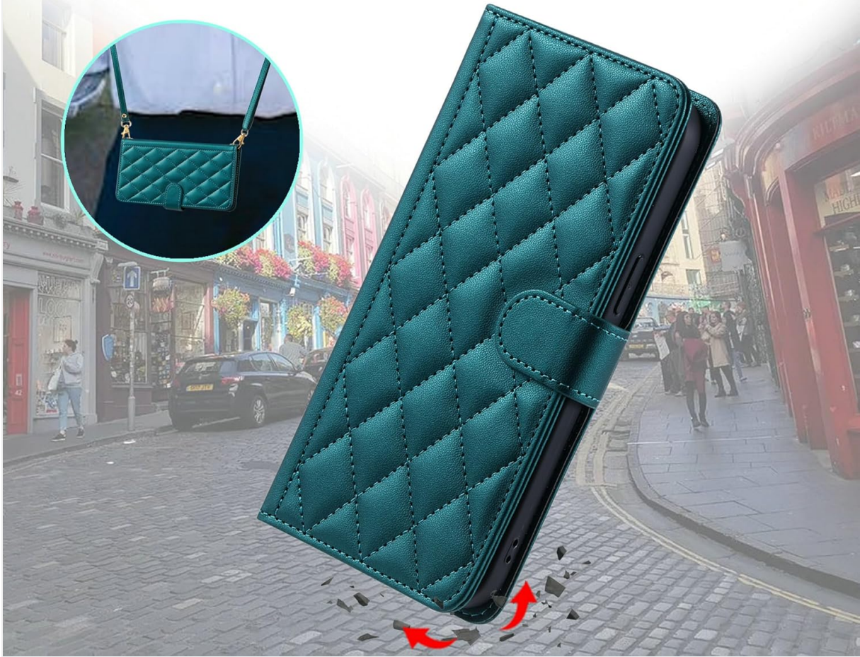
Figure 6: Illustrates the protective qualities of the case's soft material and design.

Premium leather&soft TPU inner shell provides your phone full body protection.