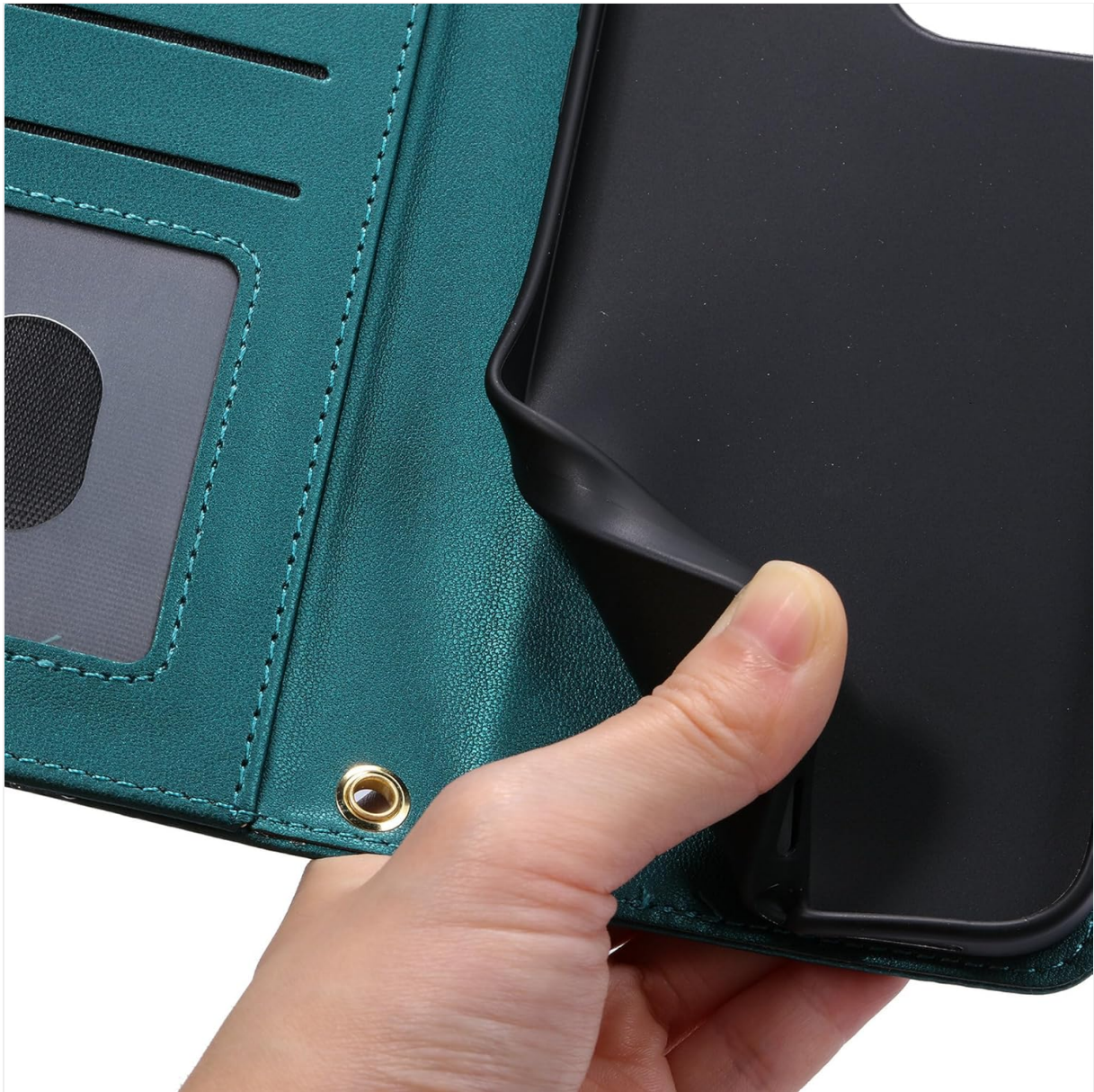
Figure 1: Illustrates the process of inserting the phone into the flexible TPU inner shell for secure placement.