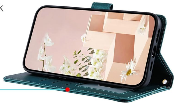
Figure 2: Demonstrates the case configured as a kickstand for horizontal viewing.