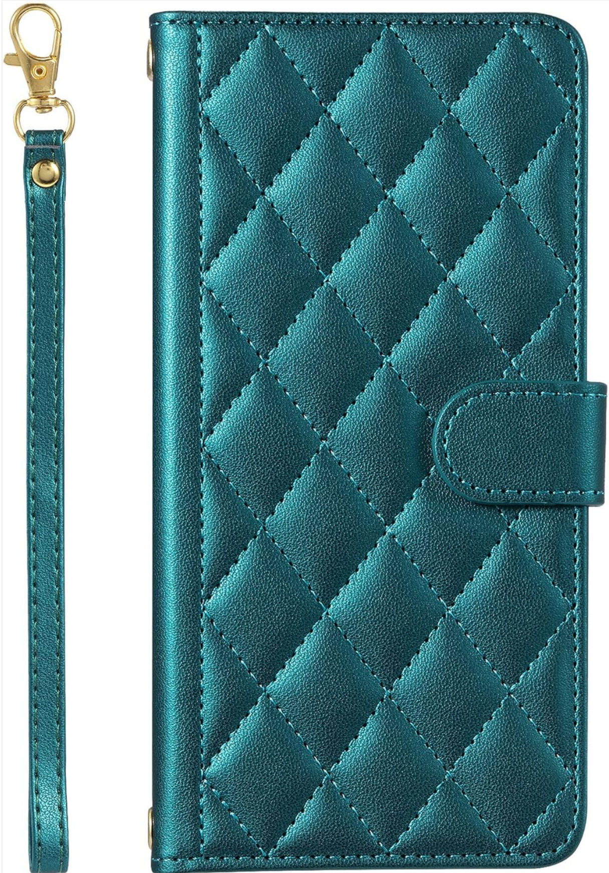
Figure 5: Shows the case with the included short lanyard attached.