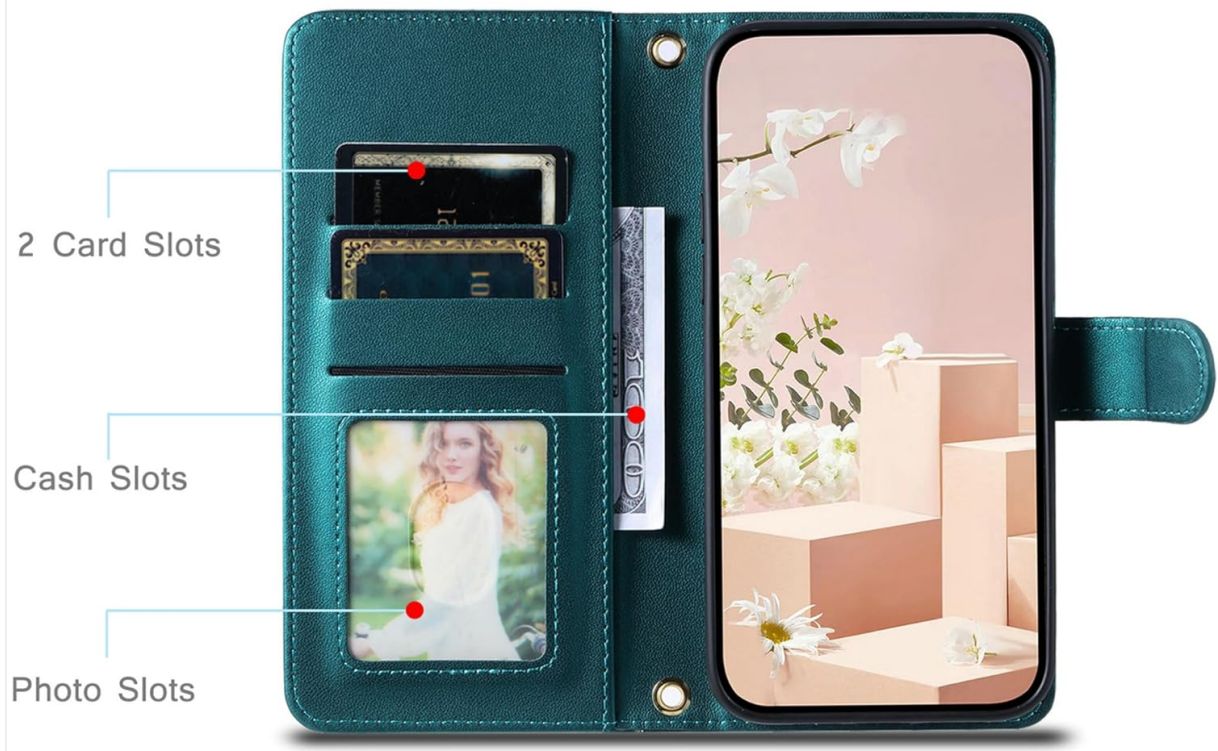
Figure 3: Displays the internal wallet compartments for cards, cash, and photos.

Combines 2 card slots +1 photo slot+1 cash slot. High quality materials, multifunctional, lightweight design.