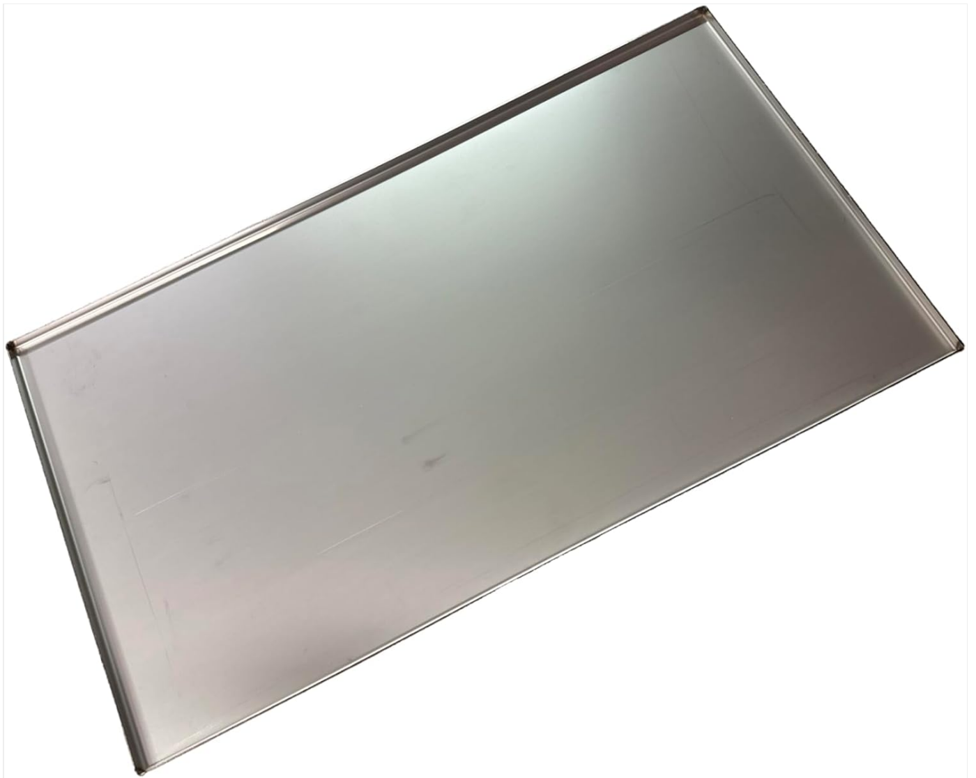
Figure 1.1: The EWH Stainless Steel Grease Tray, showcasing its sleek, rectangular design and metallic finish. This image provides a clear view of the tray's surface and raised edges.