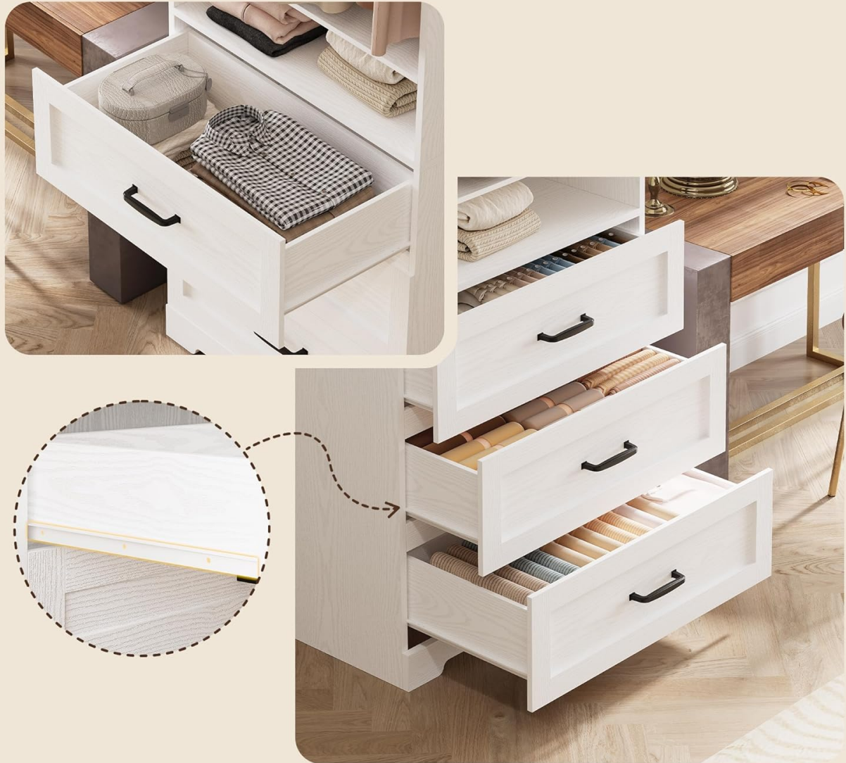
Image 5.2: Detailed view of the three large-capacity drawers, highlighting their smooth sliding mechanism.