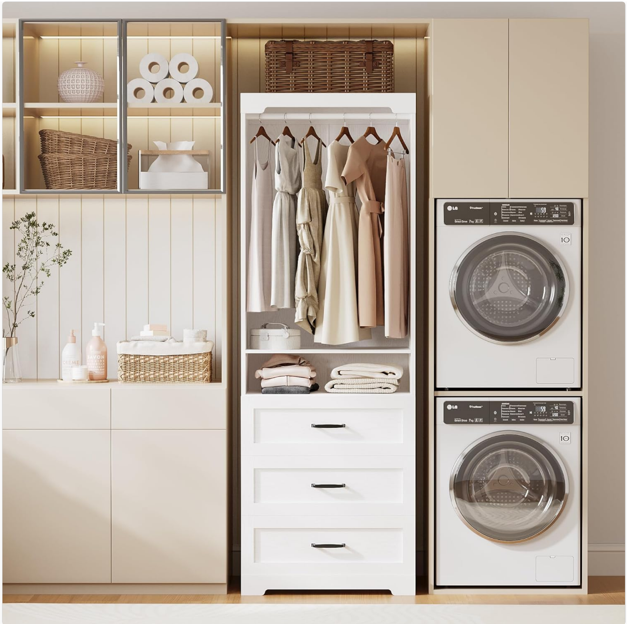
Image 1.2: The closet system integrated into a laundry room, demonstrating its versatility for various home environments.