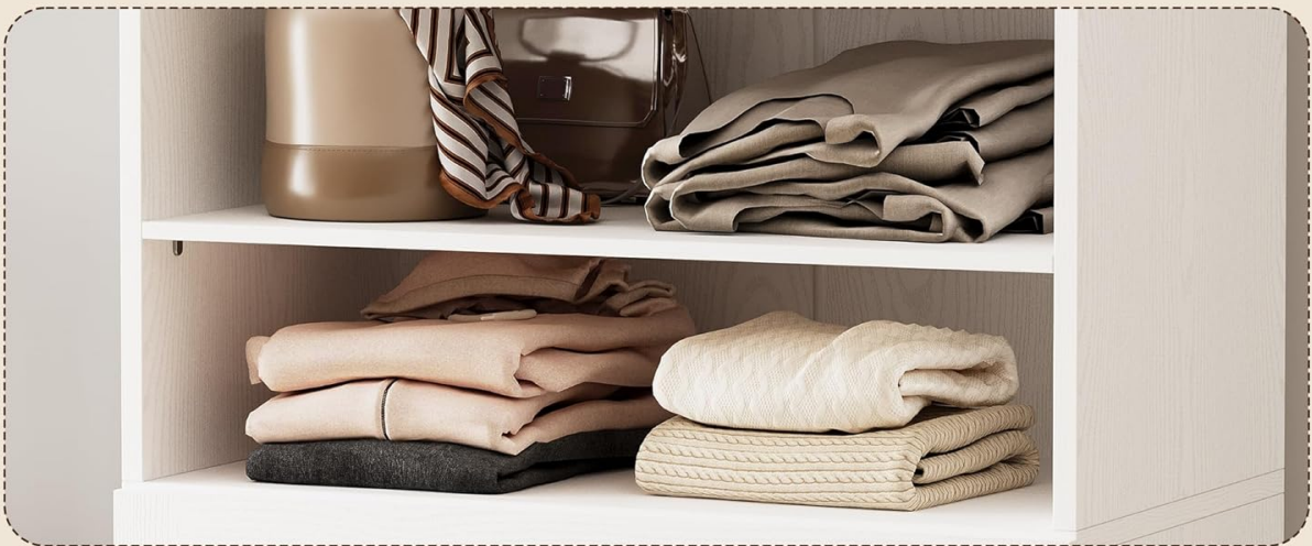
open storage compartment