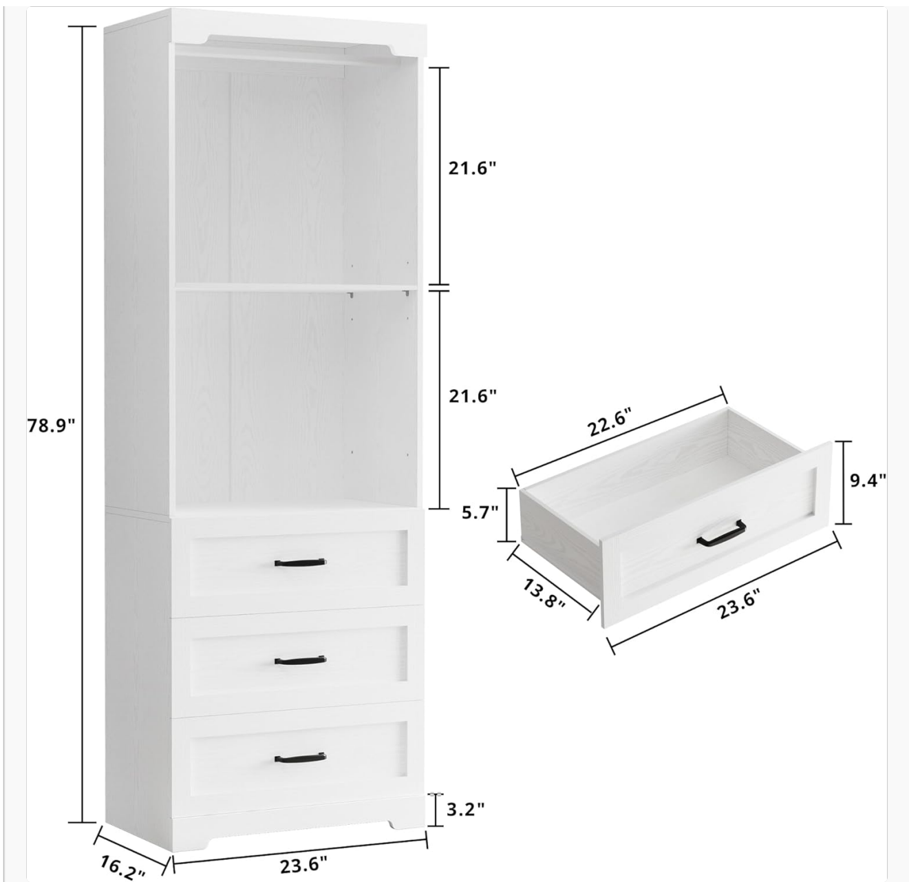
Image 4.1: Dimensional diagram of the IRONCK Freestanding Closet System, including overall height, width, depth, and drawer dimensions.