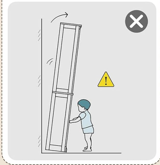
Image 2.1: Illustration of anti-tipping accessories and their correct installation to ensure stability and safety.