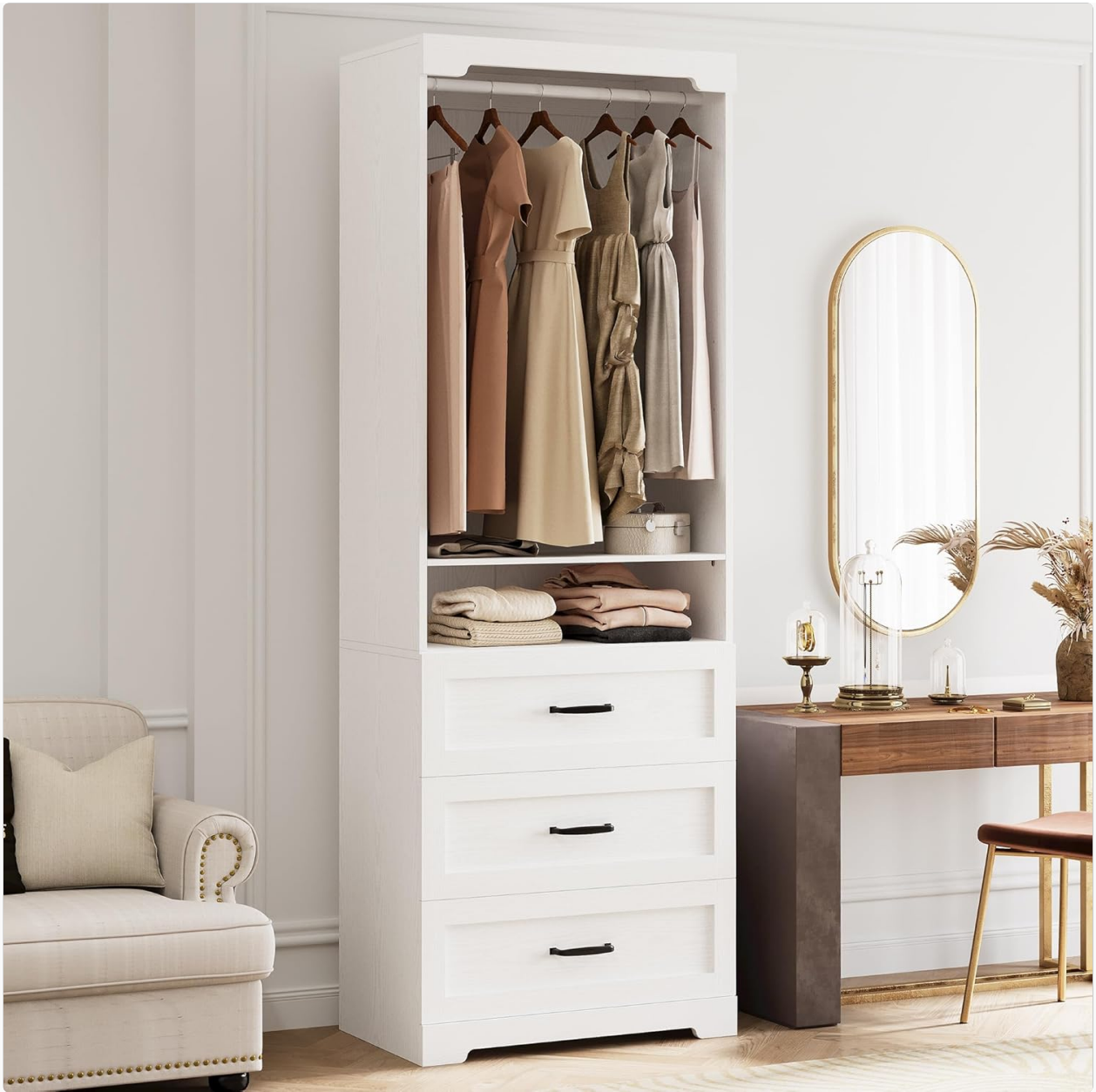
Image 1.1: The IRONCK Freestanding Closet System (Model HK-YG-07) in a bedroom environment, showcasing its design and storage capabilities.