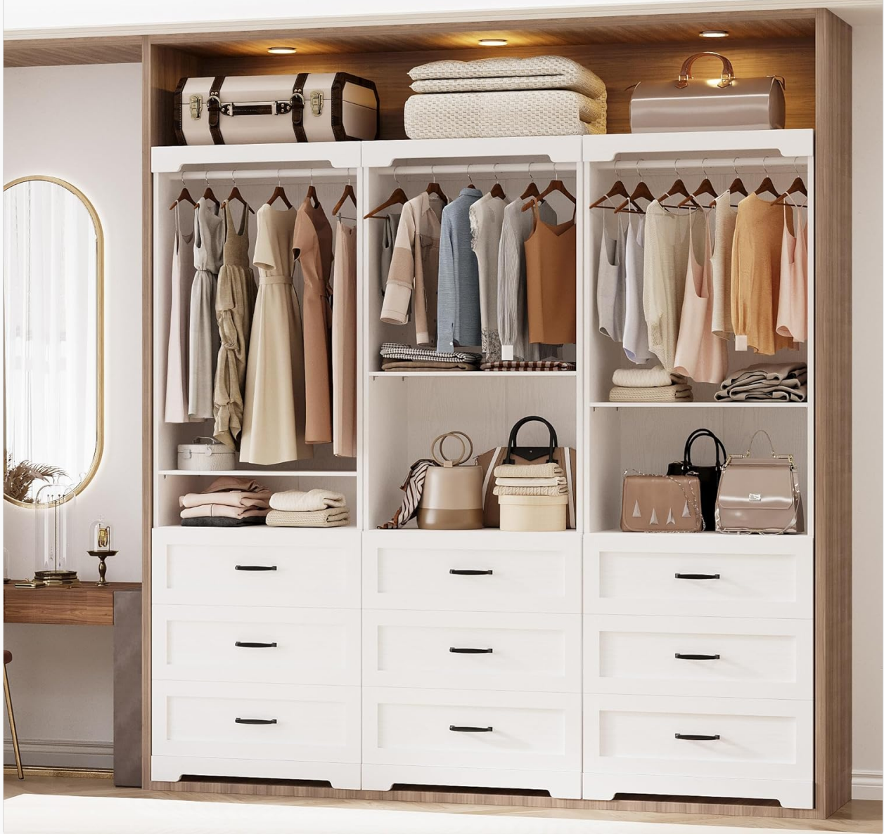
Image 1.3: Several IRONCK closet systems arranged together, illustrating their modular design for expanded storage solutions.