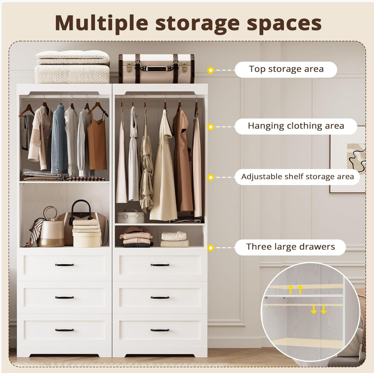
Image 5.1: Overview of the closet system's storage zones, including the top storage area, hanging clothing area, adjustable shelf storage area, and three large drawers.

The integrated hanging rod is suitable for garments such as shirts, blouses, and shorter dresses. For longer items, adjust the shelves below to create more vertical space.