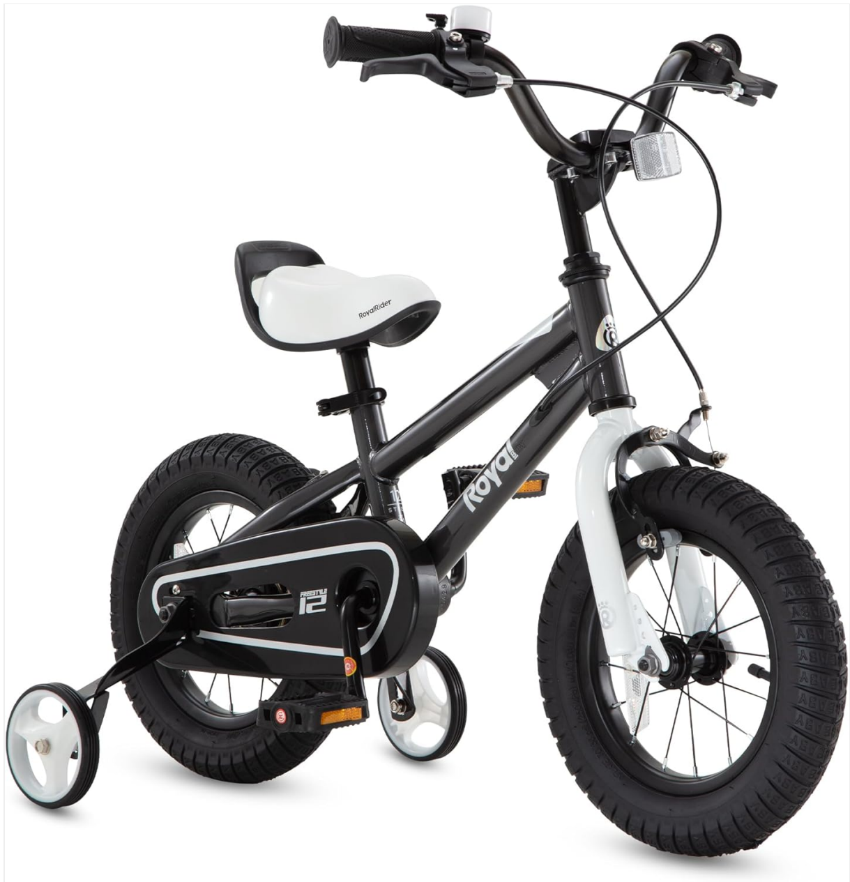
Image 1.1: The RoyalBaby FS-5 Freestyle Kids Bicycle, 12-inch model, in black with white fork and saddle, equipped with training wheels.