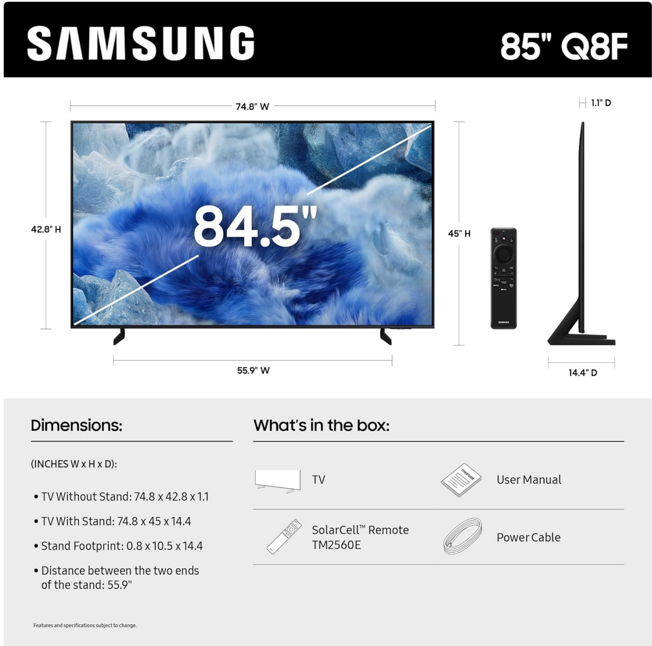
Figure 2.1: Diagram illustrating the TV dimensions and the contents of the retail package.