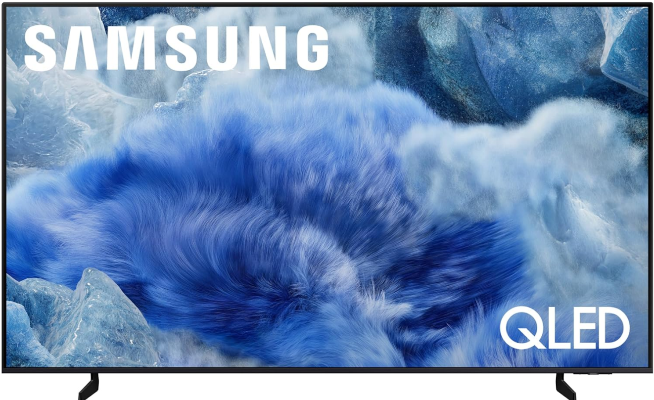
Figure 1.1: Front view of the Samsung 85-Inch QLED Q8F Smart TV, showcasing its slim design and vibrant display.

The Samsung 85-Inch Class QLED Q8F 4K UHD Smart TV (2025 Model) delivers an immersive viewing experience with its Q4 AI Processor, 100% Color Volume with Quantum Dot technology, and a sleek AirSlim Design. This smart TV integrates Samsung Vision AI for enhanced picture and sound, and offers access to a vast array of free content channels. It is designed to provide vibrant visuals and dynamic audio, adapting to your content for an optimized entertainment experience.