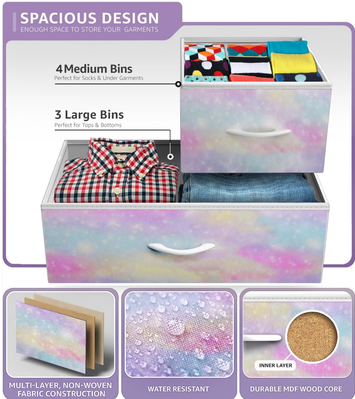
Figure 3: Fabric drawers with reinforced bases and ample storage capacity.

Unfold each fabric drawer. Insert the reinforced base panel into the bottom of each drawer to give it shape and stability. Attach the handles to the front of each drawer using the provided screws and Allen wrench. Once assembled, slide the drawers into their respective slots within the steel frame.