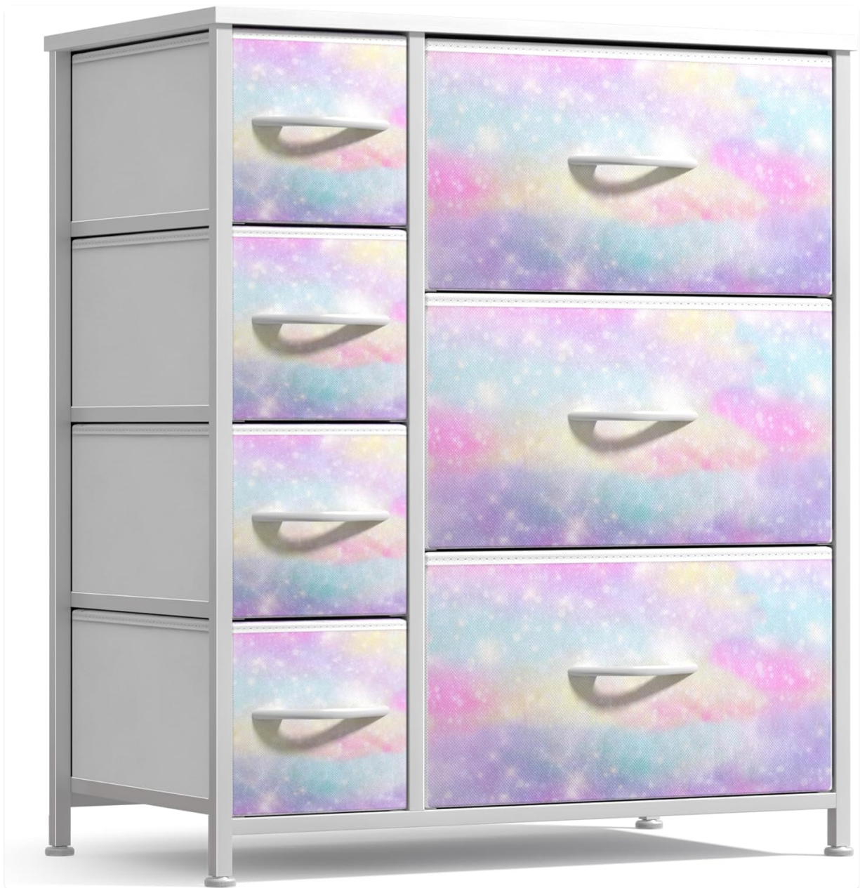
Figure 1: Fully assembled Sorbus Kids Dresser with 7 Drawers in Rainbow Sparkle.