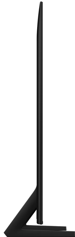
Figure 2: Included components with the Samsung Q8F TV.