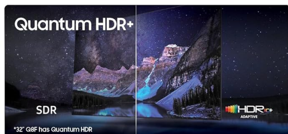
Figure 3: Visual representation of the Samsung Q8F TV's key features.