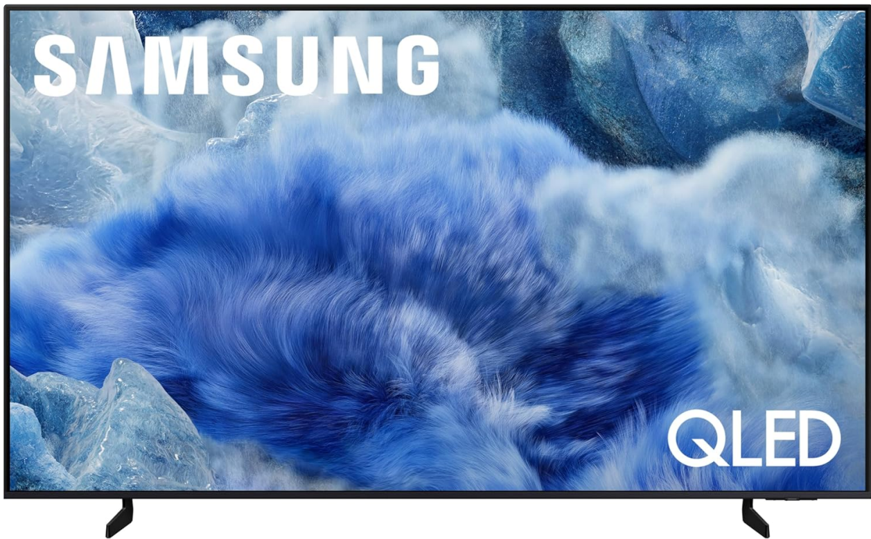
Figure 1: Front view of the Samsung 75-Inch Class QLED Q8F 4K UHD Smart TV.