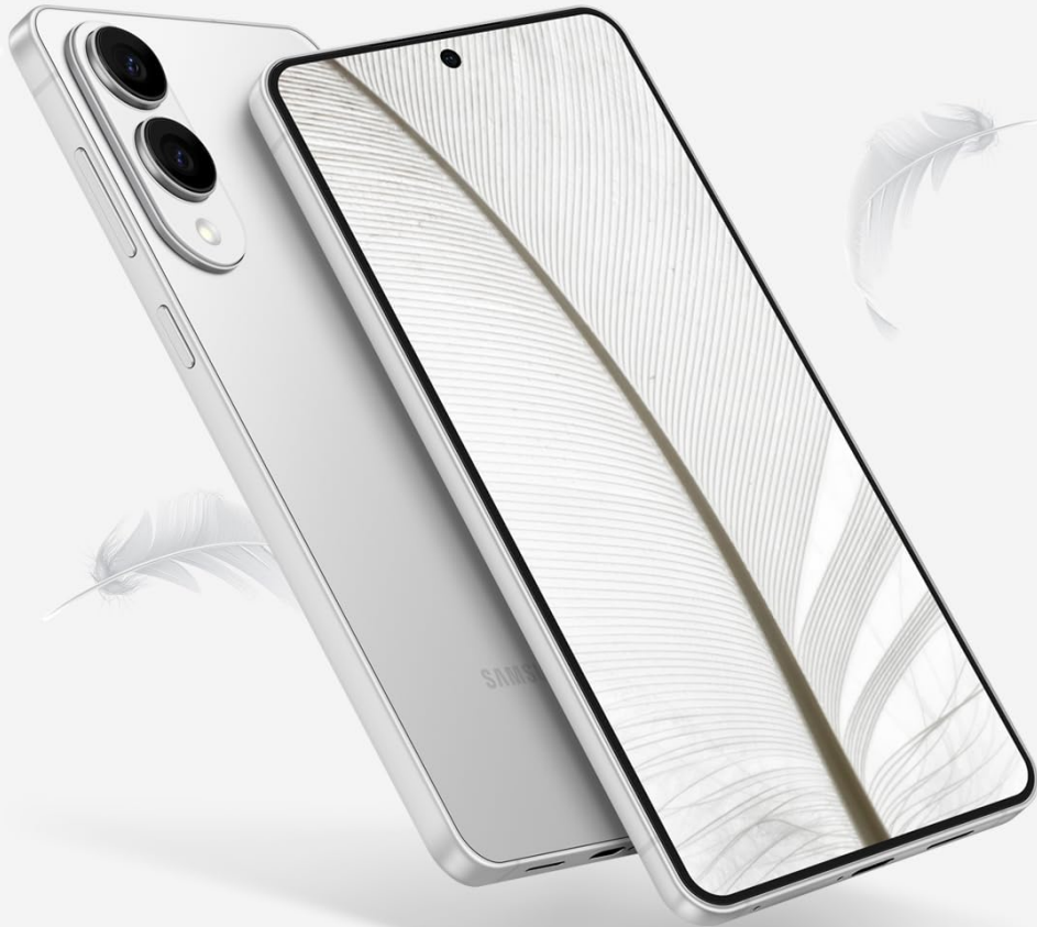
Image: A close-up of the Galaxy S25 Edge's camera system and display, highlighting its ability to capture fine details.

Get our powerful 200MP camera on our slimmest S Series phone