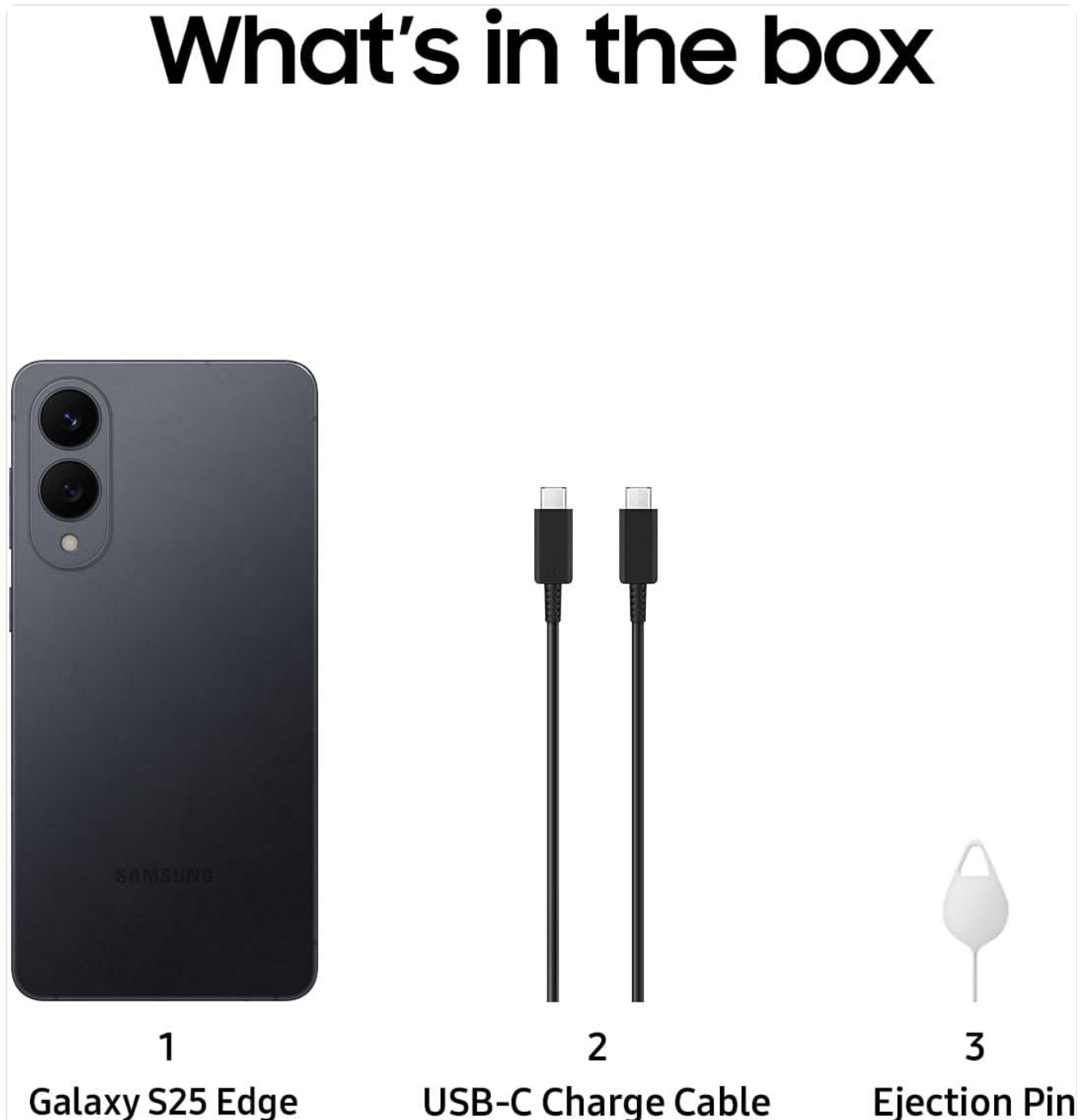
Image: The retail box contents, including the Galaxy S25 Edge phone, USB-C cable, and SIM tray ejector.