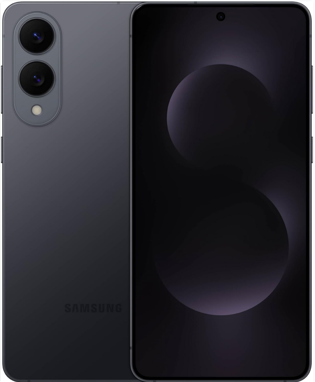
Image: SAMSUNG Galaxy S25 Edge Phone, Titanium Jetblack, showcasing its sleek design from front and back.