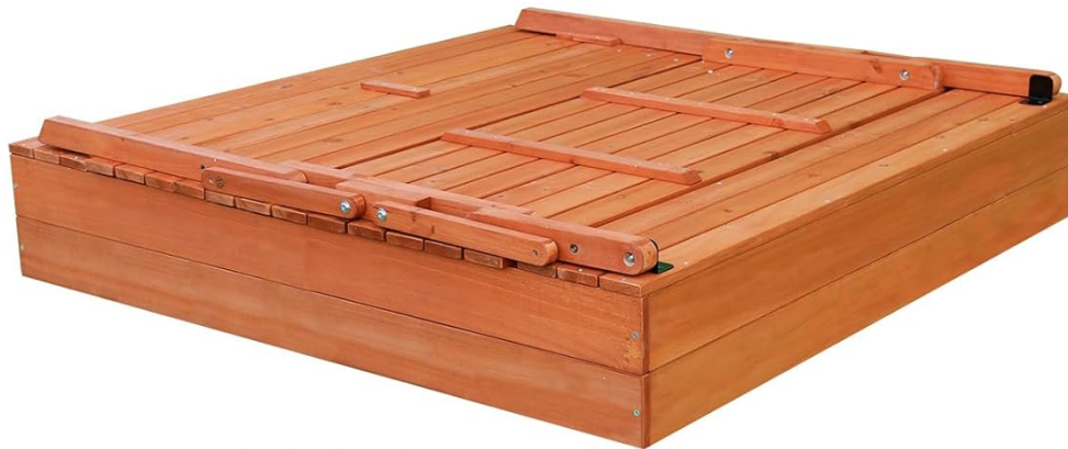
Image 3.2: Visual guide demonstrating the conversion of the picnic table into a sandbox cover.