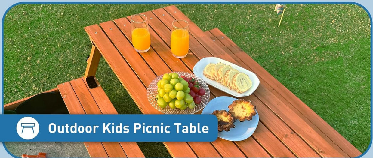
Image 4.1: The product's dual functionality as a sandbox and an outdoor picnic table.

Your browser does not support the video tag.