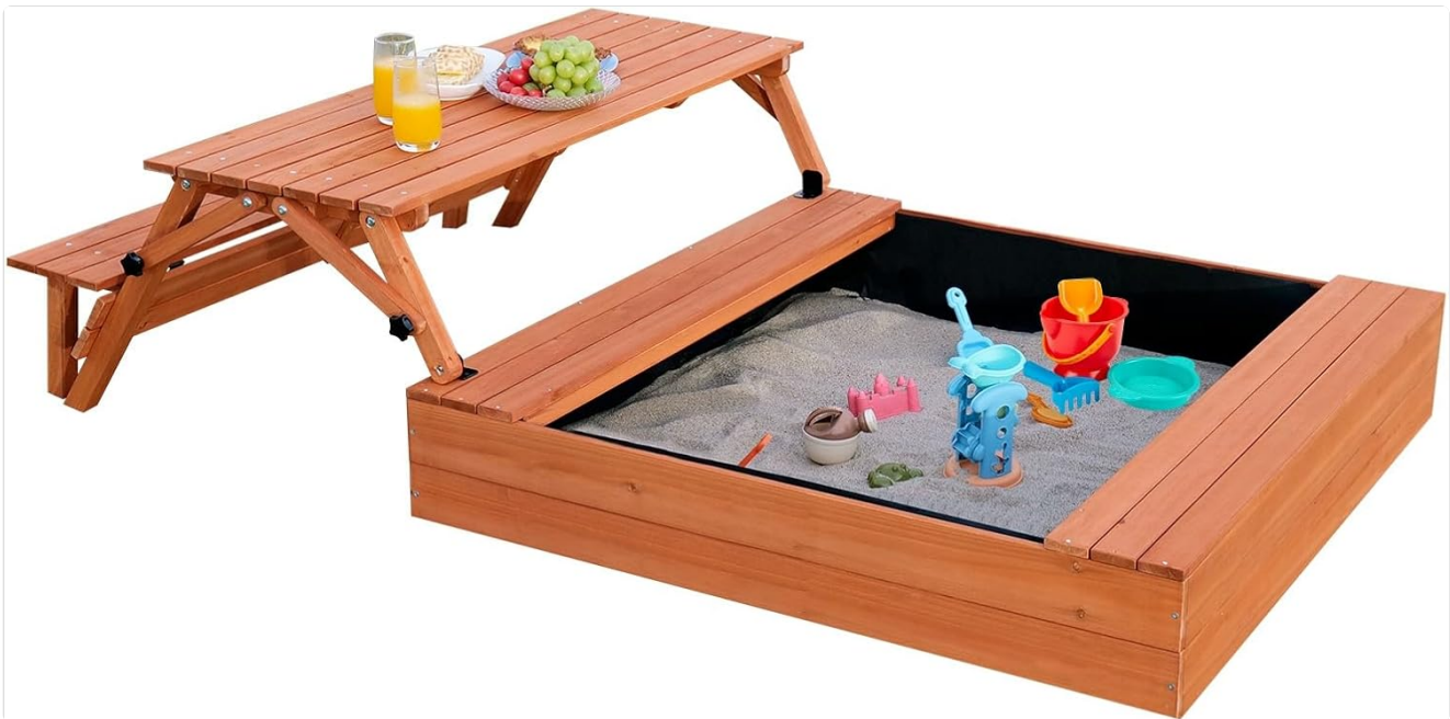
Image 2.1: Overview of the FunXplore Wooden Kids Sandbox with Lid and Picnic Table.