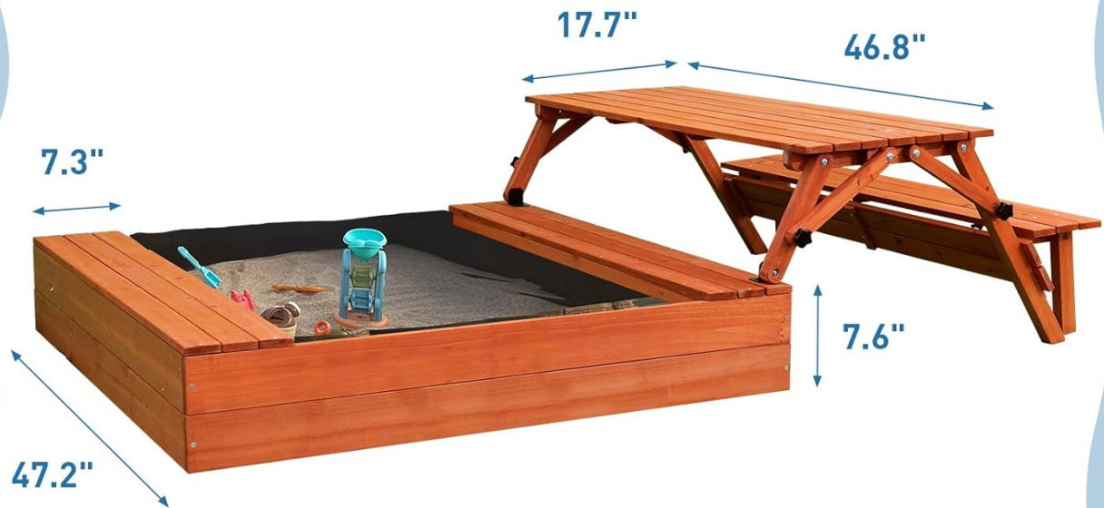
Image 7.1: Detailed product dimensions for the FunXplore Wooden Kids Sandbox.