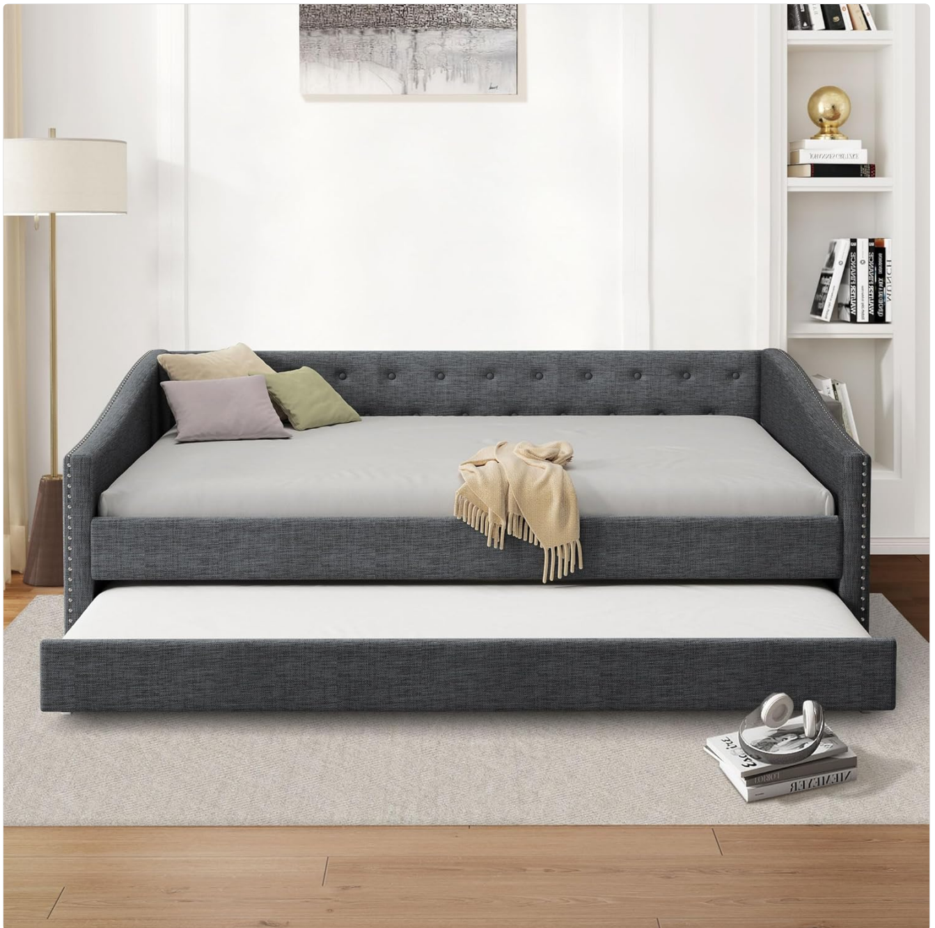
Image: The FAVSH Full Size Upholstered Daybed with Trundle in Dark Grey, shown with pillows and a blanket, featuring its main bed and the trundle pulled out slightly.