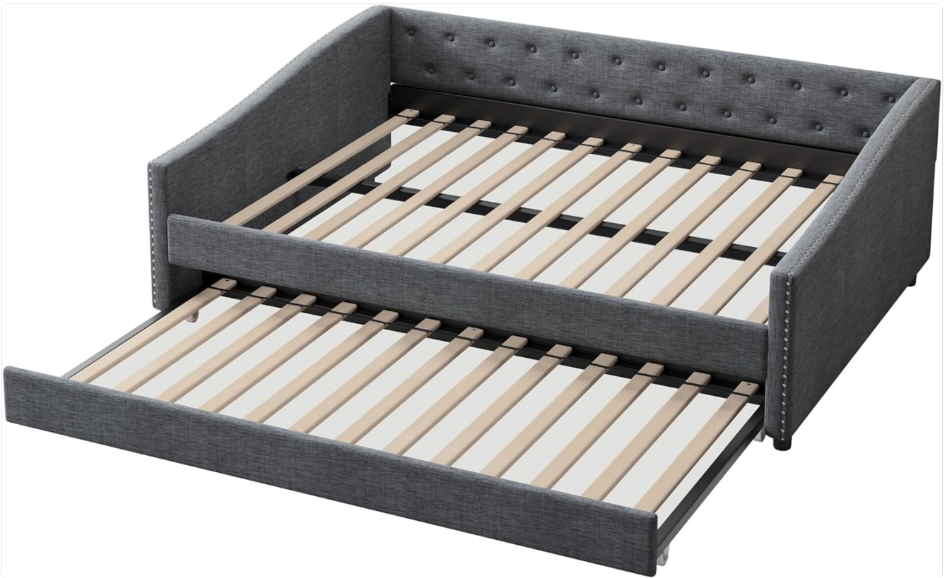
Image: The FAVSH daybed with the trundle fully extended, showcasing the additional sleeping surface.