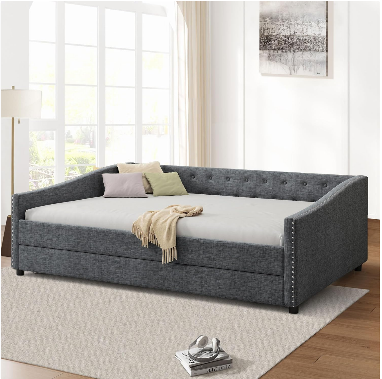
Image: A side view of the assembled daybed, showing the upholstered arms and the trundle unit.