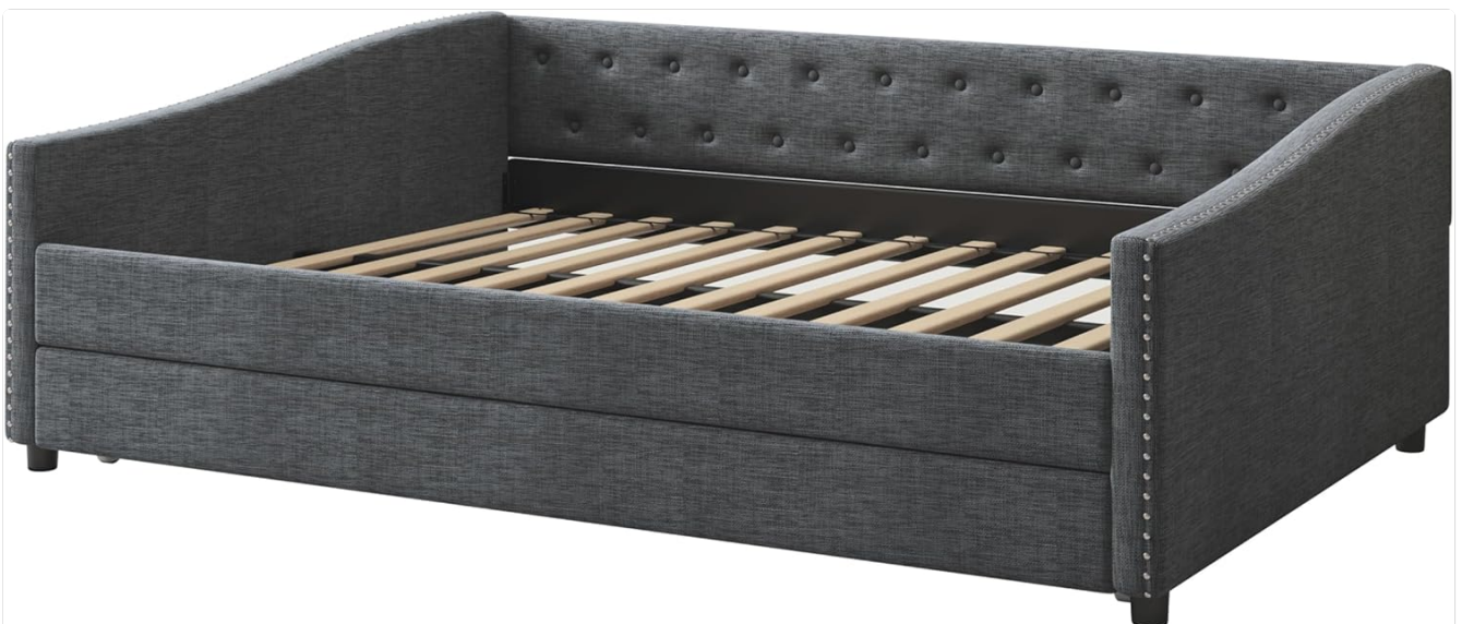
Image: The daybed with the trundle partially extended, demonstrating its pull-out mechanism.