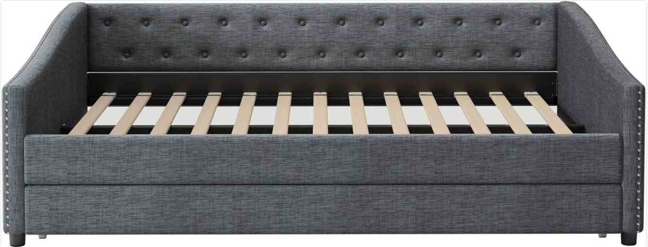
Image: An exploded view of the daybed components, showing the frame, slats, and trundle unit.