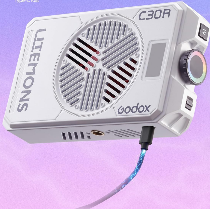
Image: The GODOX Litemons C30R's display screen, showing options for adjusting hue, saturation, and intensity (HSI mode).