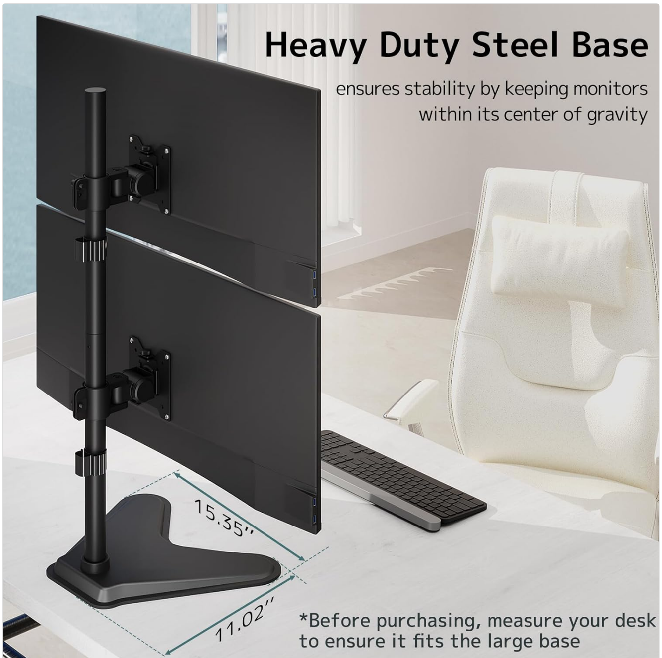
Figure 1: Heavy-duty steel base for stable monitor support. Dimensions: 39 x 28 cm (15.35" x 11.02").