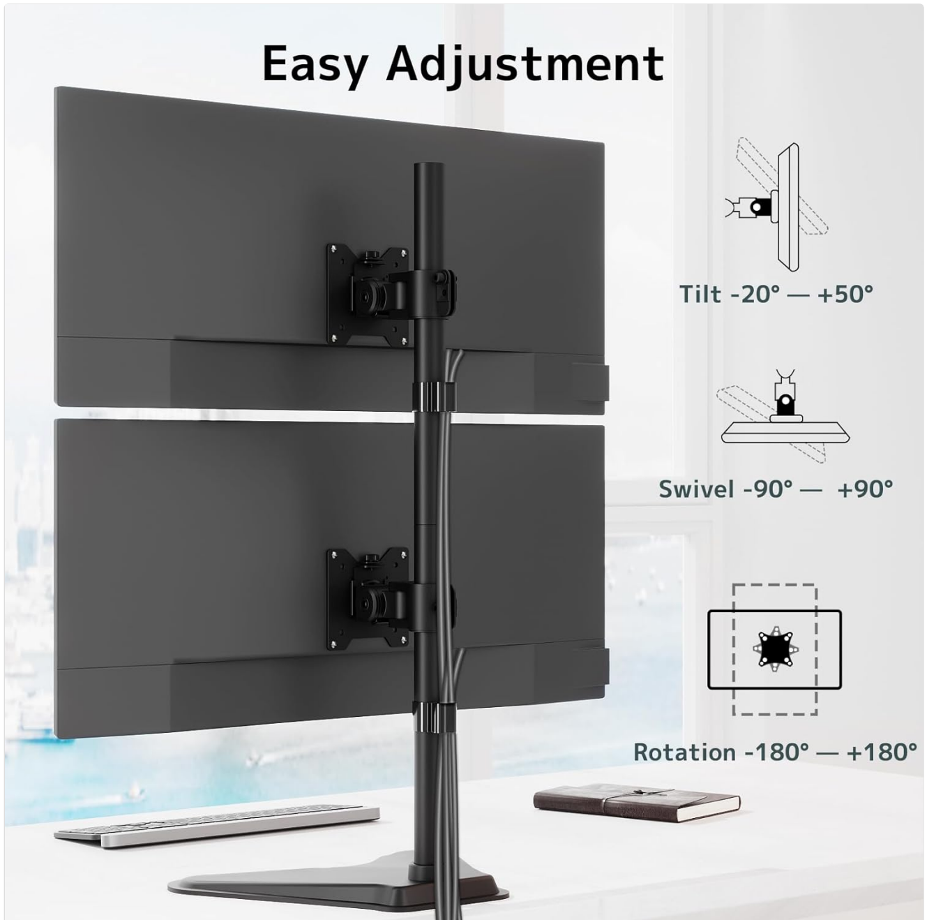
Figure 3: Easy adjustment features for optimal viewing comfort.