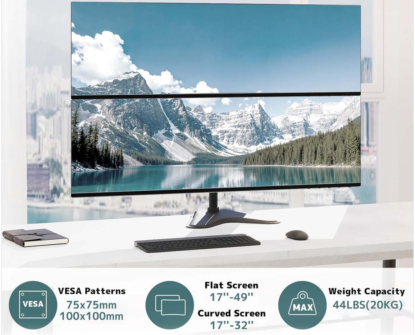
Figure 5: Key specifications and compatibility details.