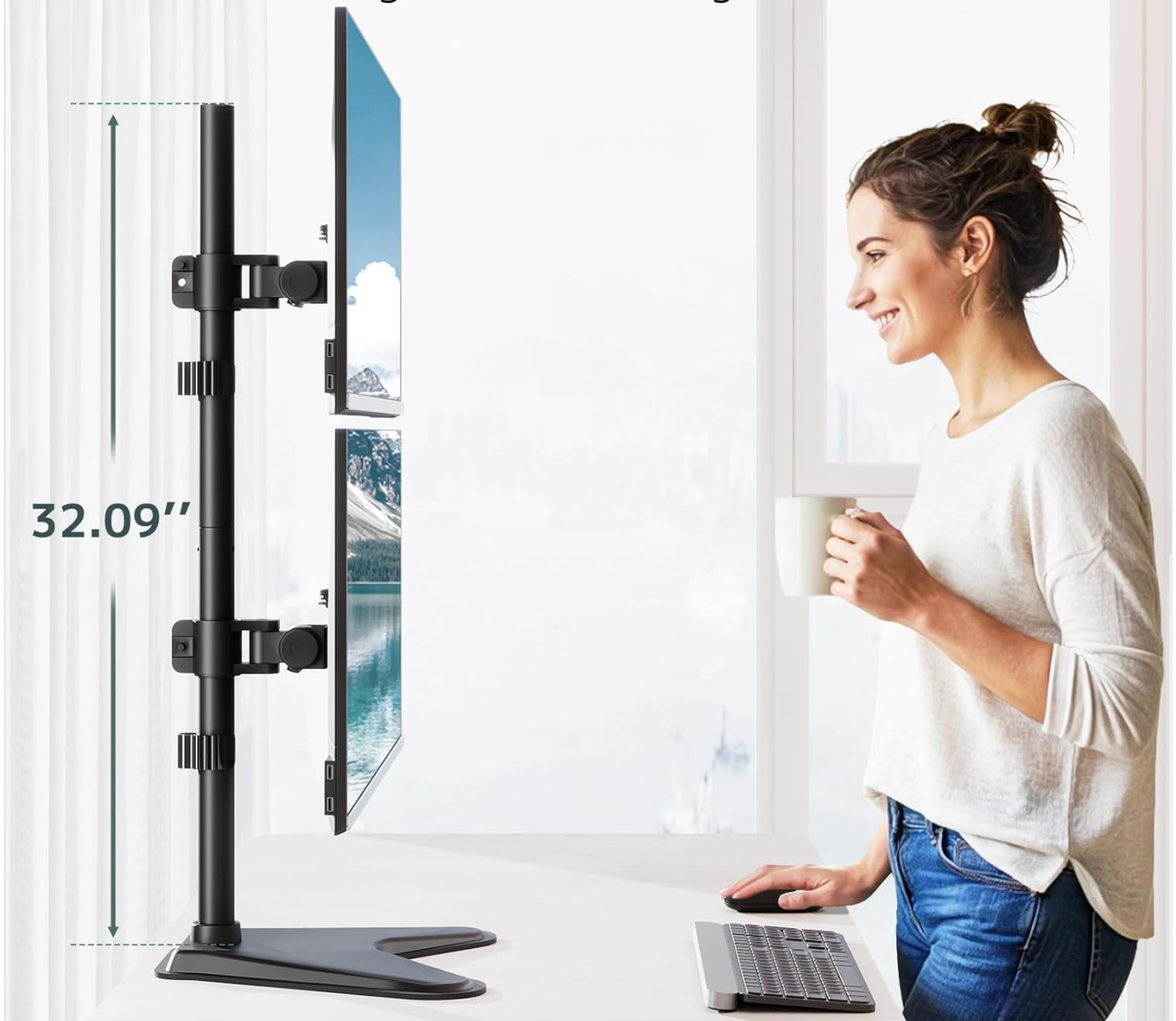
Figure 2: Height adjustable monitor stand for ergonomic viewing comfort. Total height shown is 32.09 inches.