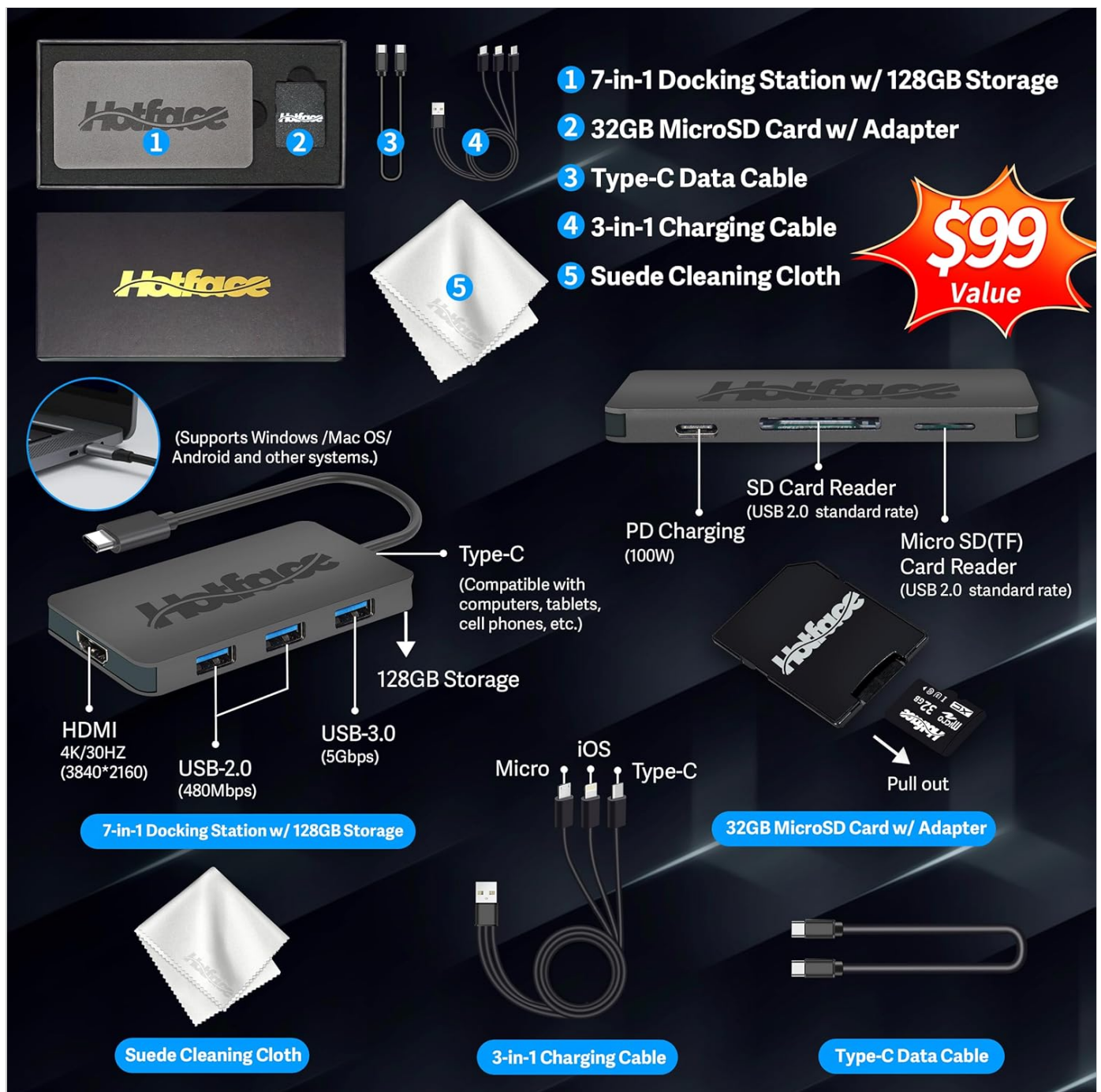
Image: Components of the included docking station set, featuring the 7-in-1 docking station, 32GB MicroSD card with adapter, Type-C data cable, 3-in-1 charging cable, and a suede cleaning cloth.