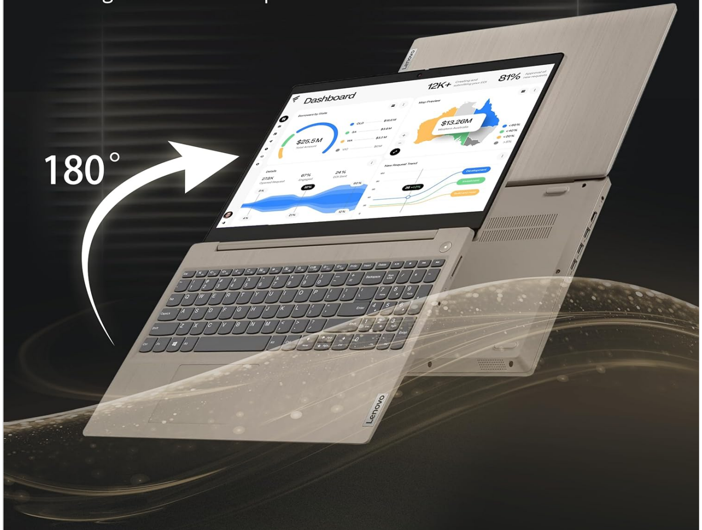
Image: The laptop's screen rotated 180 degrees, illustrating the flexible hinge design for versatile viewing and presentation modes.

Rotate the screen around a 180° hinge for comfortable viewing and effortless presentation.