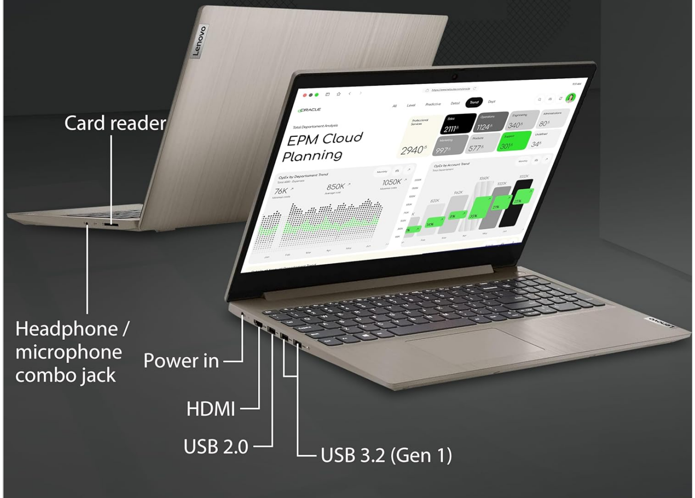
Image: Detailed view of the laptop's side ports, including the headphone/microphone combo jack, power input, HDMI, USB 2.0, and USB 3.2 (Gen 1) ports.

Multifunctional interface enables flexible sharing.