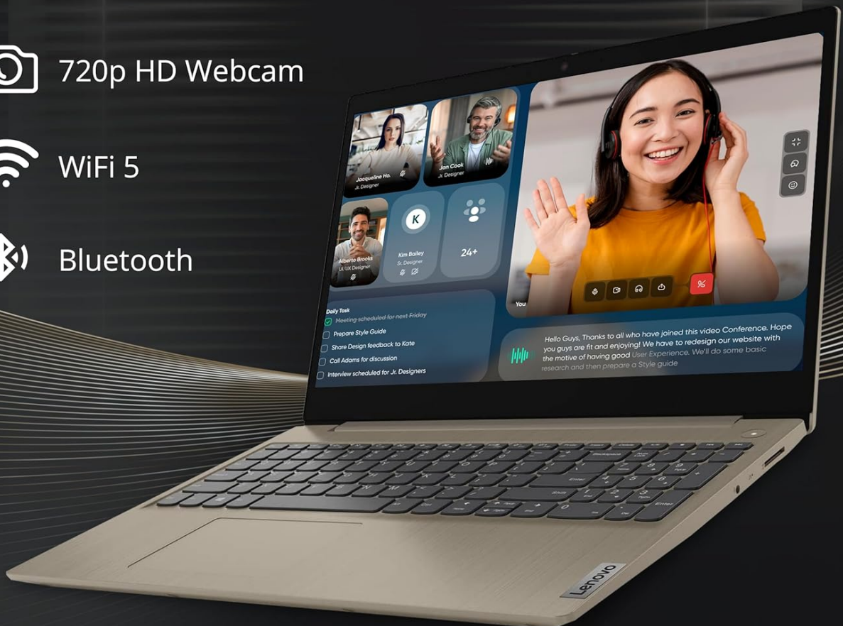
Image: The laptop's communication features, including a 720p HD webcam for video calls, Wi-Fi 5 for internet access, and Bluetooth for peripheral connections.