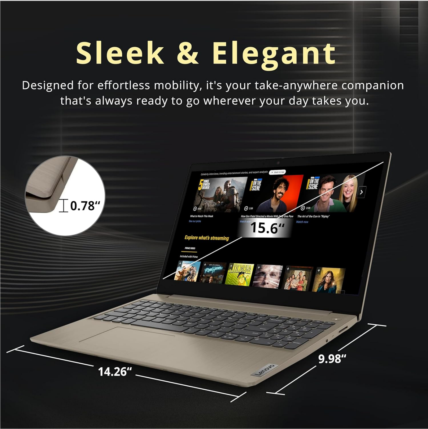
Image: Physical dimensions of the laptop, showing its sleek profile and measurements for thickness, width, and depth.