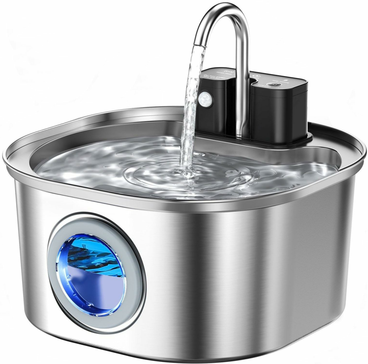
Image: The Voluas Stainless Steel Cat Water Fountain, showcasing its sleek design and water flow.