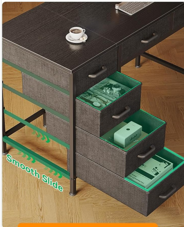
4-Tier Fabric Drawers