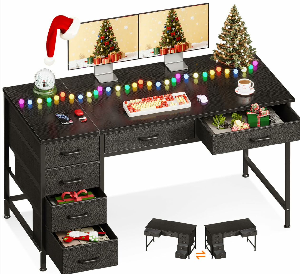
Image Description: An overall view of the ODK Computer Desk, illustrating its design and construction within a typical home office environment. The image highlights the desk's black finish and the integration of its storage features.