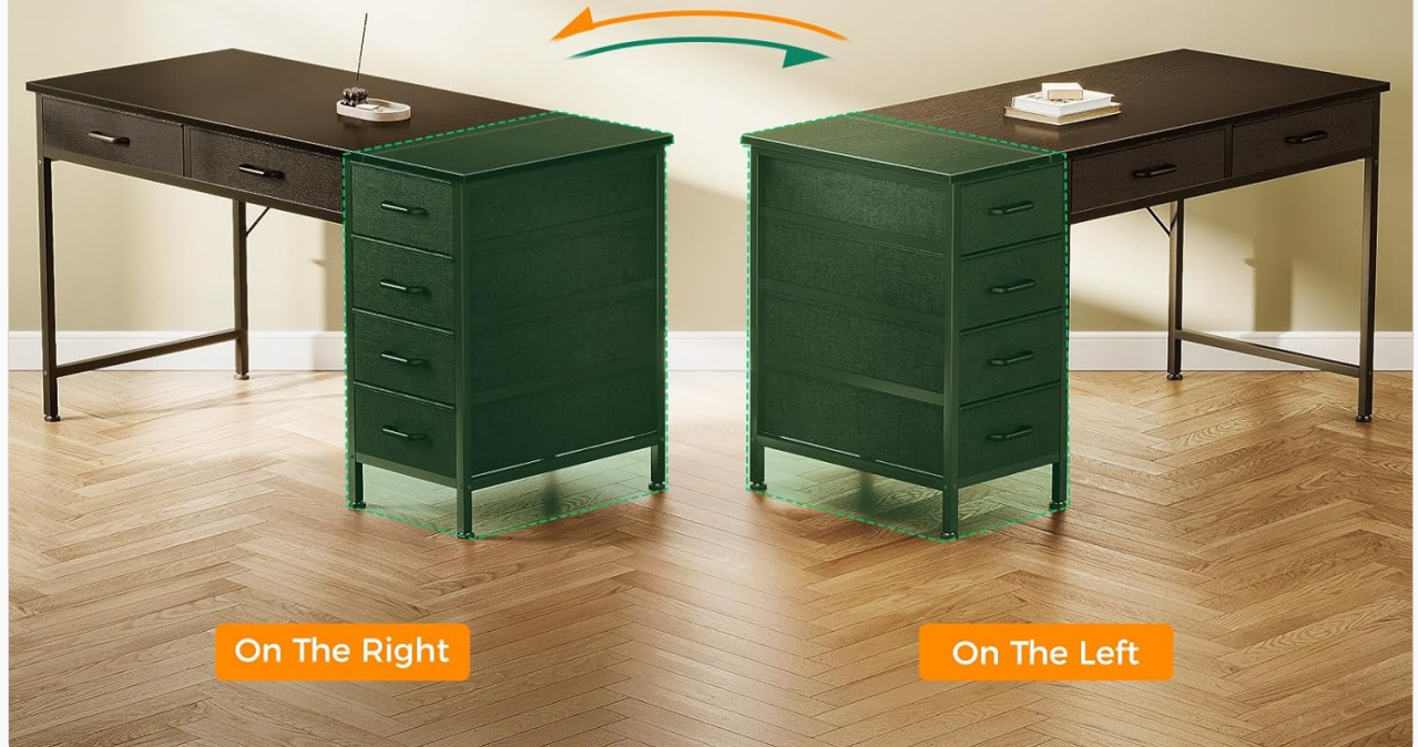
Image Description: A visual representation demonstrating the reversible nature of the desk's drawer unit, allowing users to customize its placement on either side of the main tabletop.

Install the 4-tier drawers on the left or right side according to your preference.