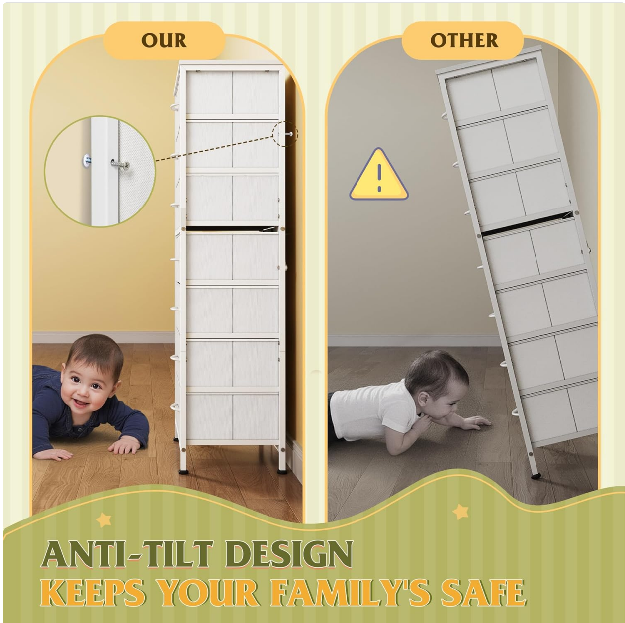
Image: Anti-tilt device installation for enhanced safety.