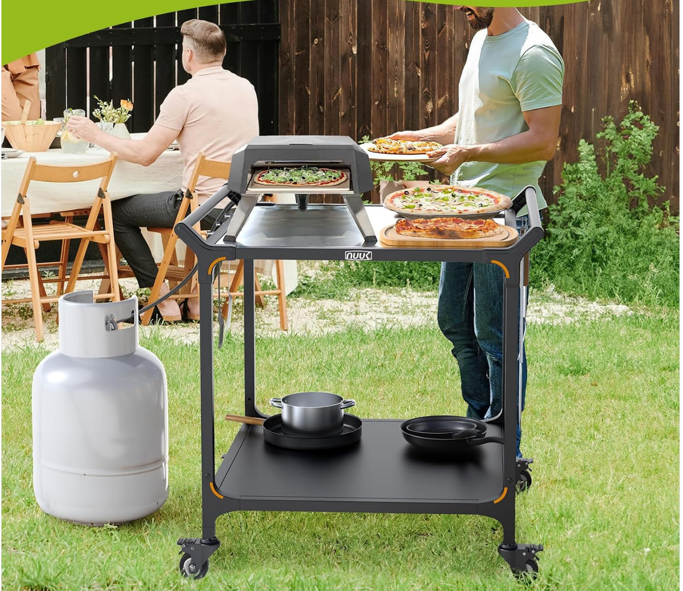
Figure 5.2: The grill cart configured as an outdoor pizza oven table.