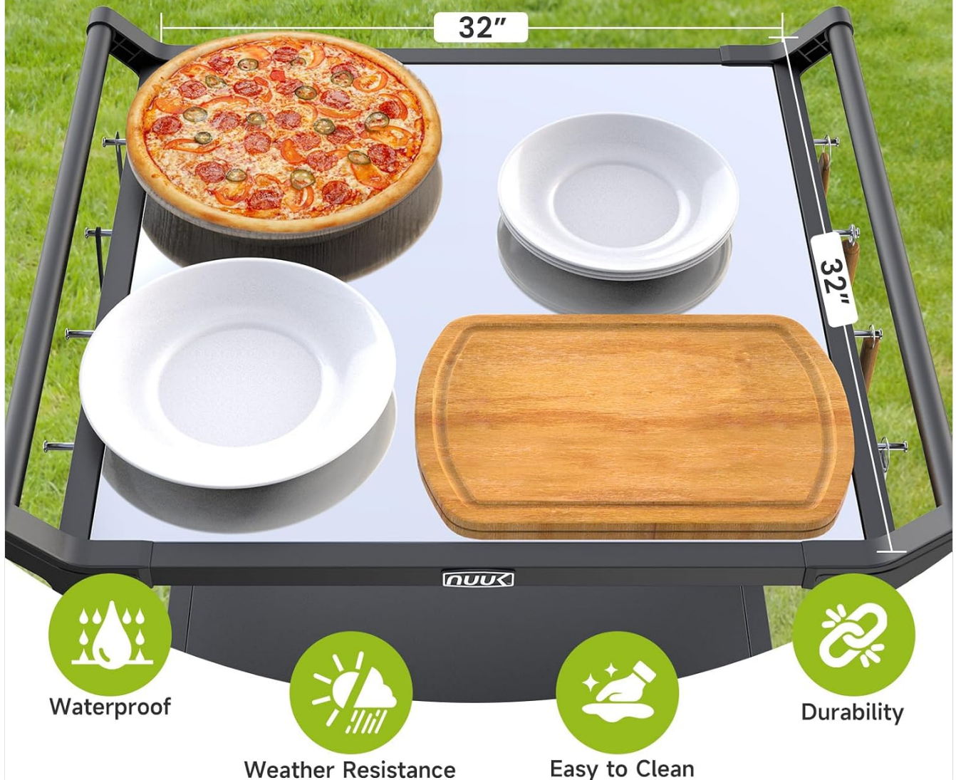
Figure 3.2: High-quality stainless steel tabletop features.

Large Stainless Steel Material Table Top Surface