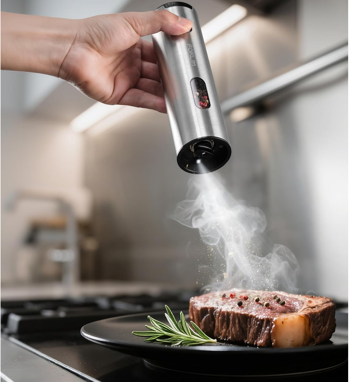
Image: The integrated LED light provides clear visibility of the seasoning process.