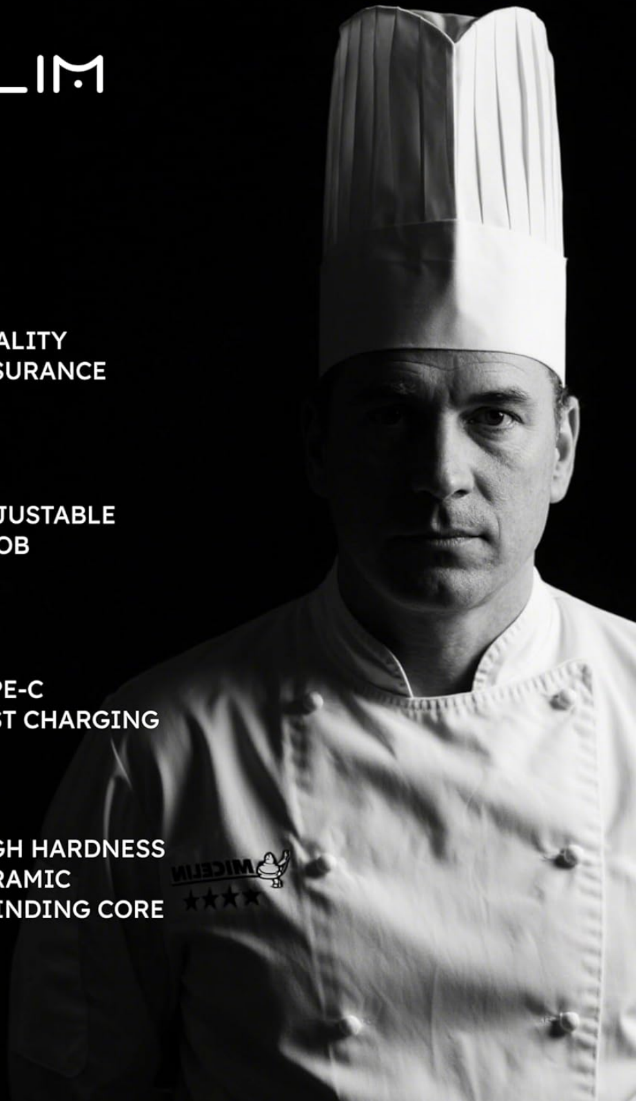
Image: Key features and support information for the FORLIM grinder set.