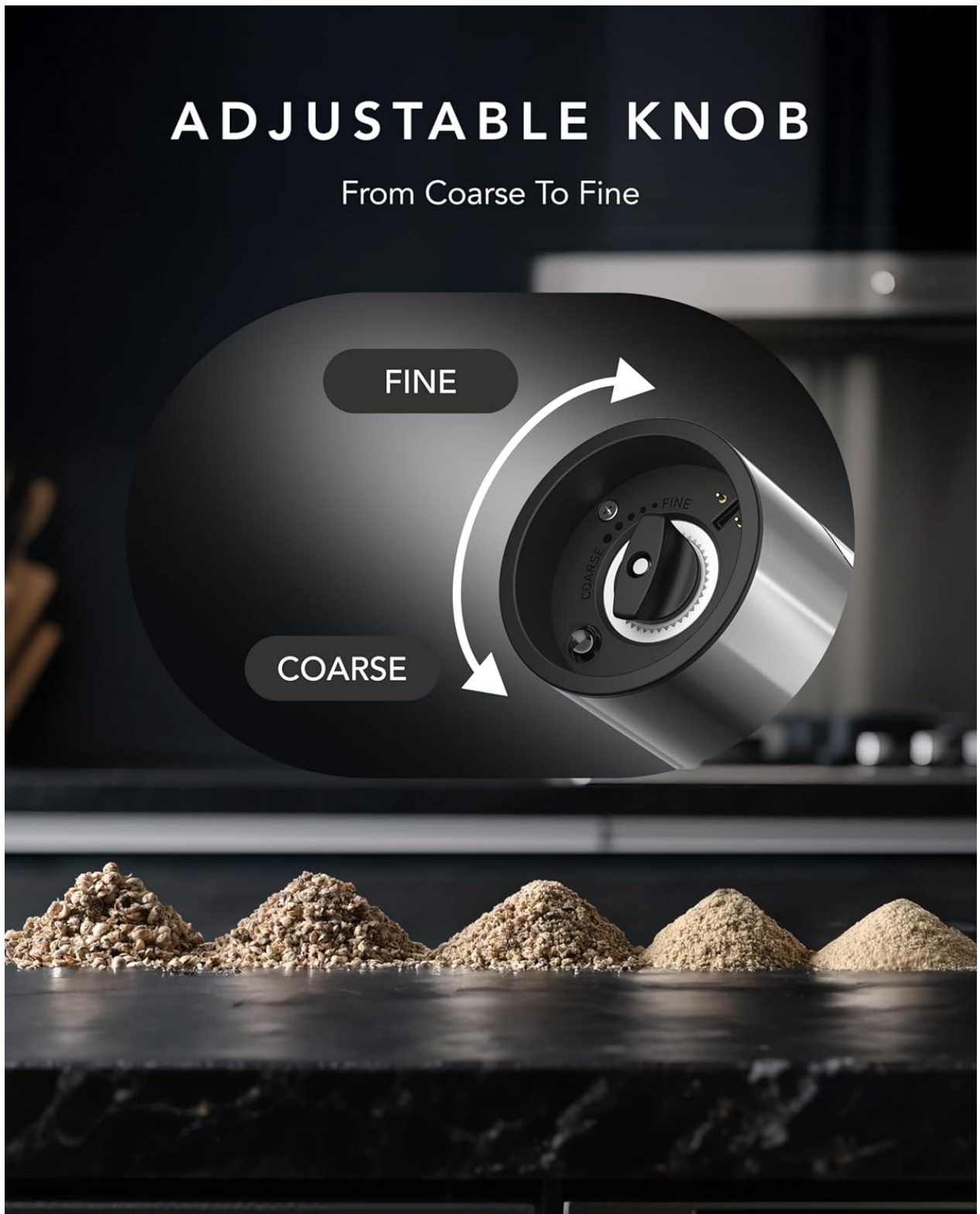
Image: The adjustable knob at the base of the grinder allows users to select their desired grind size.