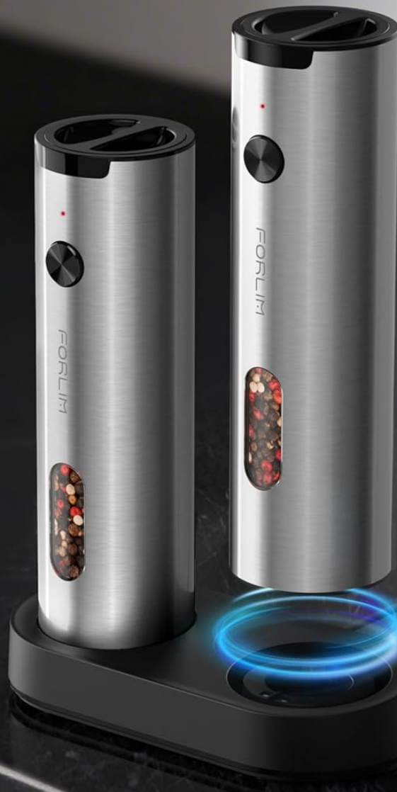
Image: The grinders charging on their base, with an indicator light showing charging status.