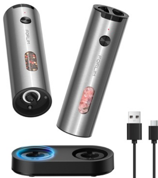
Image: All components of the FORLIM Electric Salt and Pepper Grinder Set, including the two grinders, the charging base, and the USB cable.