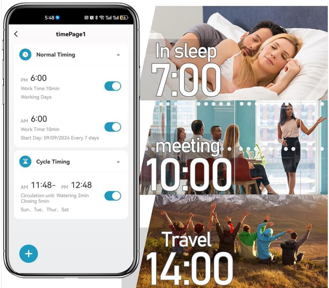
Image 4.1: A smartphone screen showing the interface for setting up to 8 different timer groups, illustrating flexible scheduling options.