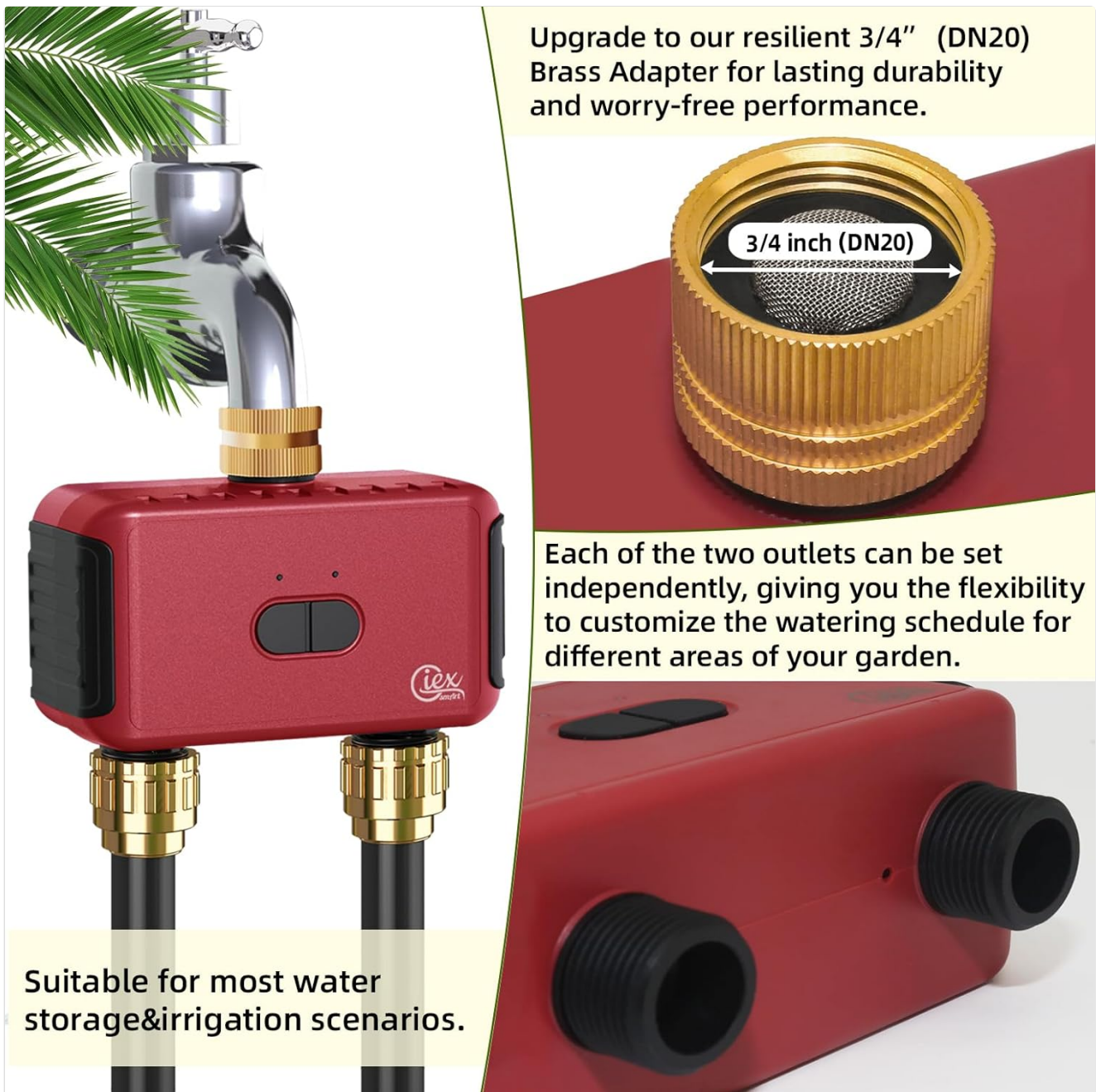
Image 2.2: Close-up view of the GIEX GX-03 Sprinkler Timer connected to a faucet, emphasizing the durable brass inlet and the two independent hose outlets.