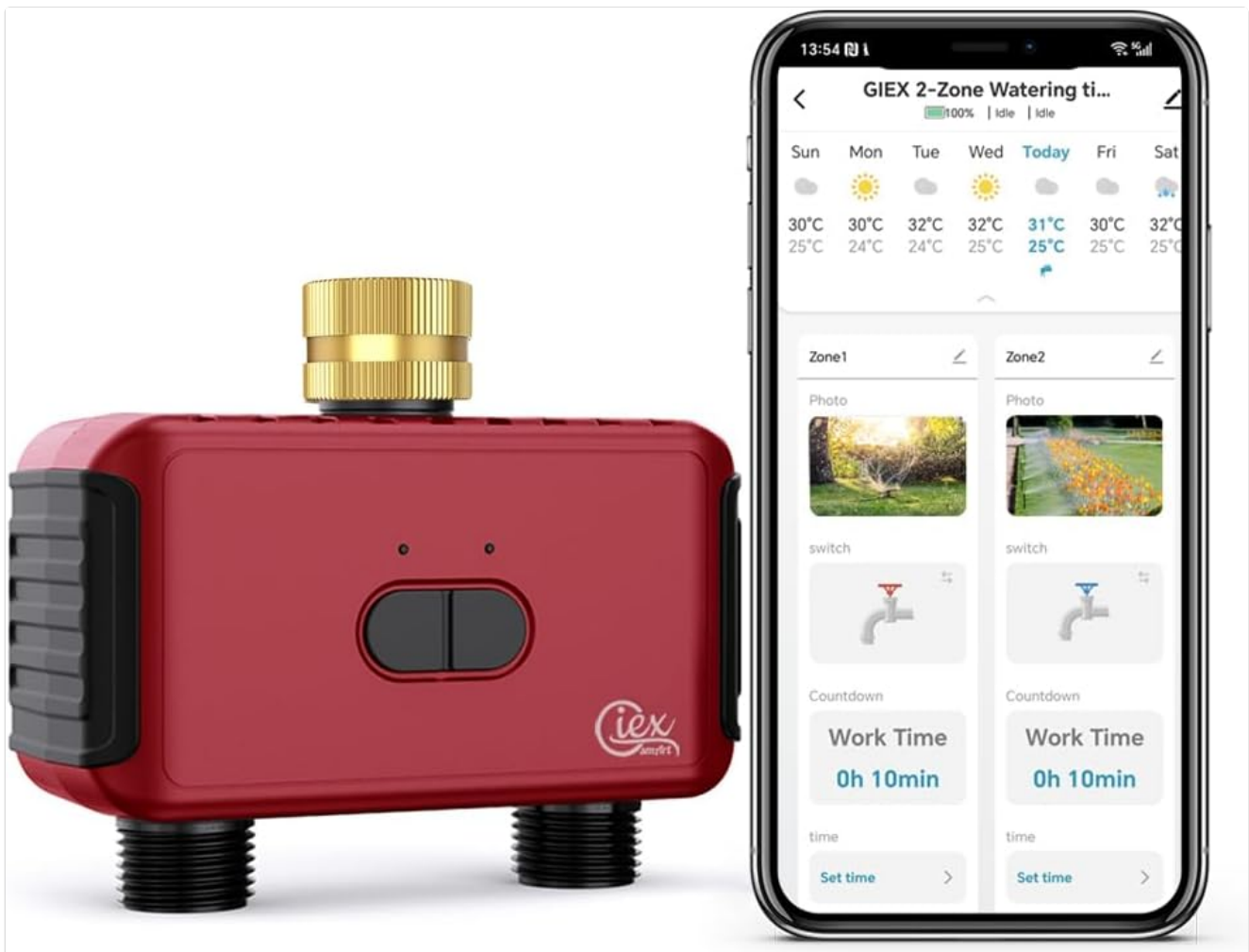
Image 2.1: The GIEX GX-03 Smart Sprinkler Timer shown alongside its smartphone application interface.