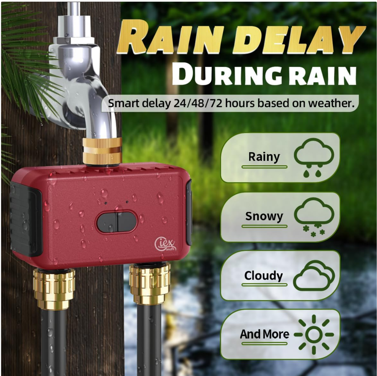
Image 4.2: The GIEX GX-03 Sprinkler Timer demonstrating its rain delay capability, with visual cues for various weather conditions.