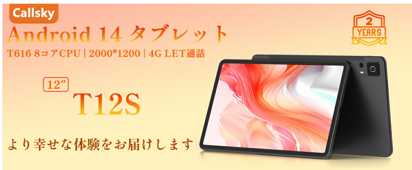
Image: Callsky T12S Tablet with its included accessories.