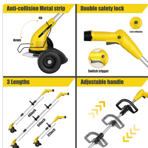
Image: Detailed view of the anti-collision metal strip, double safety lock, 3 adjustable lengths, and adjustable handle features.

Image: Step-by-step guide on how to install the lawn trimmer components. This image illustrates the sequence of attaching various parts.