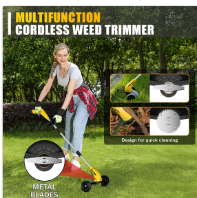
Image: Multifunction cordless weed trimmer shown with metal blades for quick cleaning and efficient cutting.