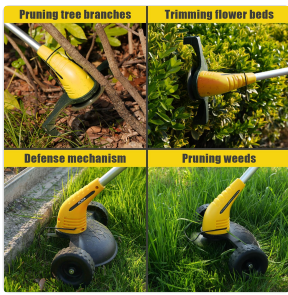
Image: Various applications of the weed wacker including pruning tree branches, trimming flower beds, using the defense mechanism, and pruning weeds.