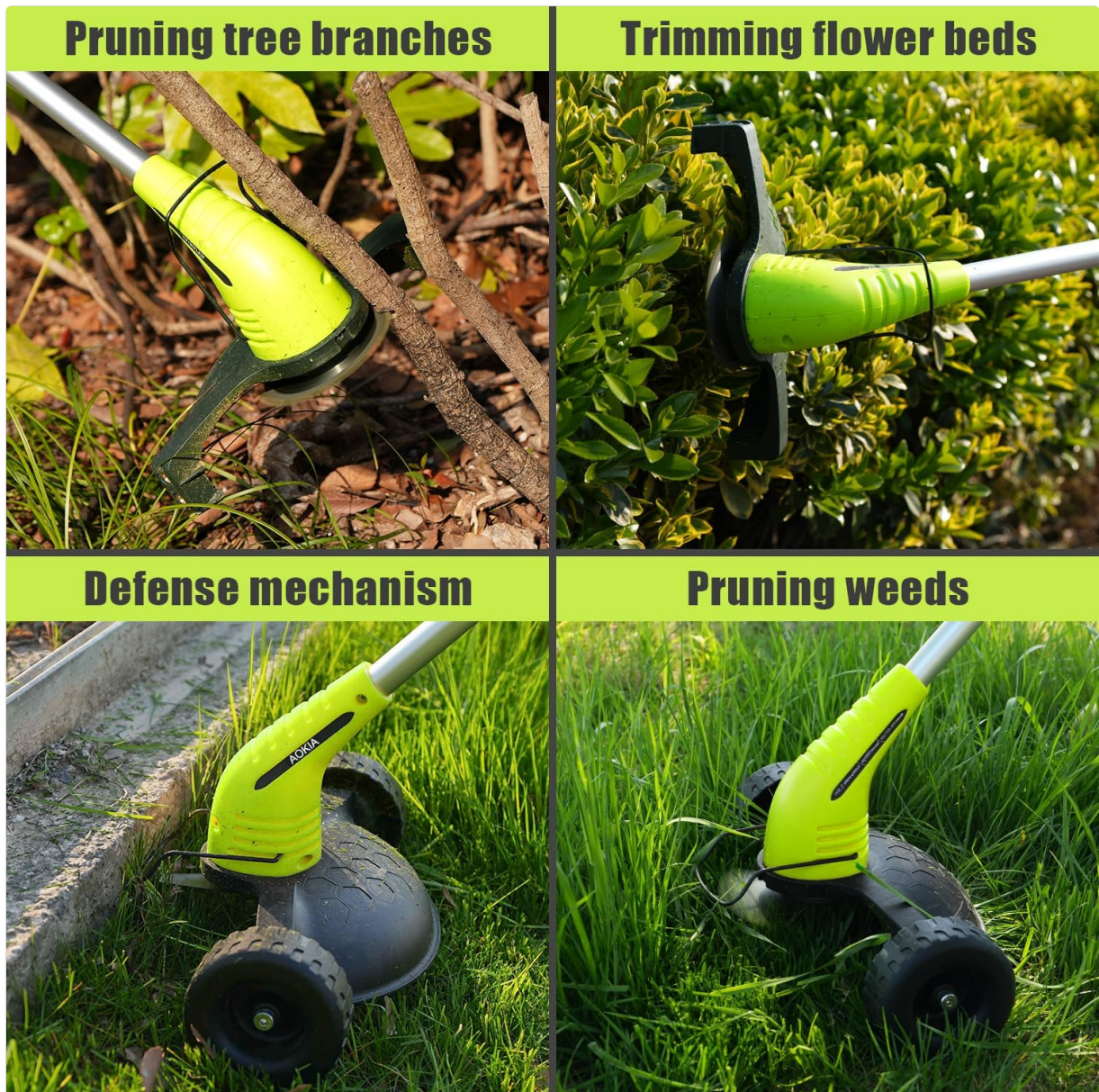
Figure 5.5: Versatile applications of the Aokia trimmer.