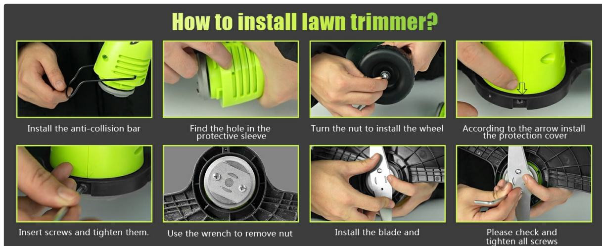
Figure 4.1: Visual assembly guide for the Aokia String Trimmer.

Follow these steps to assemble your Aokia String Trimmer: