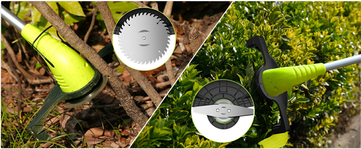
Figure 5.4: Different blade applications.