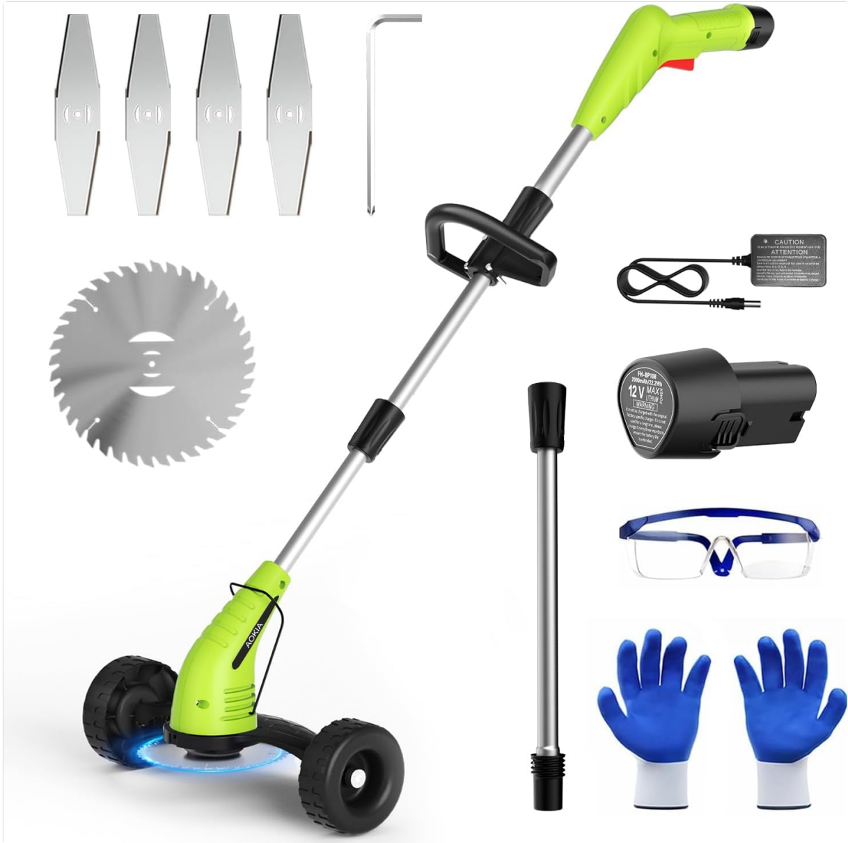
Figure 3.1: Complete package contents of the Aokia String Trimmer.

Your Aokia 12V Cordless Electric String Trimmer package includes the following components: