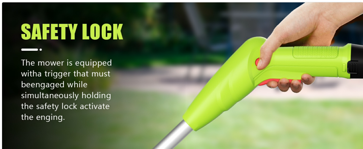
Figure 5.2: Safety lock and trigger mechanism.

The trimmer features a double safety lock mechanism to prevent accidental starts.