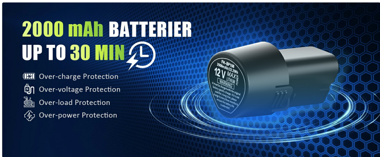
Figure 5.1: The 2000 mAh Li-Ion battery with built-in protections.