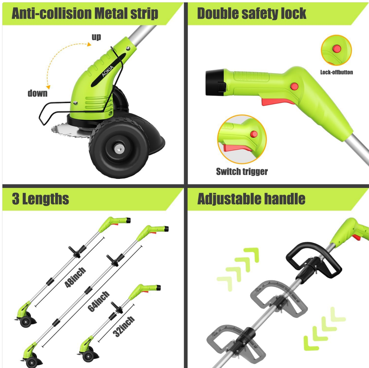
Figure 5.3: Trimmer features including adjustable length and handle.