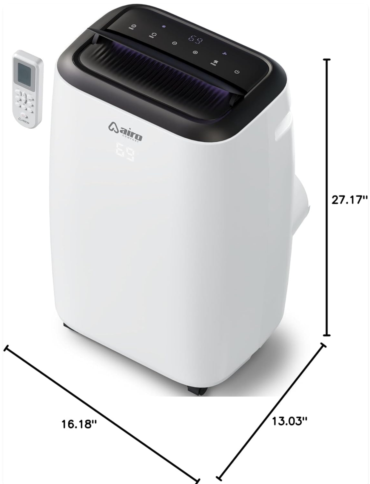
Figure 2.2: Dimensions of the AIRO COMFORT Portable Air Conditioner, illustrating its compact size for easy placement.