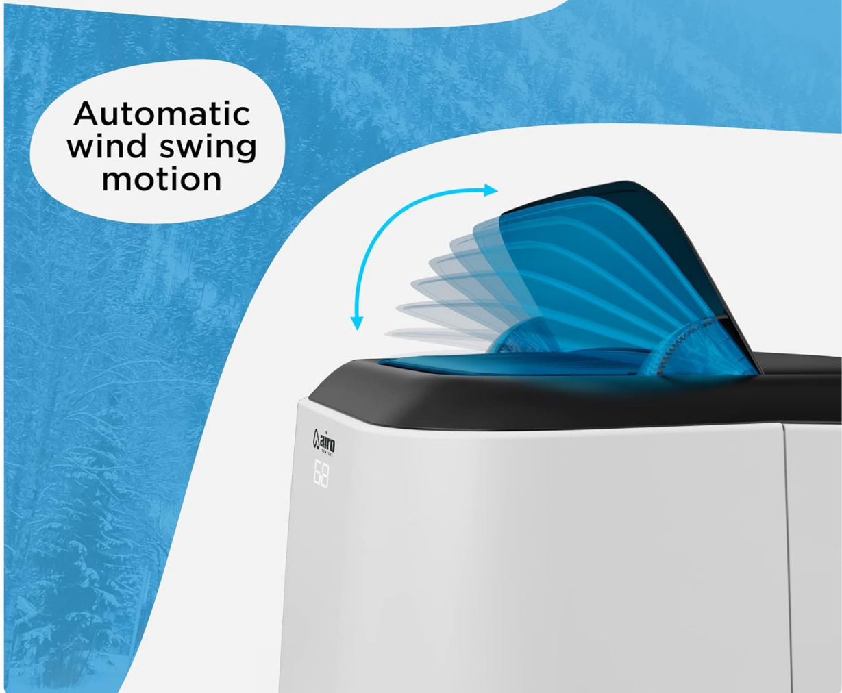
Figure 4.3: Depiction of the automatic wind swing motion for efficient air distribution.