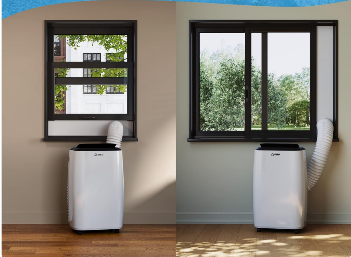
Figure 3.2: Examples of window kit installation for different window types.