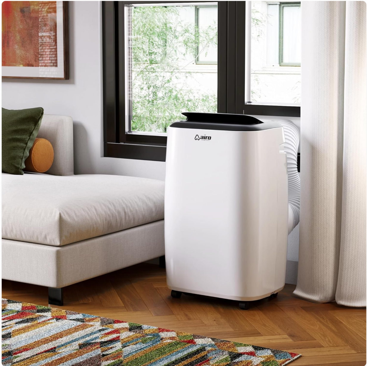
Figure 3.1: The portable AC unit positioned in a room, demonstrating its compact footprint.