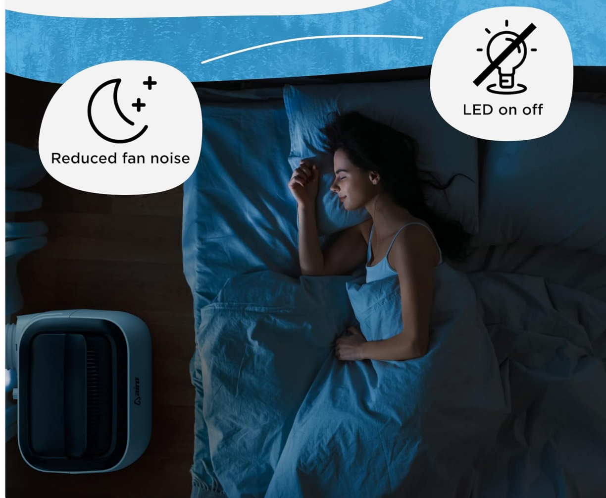
Figure 4.2: Illustration of sleep mode benefits, including reduced fan noise and the option to turn off the LED display.