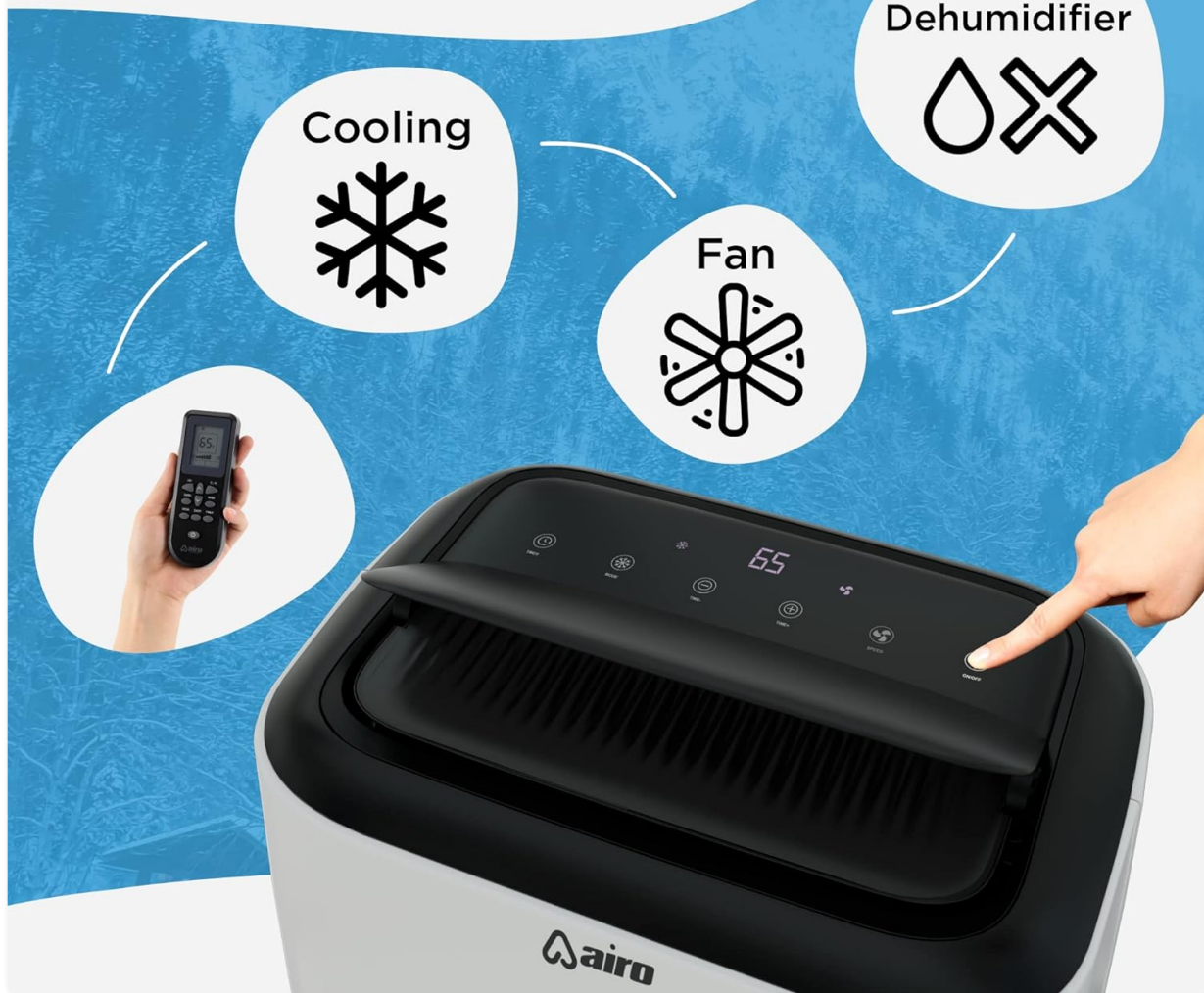
Figure 4.1: Close-up of the unit's control panel, showing buttons for timer, mode, temperature adjustment, fan speed, and power.