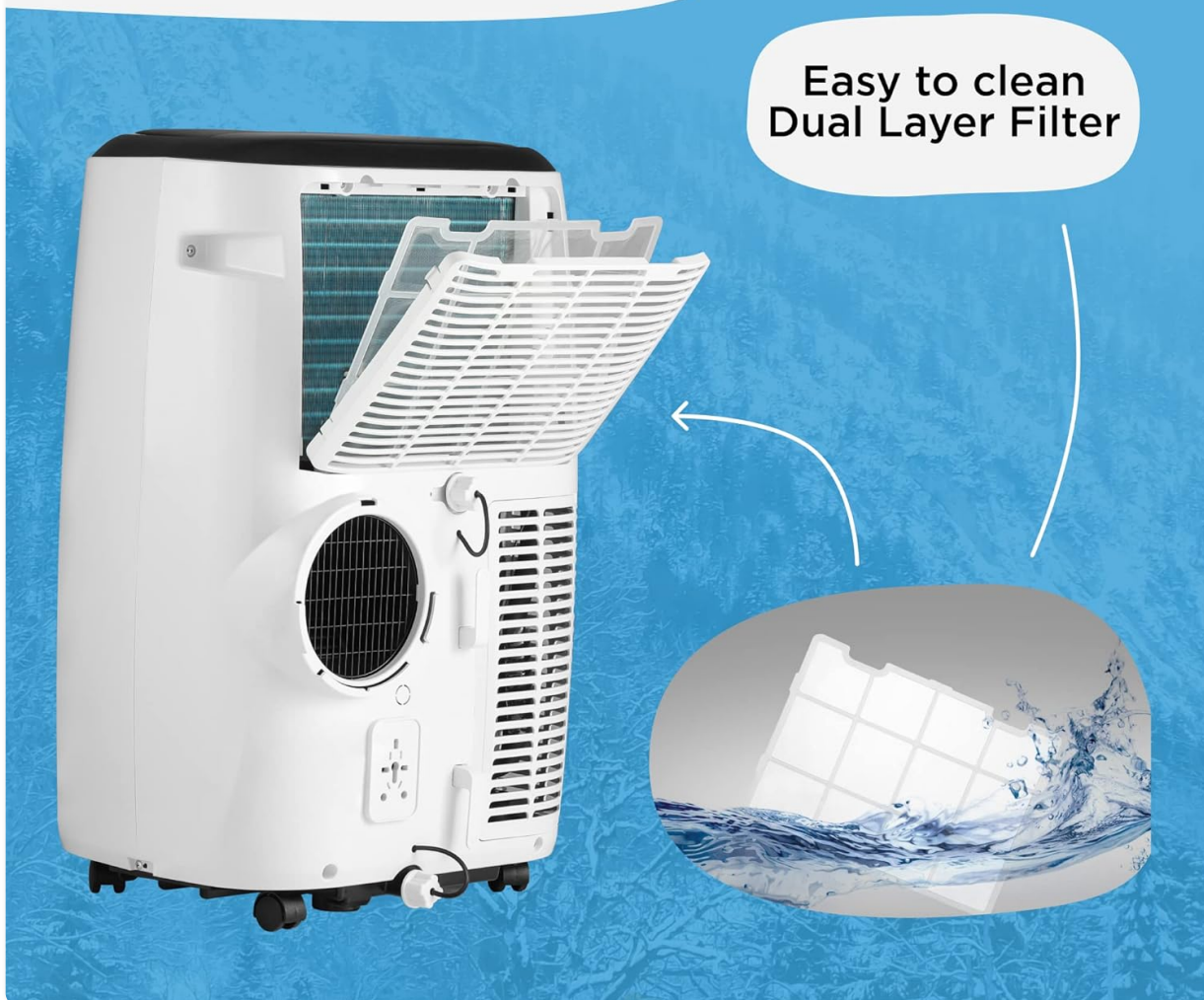
Figure 5.1: Steps for removing and cleaning the dual-layer air filter.