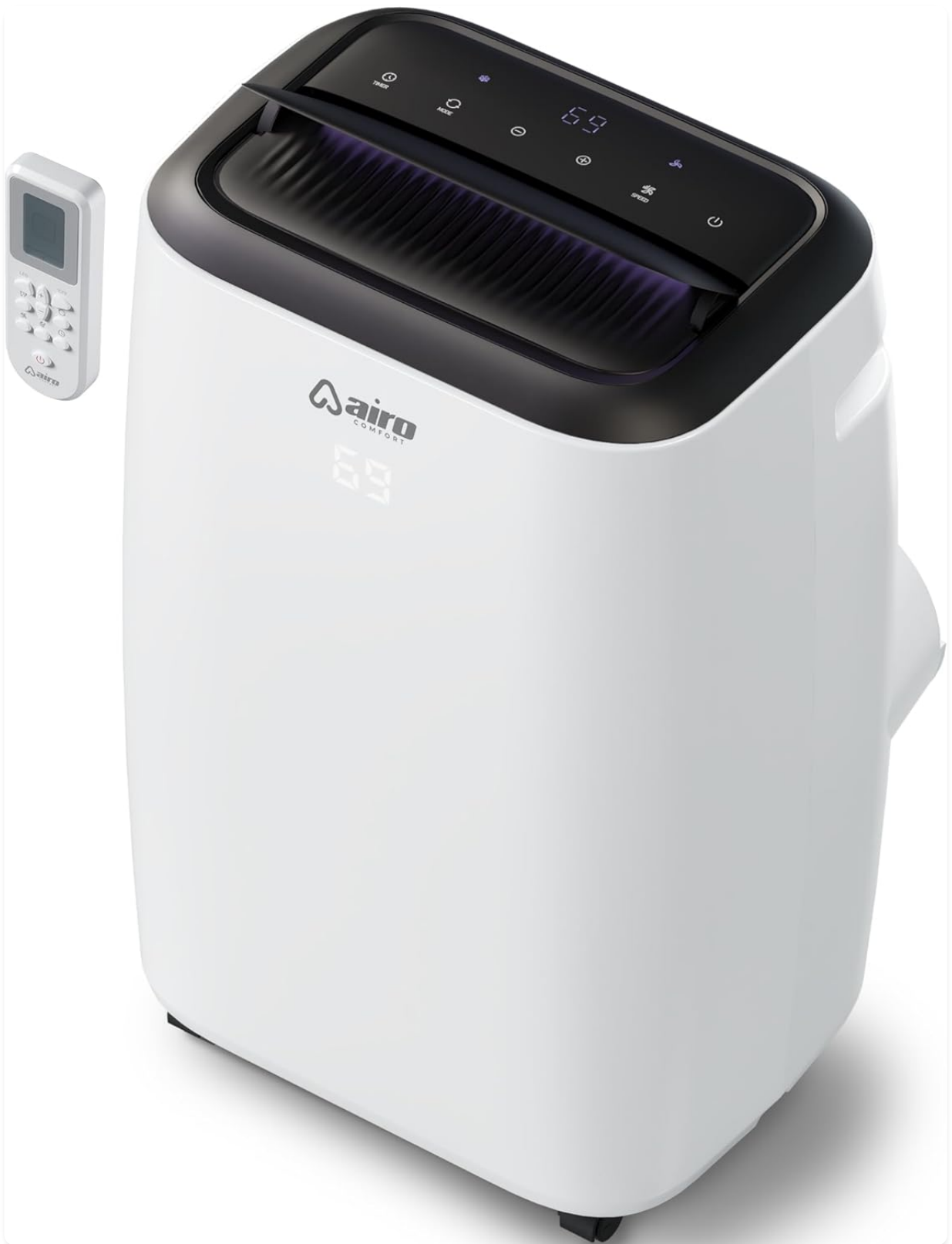
Figure 2.1: Front view of the AIRO COMFORT Portable Air Conditioner, showcasing its sleek design and digital display.