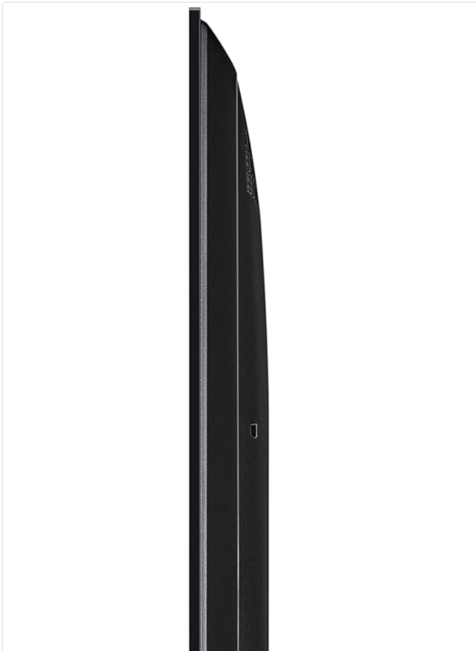
Figure 2.2: HDMI and USB Ports. The TV features four HDMI ports and two USB ports for versatile connectivity.

Details shown on product images may vary by region, country, or model.