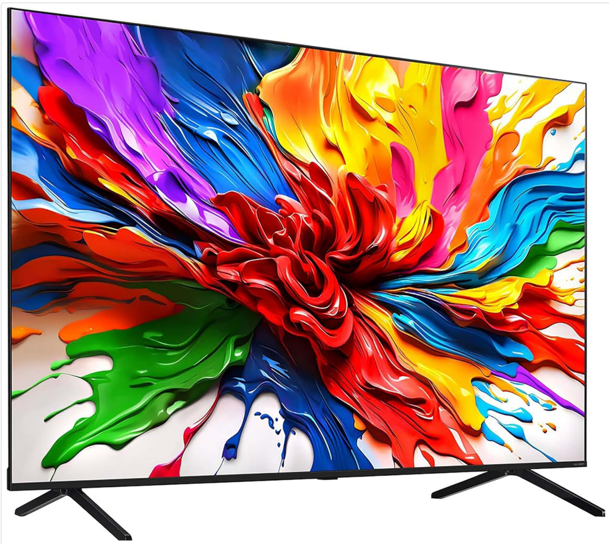
Figure 3.2: webOS Smart TV Platform. The heart of home entertainment, offering over 300 free channels and thousands of titles.