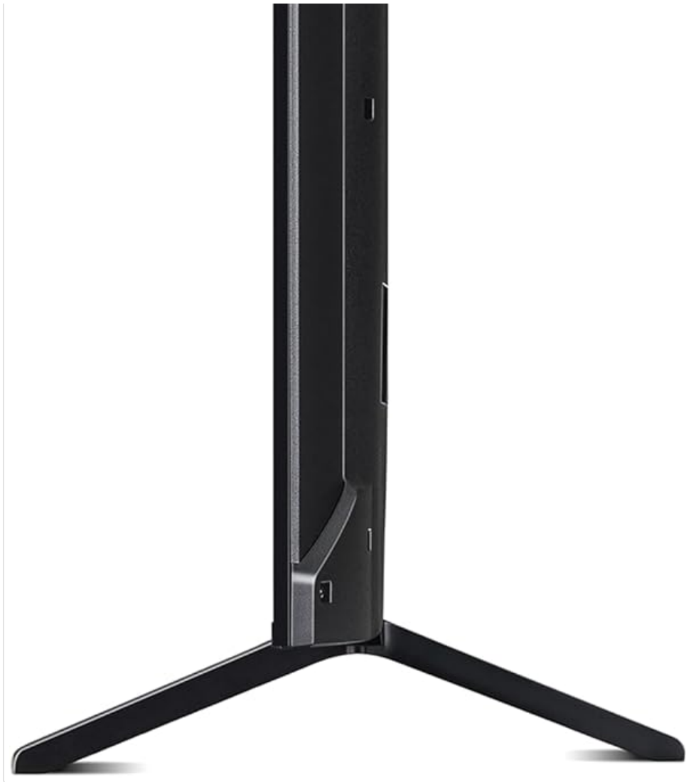
Figure 2.3: LAN, Antenna, and USB Ports. Additional connectivity options are located on the back panel.