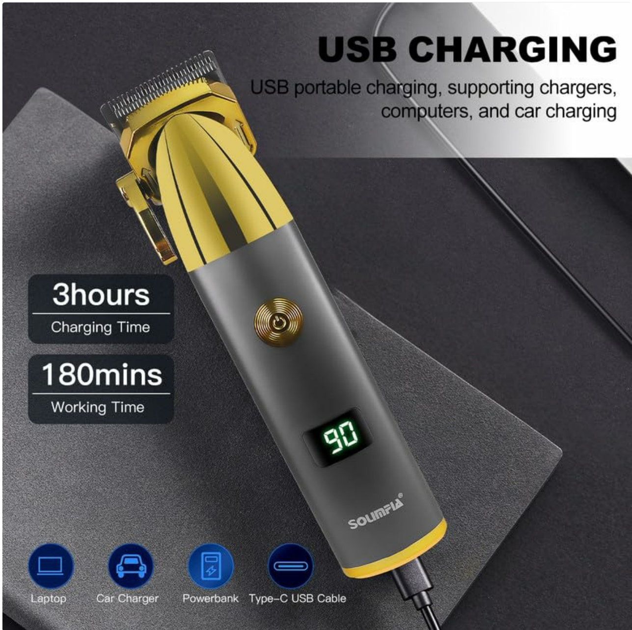
Figure 2: USB charging process for the hair clipper.