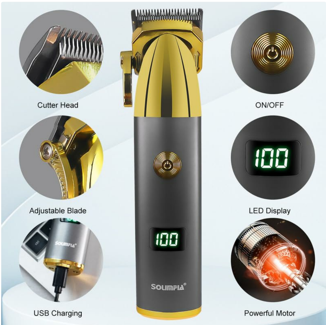
Figure 1: Overview of the SOLIMPIA HT-629 Hair Clipper and its key components.