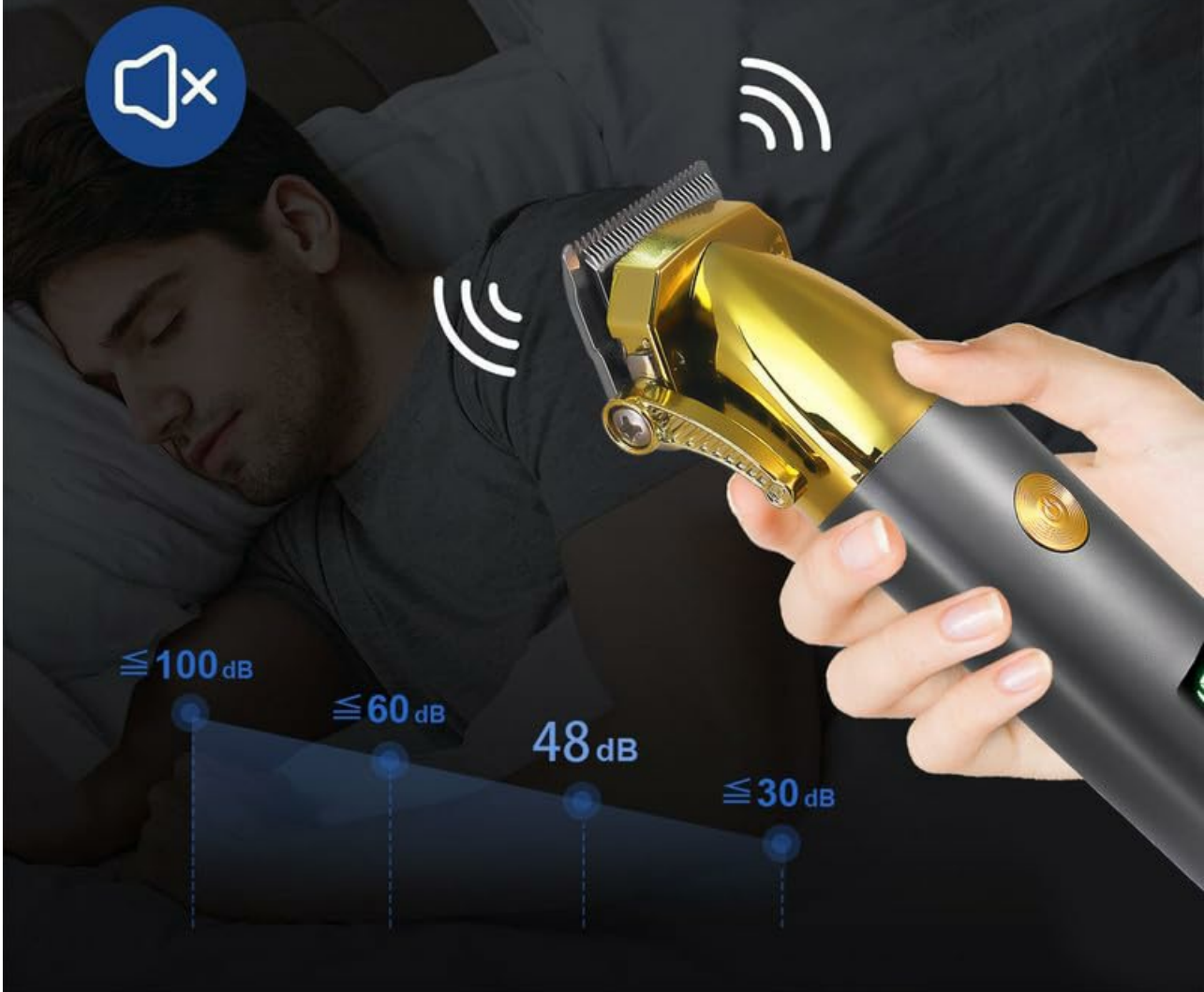
Figure 5: Illustration of the clipper's quiet operation.