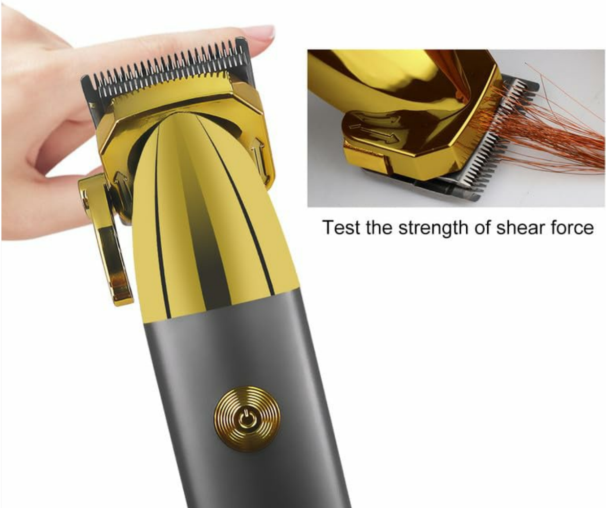
Figure 4: R-type round cutter head for skin protection.