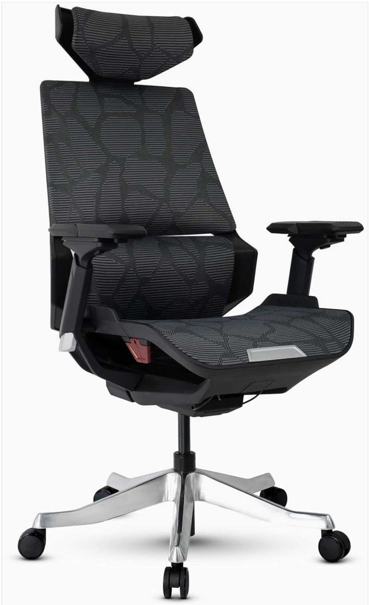
Figure 3: Front view of the chair, demonstrating the adjustable headrest for neck and head support.