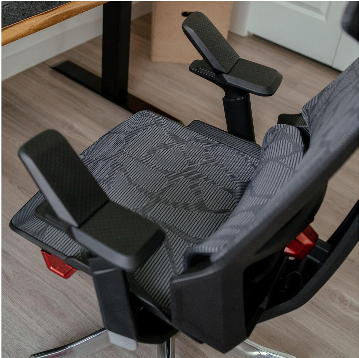
Figure 2: Side view illustrating the chair's recline capability and the location of adjustment levers.