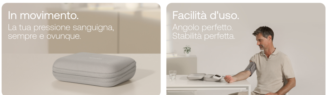
Image 5.2: User performing an ECG measurement with the Withings BPM Vision.

Custodia protettiva che funge anche da supporto .