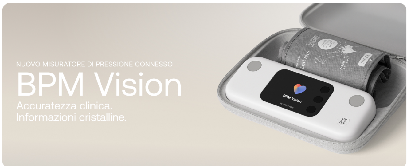
Image 1.1: The Withings BPM Vision device, showcasing its integrated design with the cuff and a clear display of blood pressure readings.

The Withings BPM Vision is an advanced smart blood pressure monitor designed for accurate measurement of systolic and diastolic blood pressure, heart rate, and detection of atrial fibrillation (AFib) through an integrated ECG. This device provides medical-grade precision and seamless data synchronization with the Withings app via Wi-Fi or Bluetooth, compatible with both iOS and Android devices. It is intended for adult use to monitor cardiovascular health at home.