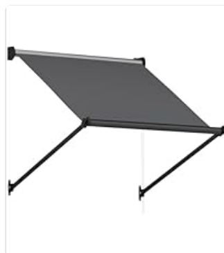
Image 5.1: Operating the manual crank handle to retract the awning.

To extend or retract the awning, insert the manual crank handle into the designated loop or hook on the awning mechanism. Rotate the handle clockwise to extend the awning and counter-clockwise to retract it. Operate smoothly and avoid excessive force.