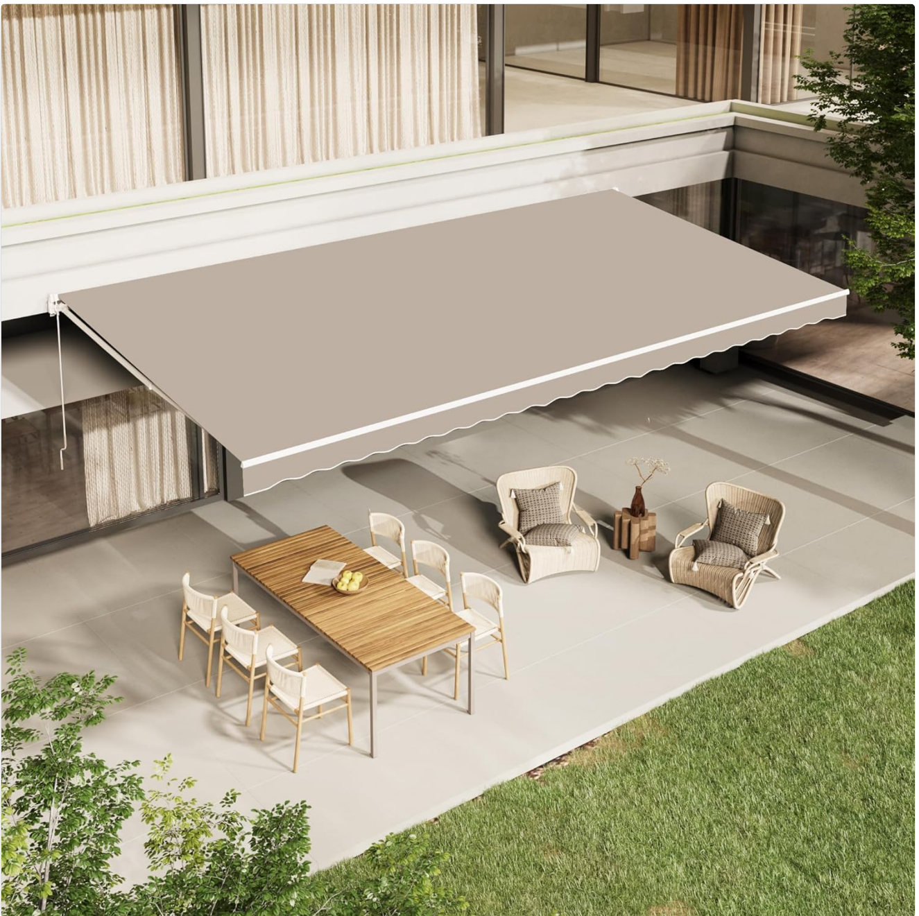
Image 1.1: The AECOJOY 14x10FT Manual Retractable Awning providing shade over a patio area.