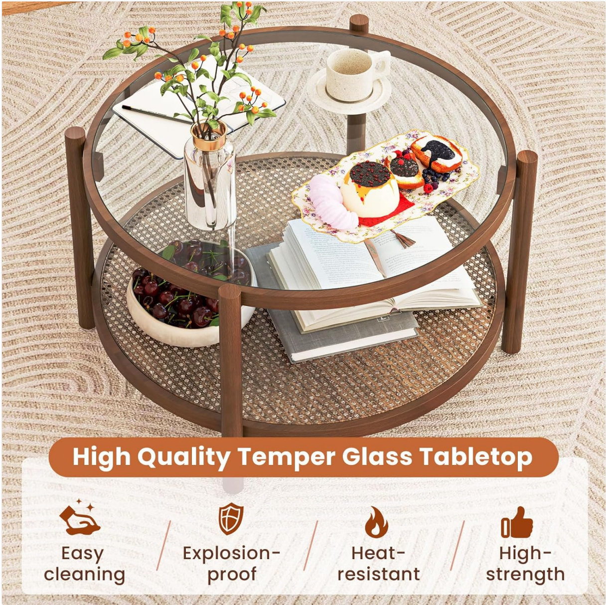
Image: A detailed view of the tempered glass tabletop, illustrating its key features including ease of cleaning, explosion-proof nature, heat resistance, and high strength.