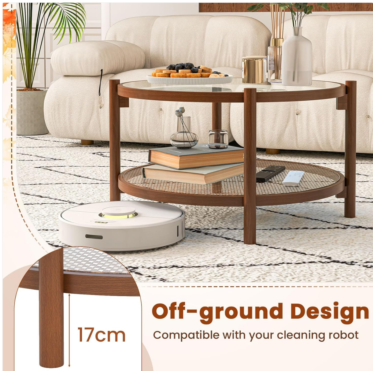
Image: The coffee table demonstrating its elevated design, allowing a robotic vacuum cleaner to pass underneath for convenient cleaning.