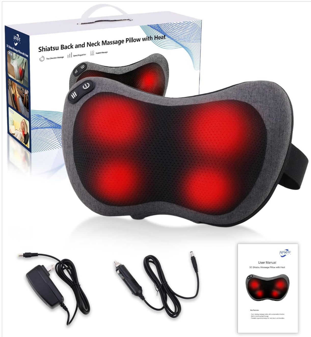
Image: The massager unit, along with its AC power adapter, car adapter, and user manual, as included in the package.