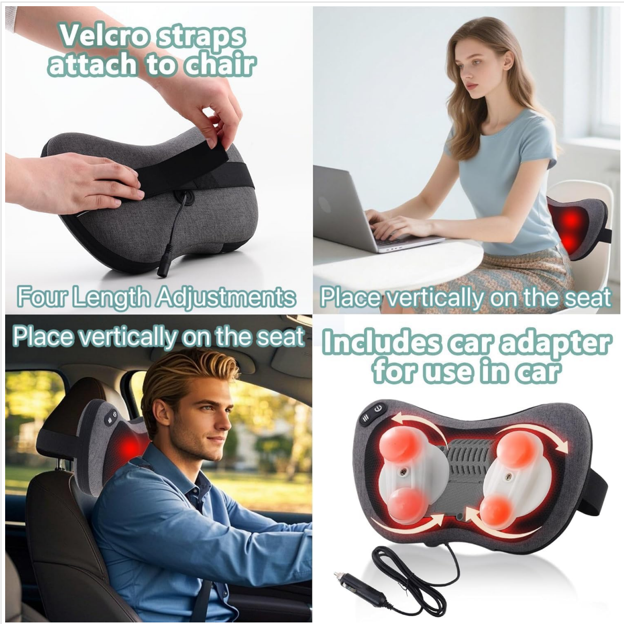
Image: The massager highlighting its adjustable Velcro straps for securing to a chair and the included car adapter for portable use.