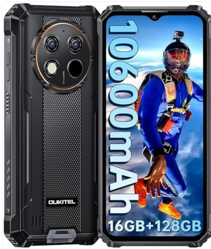
Image 3.1: Front and back view of the OUKITEL WP28S Rugged Smartphone. The front features the display and front camera, while the back shows the multi-camera module and ruggedized texture.