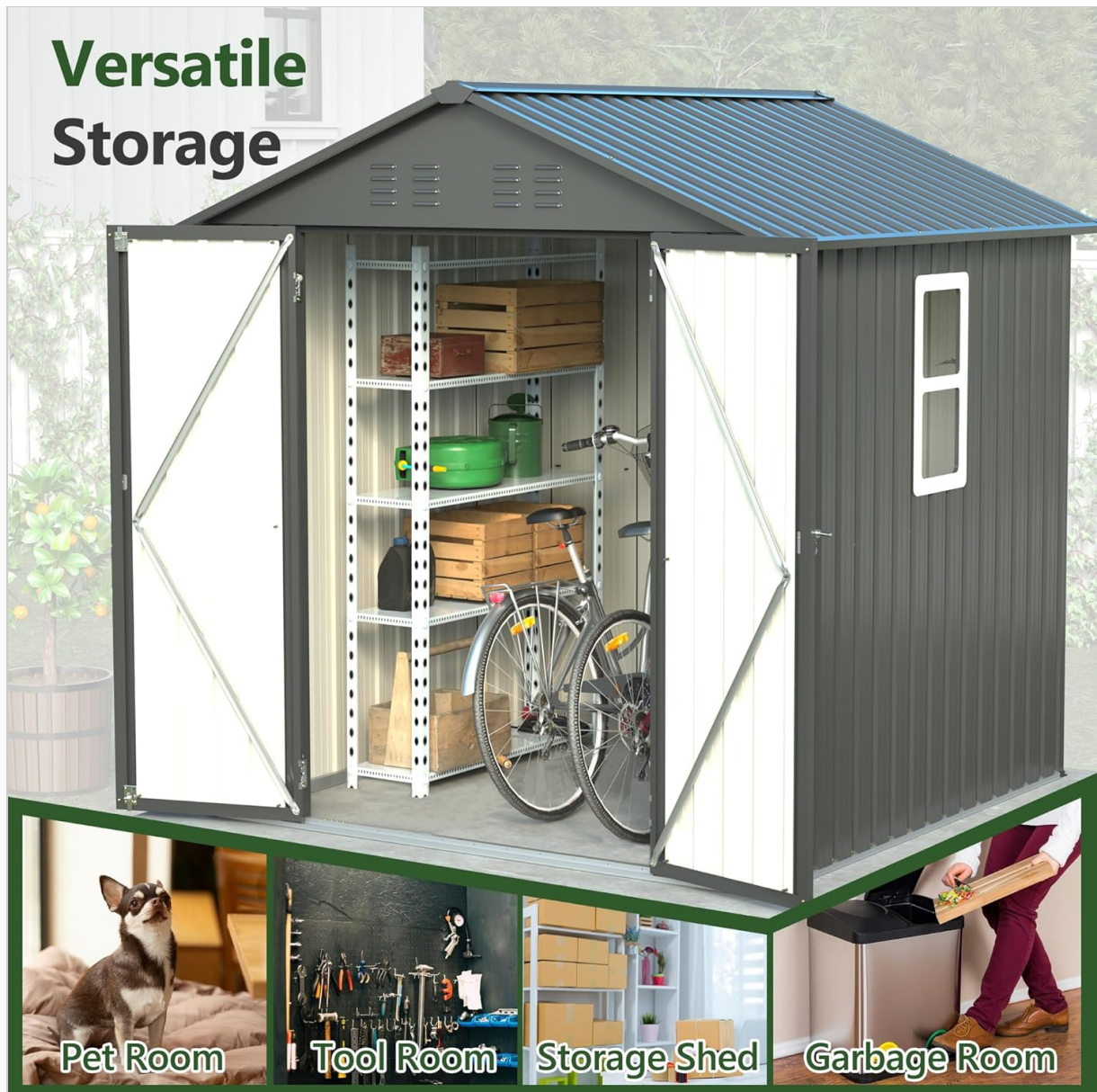
Image: The 6x6ft shed interior demonstrating its versatile storage capacity for various items.