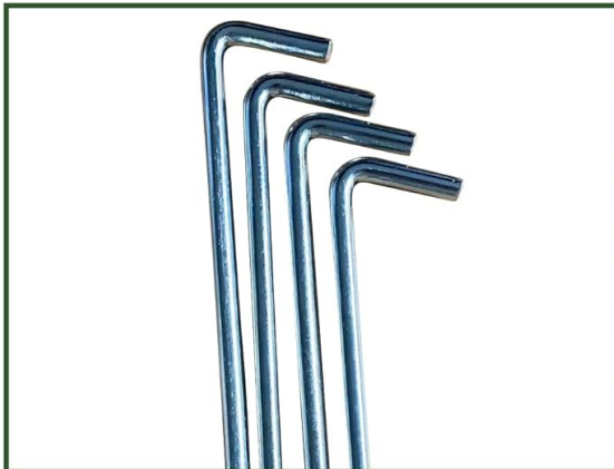
4 Ground Nails