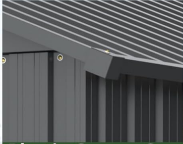
Plastic Corner Cap