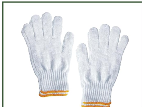
2 Pairs of Gloves

Image: Included complimentary accessories for the shed.