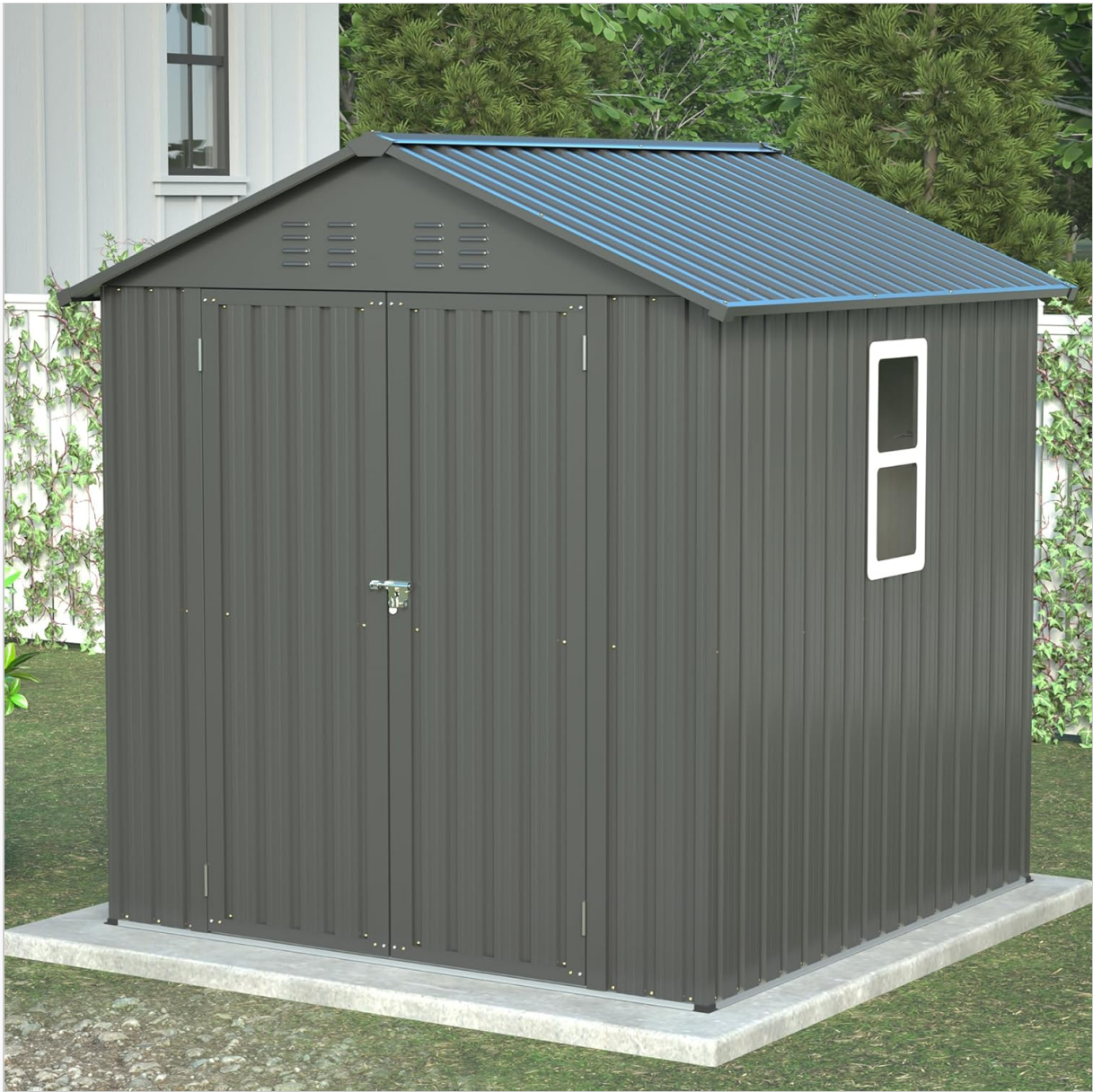
Image: Fully assembled Hokuqeri 6x6ft Outdoor Storage Shed.