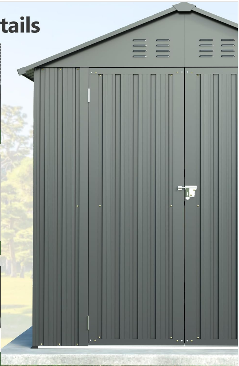
Image: Detailed view of shed components including plastic corner caps, hinged doors, and aluminum frames.