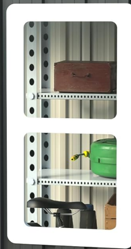
Image: Shed features for ventilation and natural light.

Provides natural light inside for easy picking and storage.