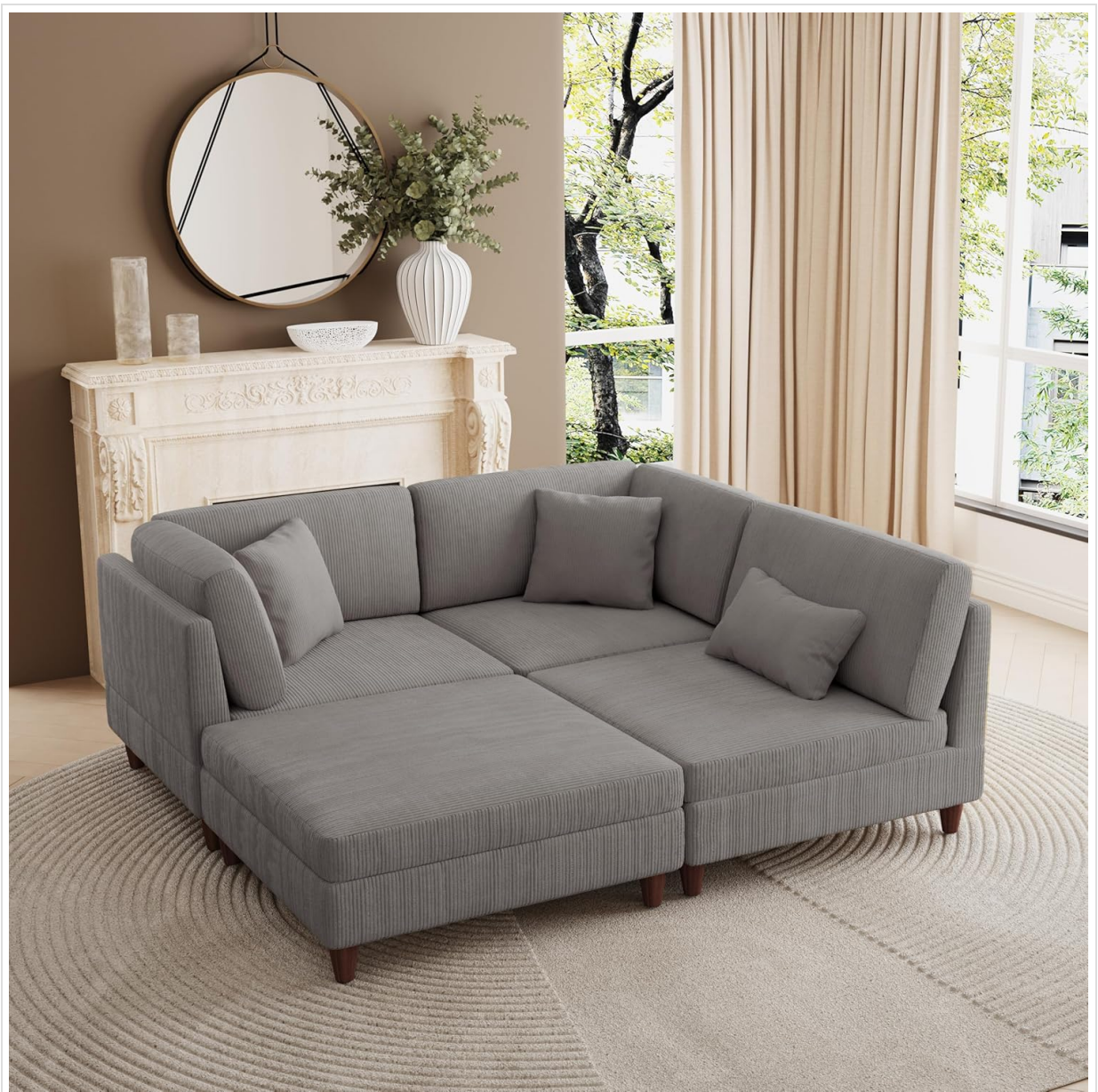
Image: A single corner sofa module, illustrating its design and the placement of cushions.