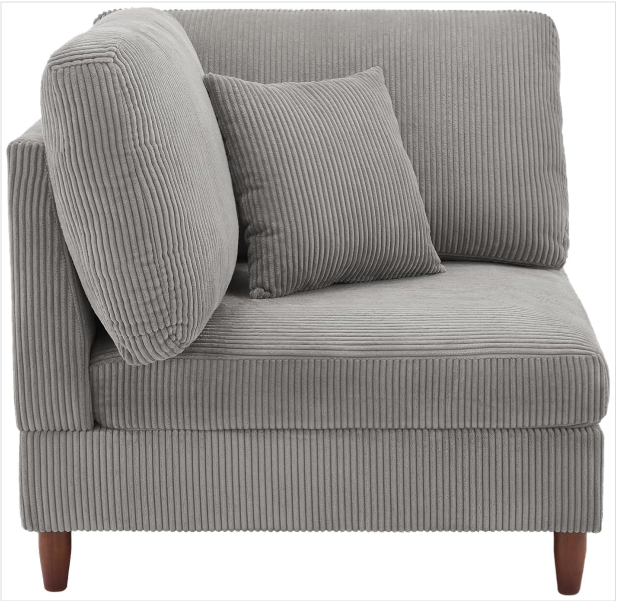
Image: A single armless sofa module, showing its structure and cushion arrangement.