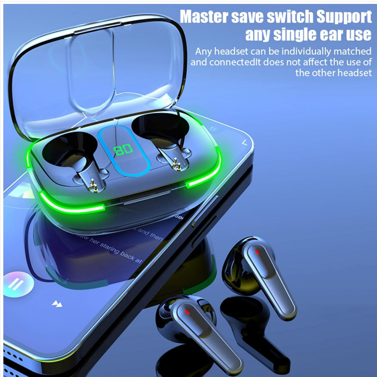
Image: The Estink PRO70 charging case with one earbud inside and the other earbud placed on a smartphone screen, demonstrating the ability to use a single earbud independently. Text states "Master save switch Support any single ear use" and "Any headset can be individually matched and connected. It does not affect the use of the other headset."