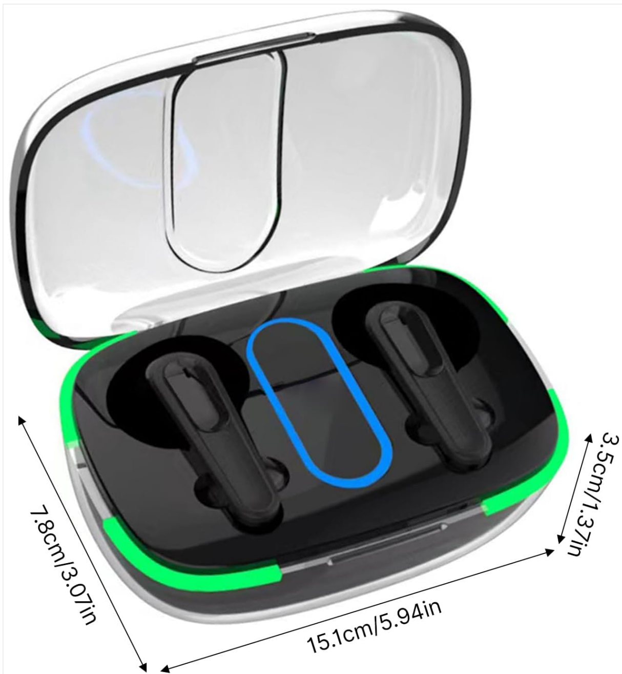
Image: A diagram showing the dimensions of the Estink PRO70 charging case. The measurements are indicated as 15.1cm / 5.94in (length), 7.8cm / 3.07in (width), and 3.5cm / 1.37in (height), providing a clear understanding of the product's physical size.