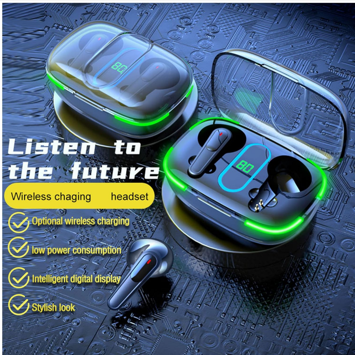
Image: A pair of Estink PRO70 earbuds and their charging case, illuminated with green light, against a dark, reflective surface. Text overlays highlight key features: "Optional wireless charging", "low power consumption", "Intelligent digital display", and "Stylish look". One earbud is shown outside the case.