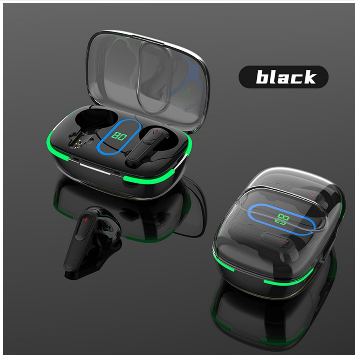
Image: Two views of the black Estink PRO70 True Wireless Earbuds and their charging case. One view shows the case open with earbuds inside, displaying the digital battery indicator. The other view shows the closed charging case next to a single earbud, all on a dark, reflective surface, emphasizing the black color option.