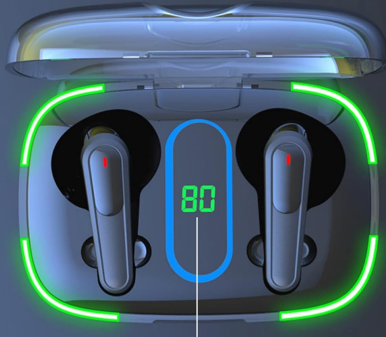
Electric quantity of charging bin

LED electric quantity digital display, charging warehouse electric quantity list, digital display More prominent, with cool lighting, full of design sense.