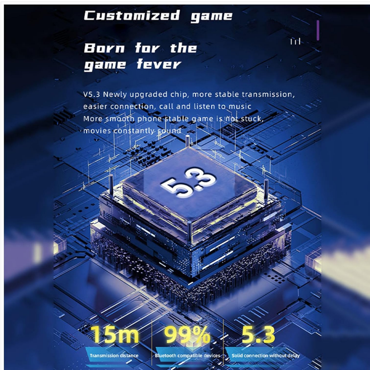
Image: A stylized diagram illustrating the Bluetooth 5.3 chip, emphasizing its advanced capabilities. Text highlights "V5.3 Newly upgraded chip, more stable transmission, easier connection, call and listen to music. More smooth phone stable game is not stuck, movies constantly sound." Below, metrics like "15m Transmission distance", "99% Bluetooth compatible devices", and "5.3 Solid connection without delay" are displayed.