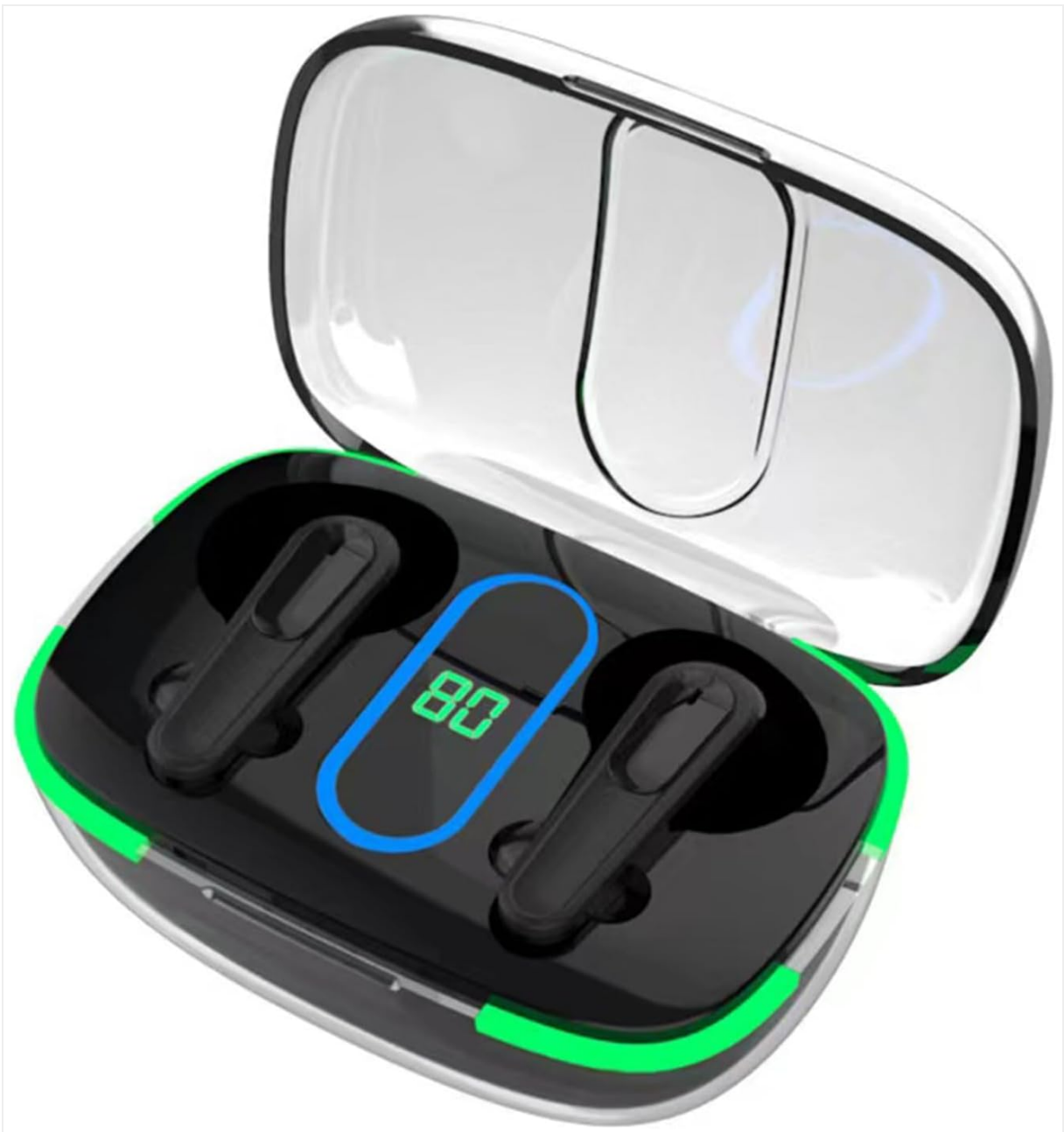
Image: The Estink PRO70 True Wireless Earbuds, black in color, resting inside their transparent charging case. The case is open, revealing the earbuds and an internal digital display showing "80", indicating battery level. The case has a sleek, rounded design with green accents.