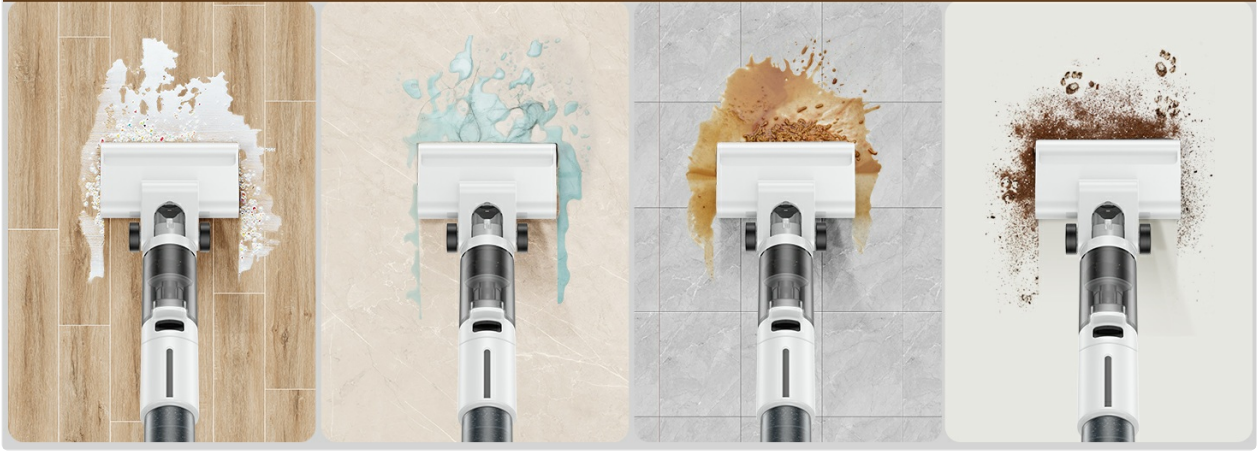
Image: A series of four panels illustrating the JONR ED12 Lite's versatility in cleaning various types of messes, from liquid spills to dry debris, across different hard floor surfaces like wood and tile.