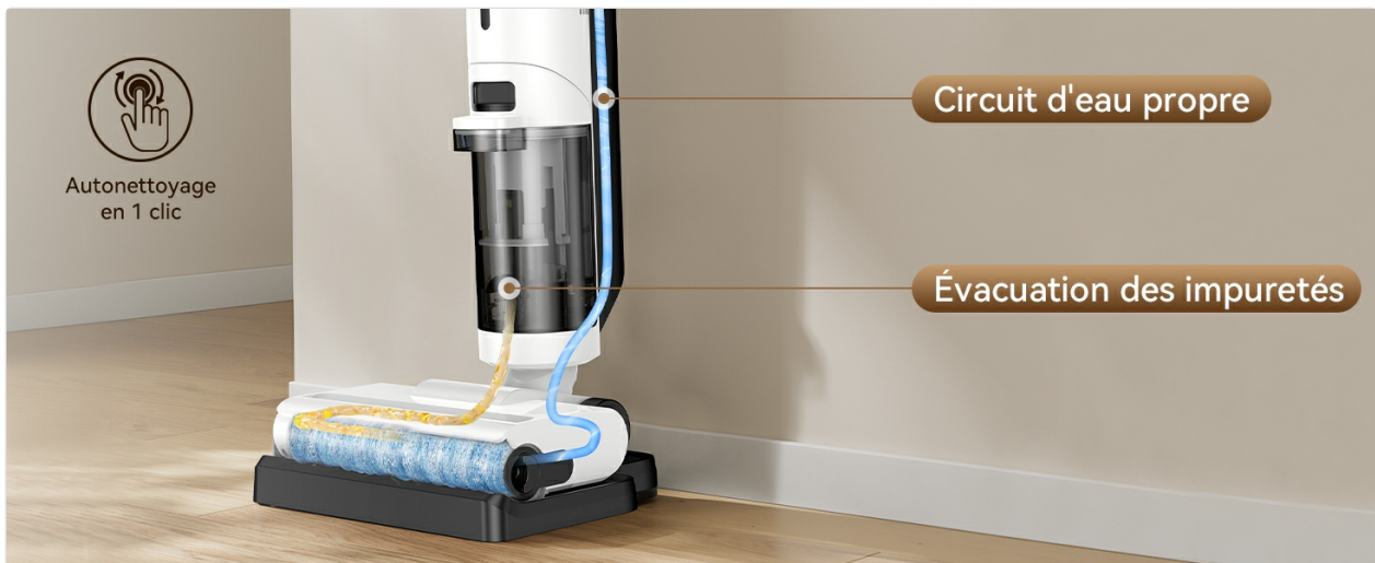
Image: A diagram showing the internal mechanism of the JONR ED12 Lite's self-cleaning function, with arrows indicating the flow of clean water and the evacuation of impurities from the brush roll.