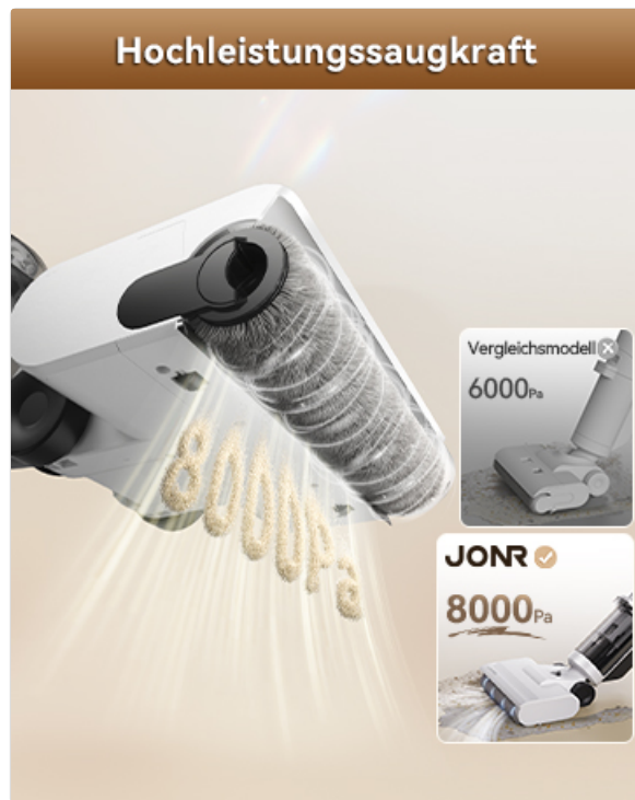
Image: A visual comparison highlighting the JONR ED12 Lite's high suction power of 8000 Pa against a comparative model with 6000 Pa, demonstrating superior cleaning capability.