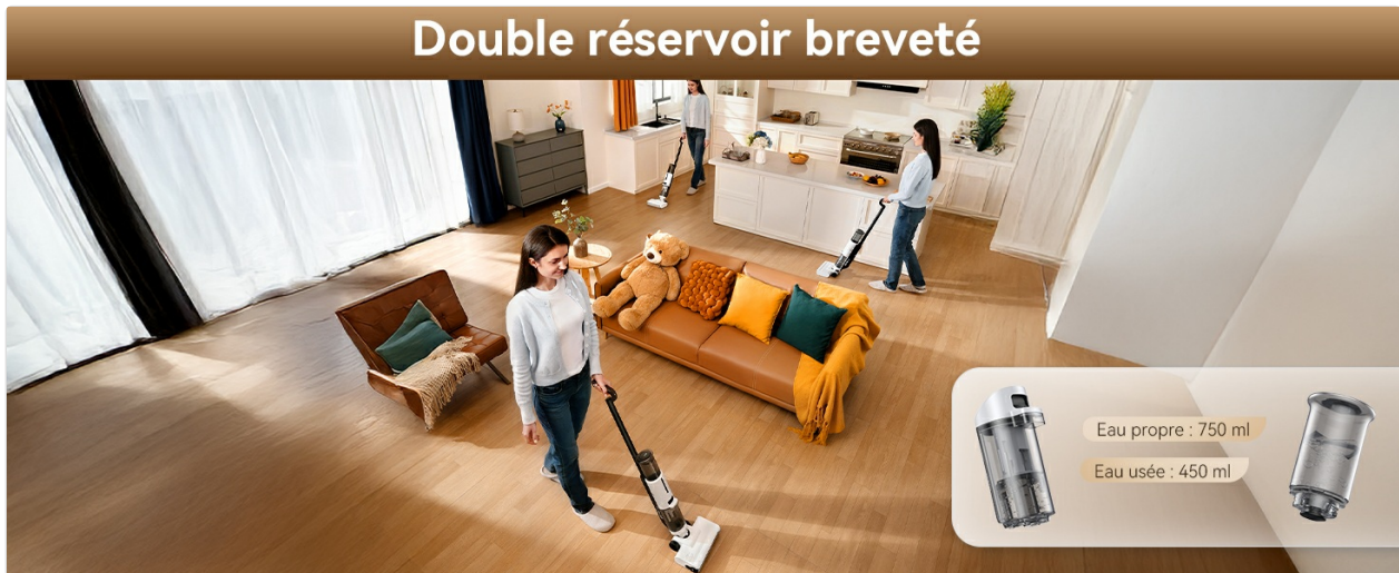
Image: An illustration highlighting the dual tank system of the JONR ED12 Lite, showing the separate clean water tank (750 ml) and dirty water tank (450 ml).