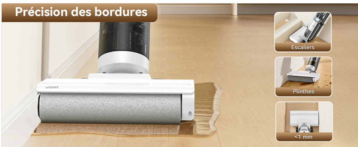
Image: The JONR ED12 Lite vacuum cleaner demonstrating its precision edge cleaning capability, showing how it cleans along baseboards and into corners with its specialized brush roll.