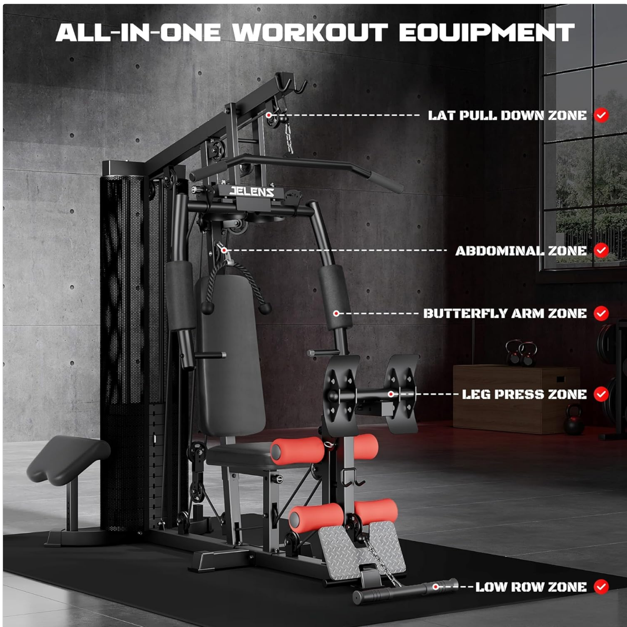
Image: Visual representation of the JELENS H11 Home Gym's durability, highlighting sturdy steel rope, thickened steel frame, and steel pivot pulleys.