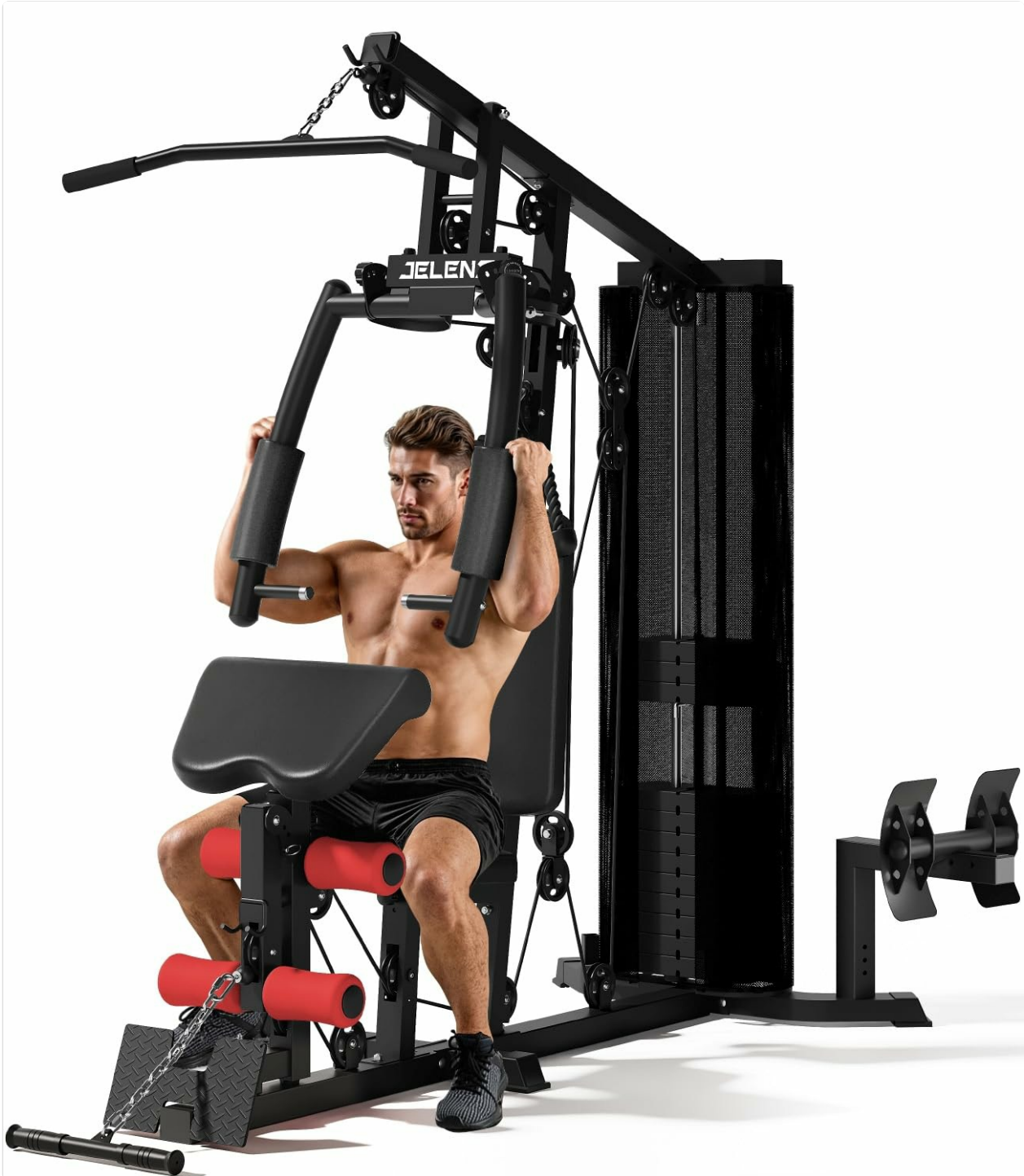
Image: The JELENS H11 Home Gym Equipment, demonstrating a user performing a chest press exercise.