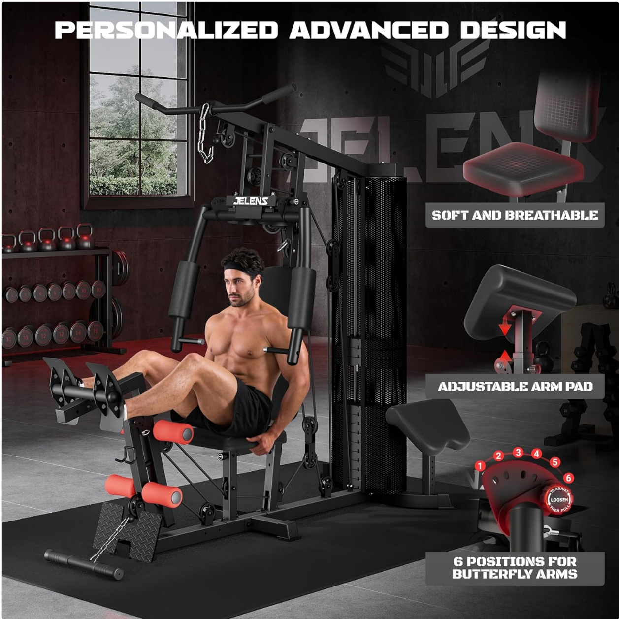
Image: Demonstrations of Lat Pulldown, Leg Extension, Seated Rowing, and Oblique Crunch exercises on the JELENS H11 Home Gym.