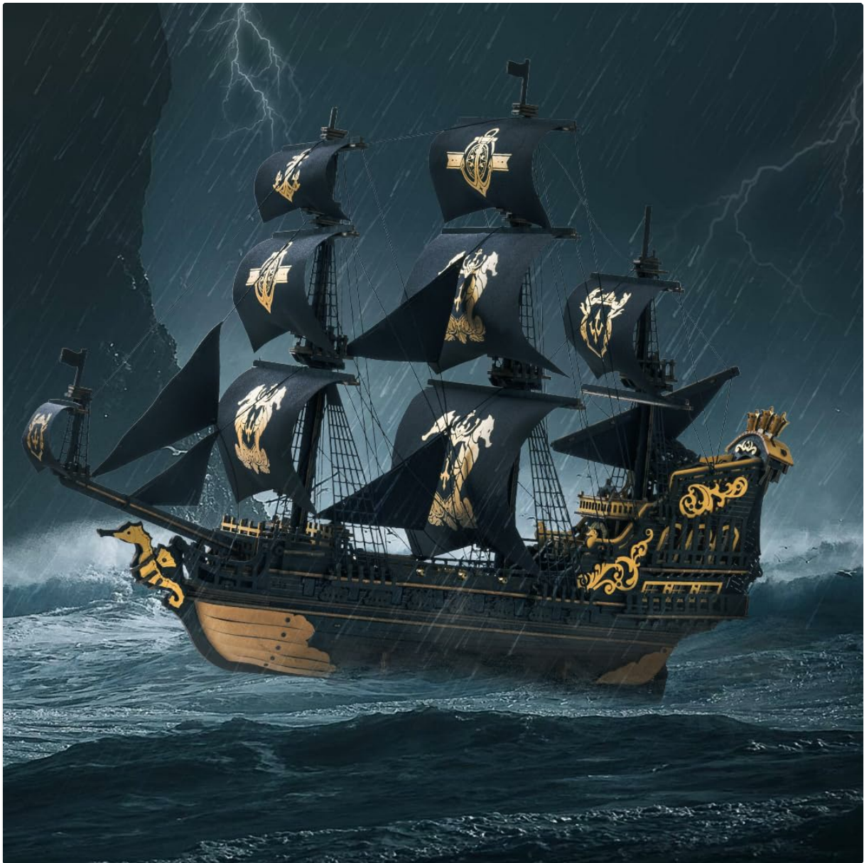
Image: The fully assembled ROBOTIME Seahorse Barque MCB02 3D wooden puzzle model.