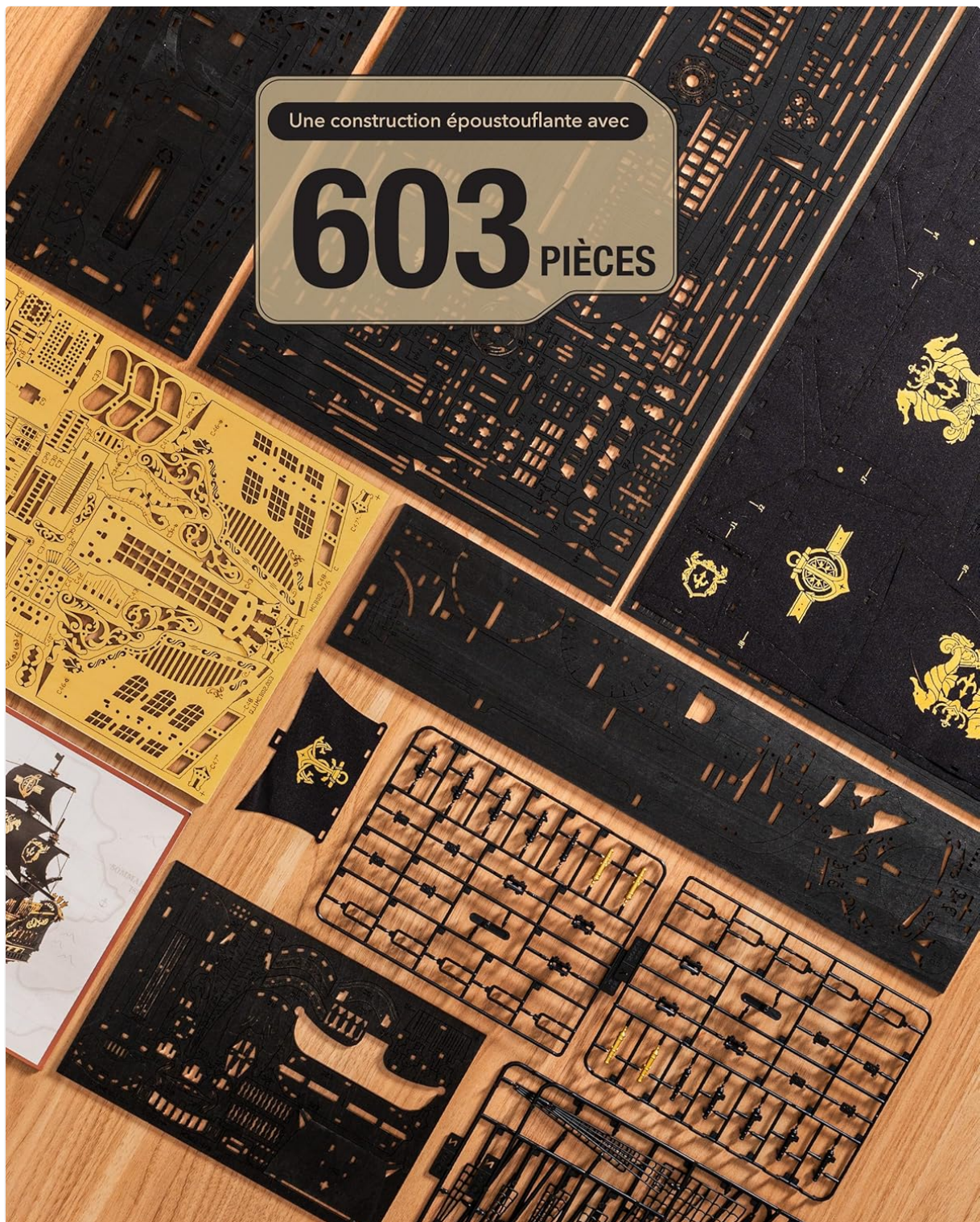
Image: Layout of laser-cut wooden puzzle sheets and various components for the Seahorse Barque MCB02 kit.