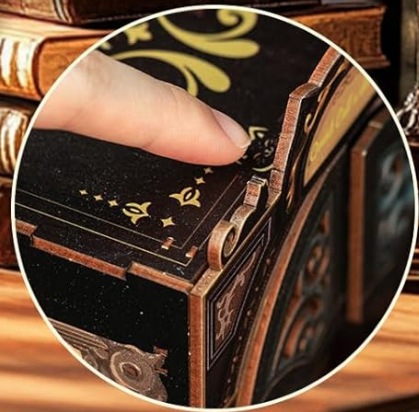
Image: A detailed shot highlighting the comfortable LED light, its easy installation, the dust cover, and the touch switch for operation.