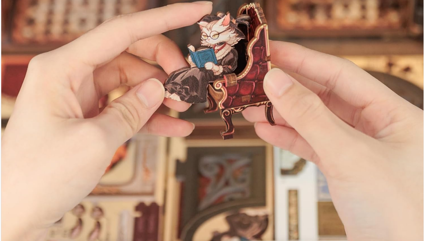
Image: Hands carefully positioning the miniature cat figure, which is reading a book, into the assembled book nook.

Your browser does not support the video tag.