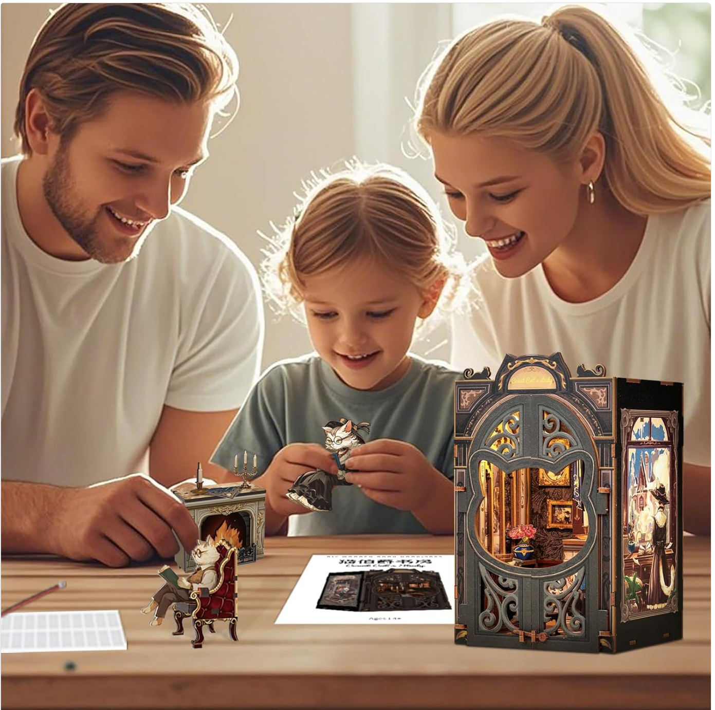
Image: A family engaged in assembling the book nook kit, demonstrating the collaborative and engaging nature of the project.