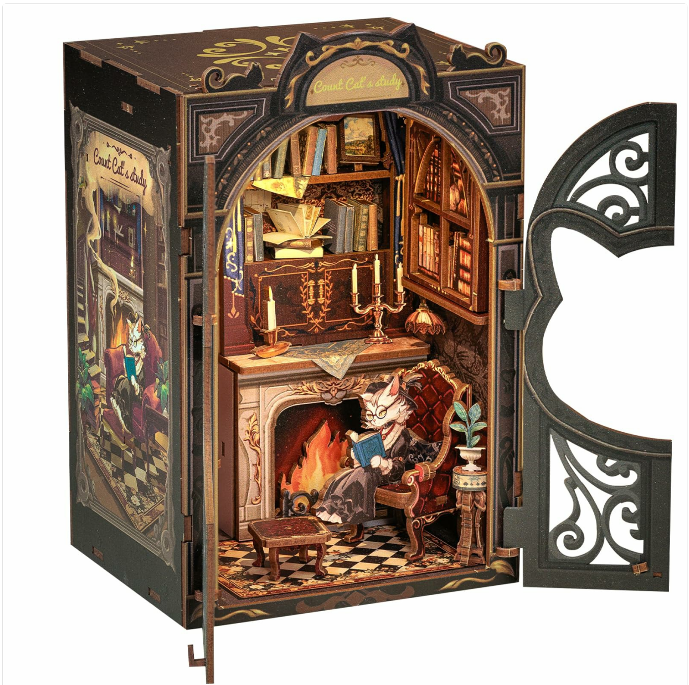
Image: The assembled CUTEBEE Count Cat's Study Book Nook, highlighting its compact dimensions (17.1cm height, 11.8cm width, 10cm depth) and key features like assembly time (1-2 hours), 108 wooden pieces, and moderate assembly difficulty.