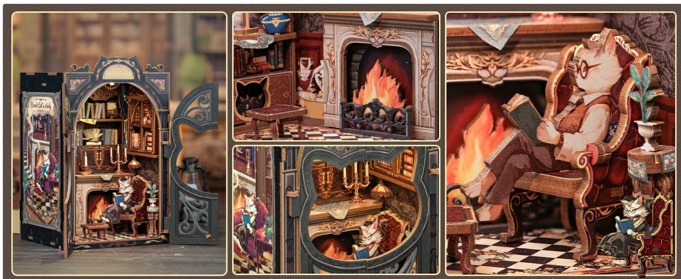
Image: A close-up view of the book nook's interior during construction, showcasing the intricate details of the shelves, fireplace, and wall decor.