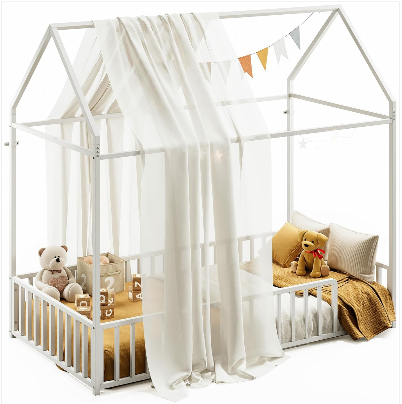
Figure 1: LIKIMIO Twin Floor Bed Frame, White. This image shows the assembled bed frame with a white canopy, teddy bear, and wooden blocks, highlighting its house design and guardrails.