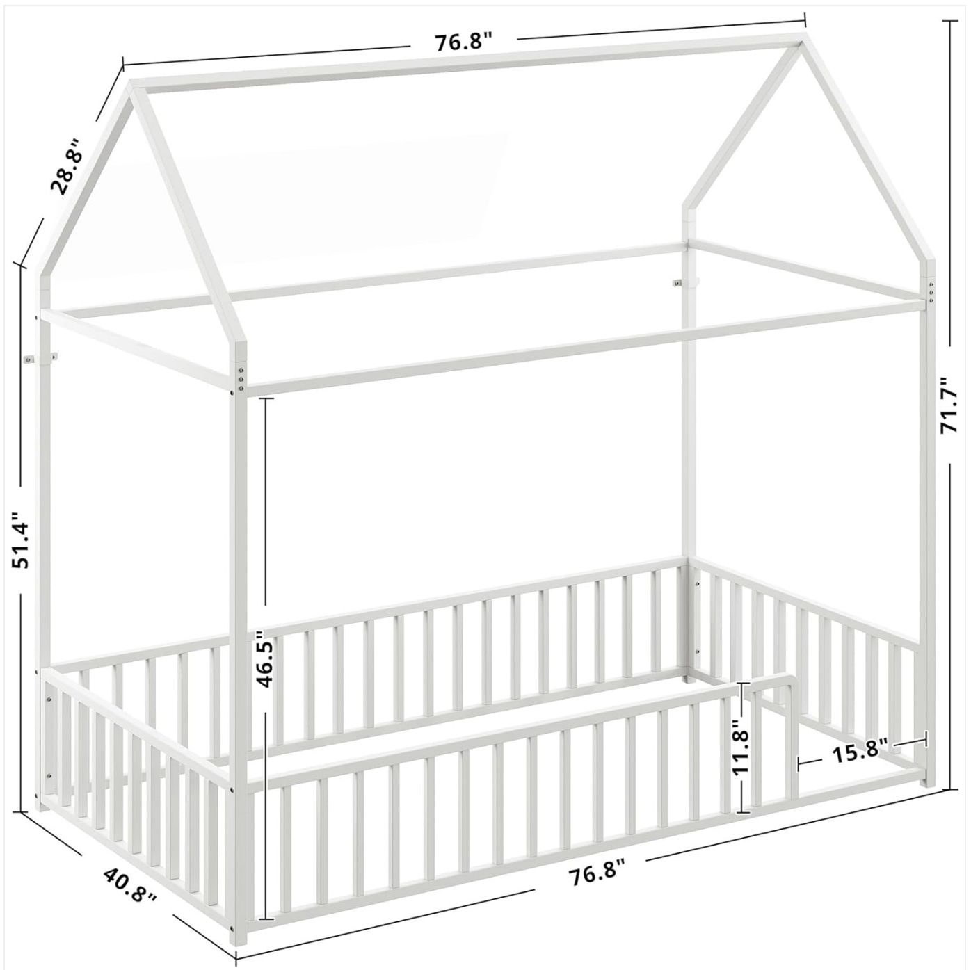
Figure 2: Product Dimensions. This diagram illustrates the precise measurements of the bed frame, including length (76.8"), width (40.8"), and height (71.7"), along with guardrail and entry dimensions.