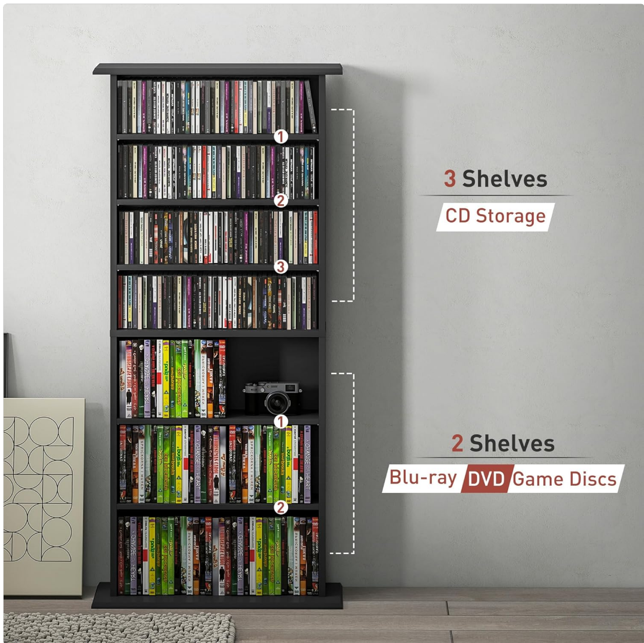
Image 5.3: Example configurations for storing CDs and Blu-ray/DVDs on different shelves.

Your browser does not support the video tag.