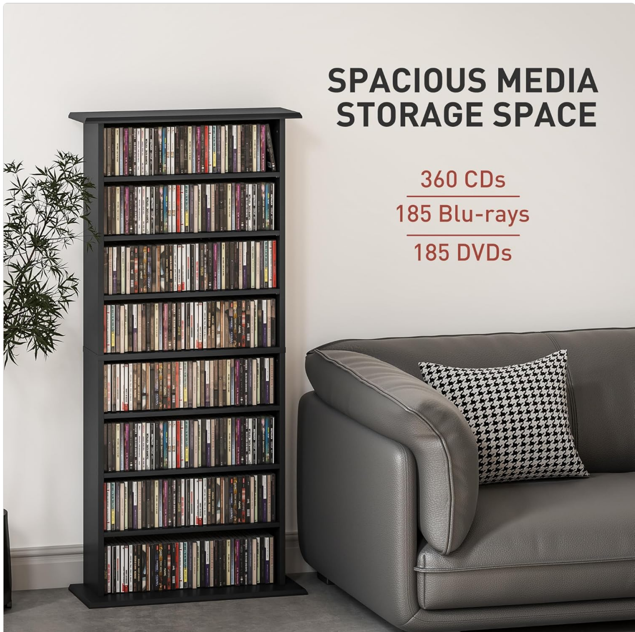
Image 5.2: The media cabinet displaying its spacious storage for various media types.