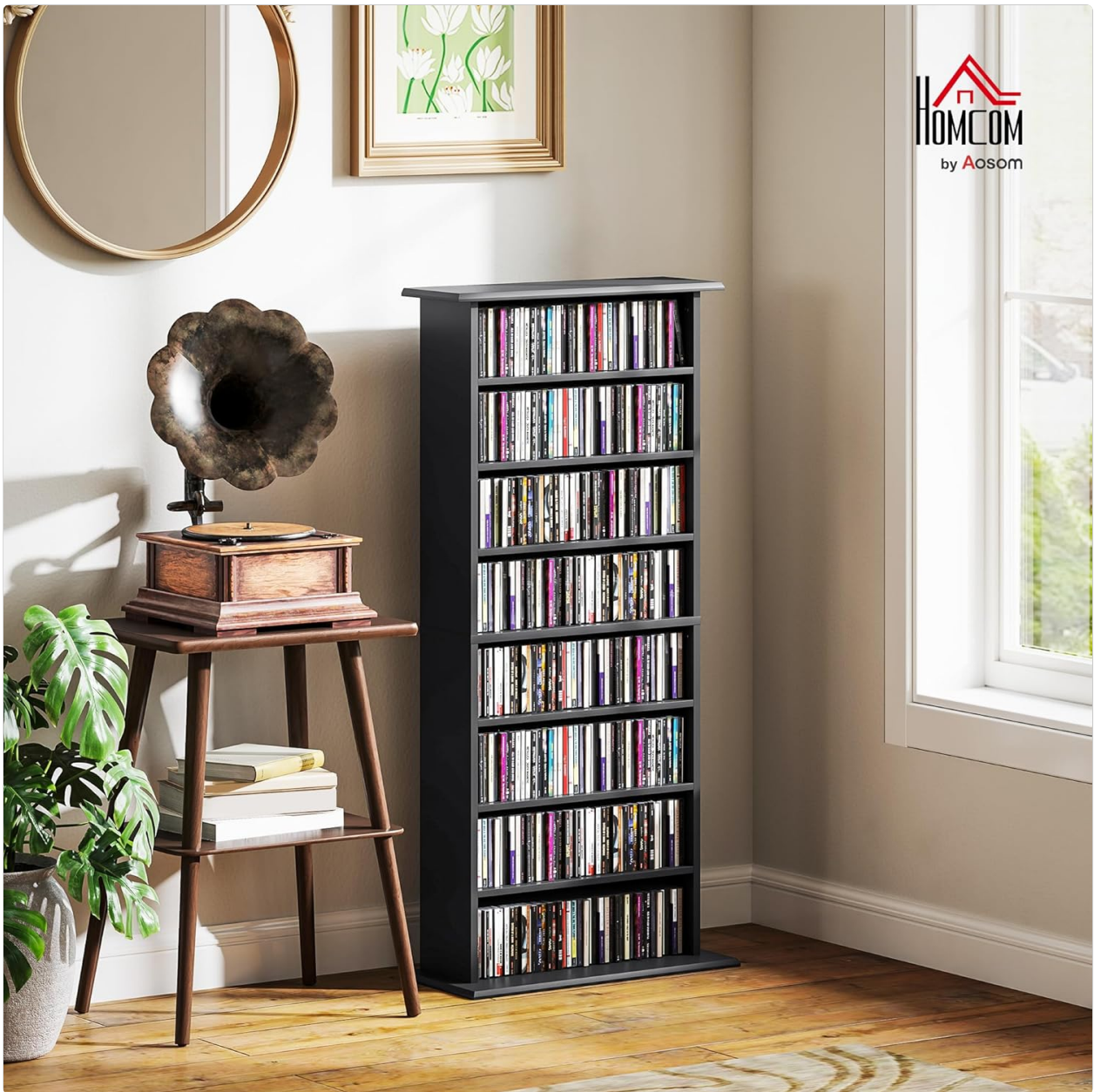
Image 1.1: The HOMCOM Double Media Storage Cabinet in a home environment, showcasing its capacity for media storage.