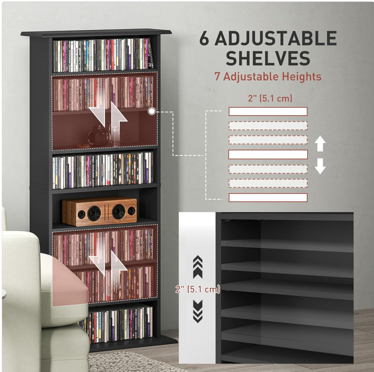
Image 5.1: Visual guide demonstrating the adjustable shelf feature and various height settings.