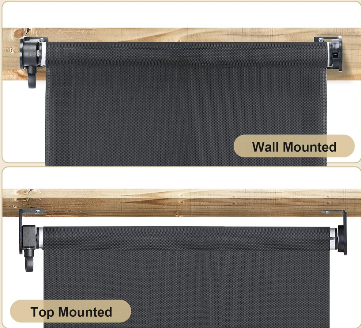
Image: Illustration of the two available installation methods: Wall Mounted and Top Mounted.