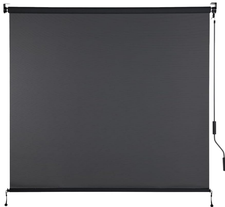
Image: Detailed view of the shade's components, including the windproof balls, manual crank, and aluminum tube for stability.