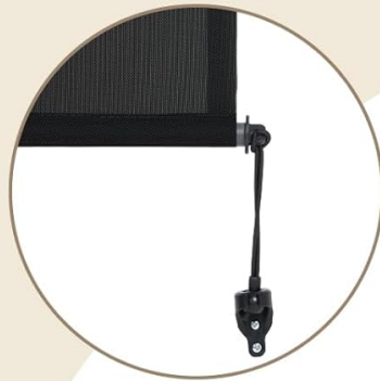
Windproof Balls Prevent roller shade from shaking