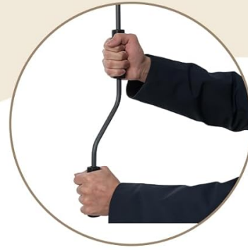
Manual Crank Control the shade up and down