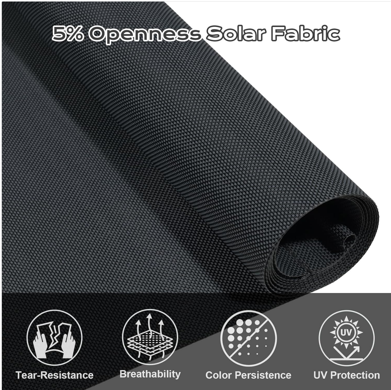
Image: Detail of the 5% openness solar fabric, showcasing its durability and protective qualities.