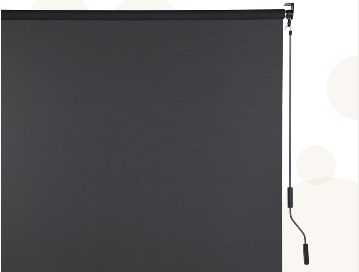
Image: The cordless design of the Aoodor roller shade, emphasizing safety and ease of use.

Provide a safe environment for children and pets