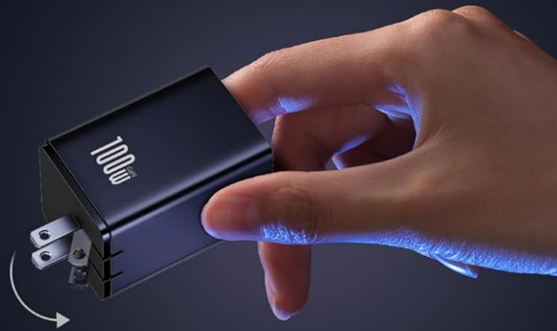
Figure 2.3: The compact size of the Baseus 100W charger, demonstrating its space-saving design compared to other chargers.