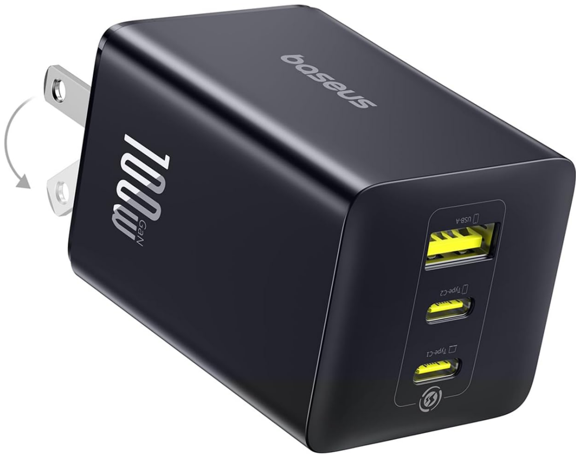
Figure 1.1: The Baseus 100W USB C Charger Block, showcasing its compact design and foldable pins.