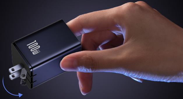
Figure 4.2: Baseus Cooling Technology (BCT) ensures secure overnight charging and maximizes battery lifespan by intelligently controlling temperature.

The foldable-pin design is easy to pack and avoids scratching your bags.