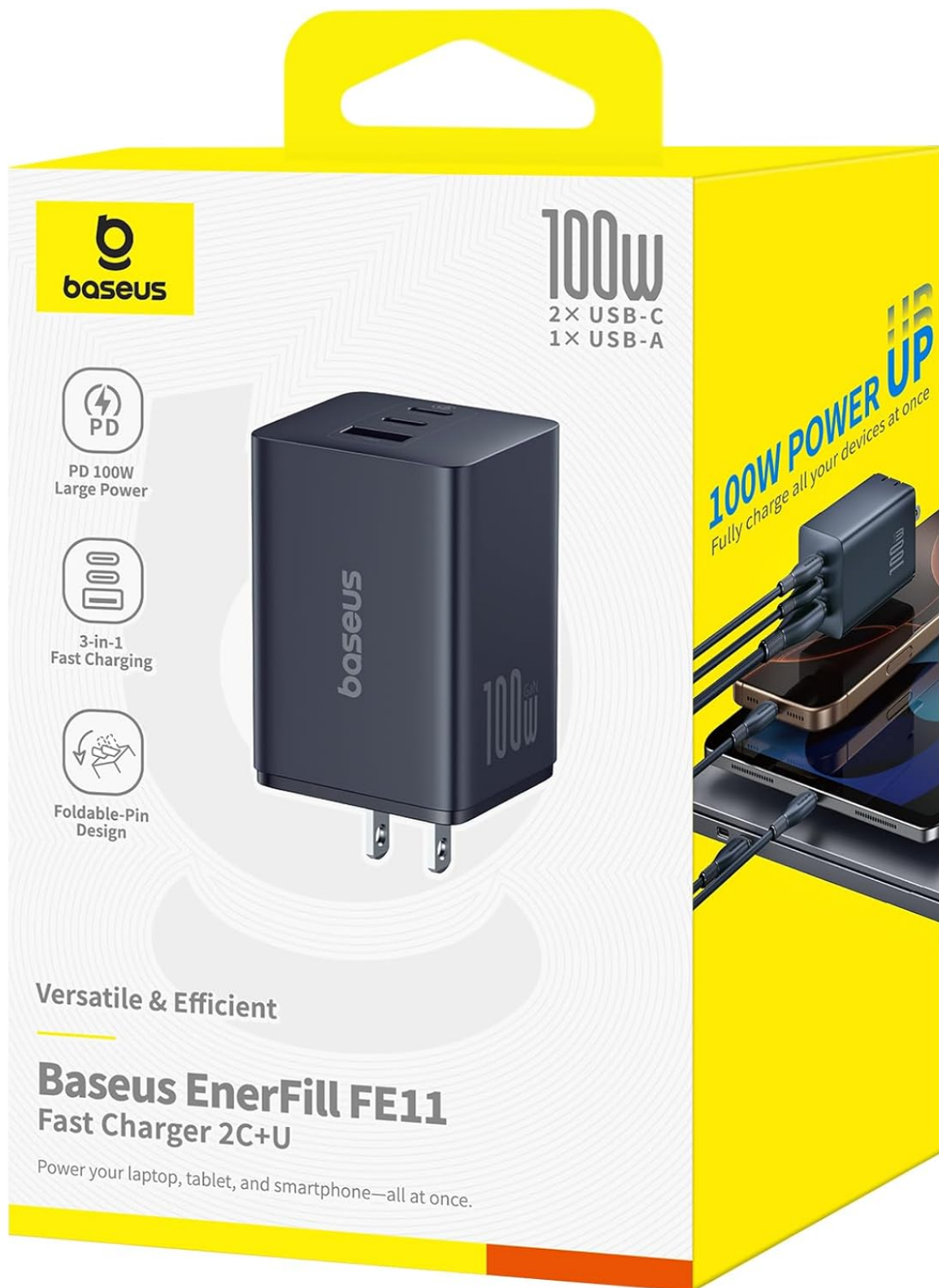
Figure 5.1: The charger's broad compatibility with a wide range of electronic devices.