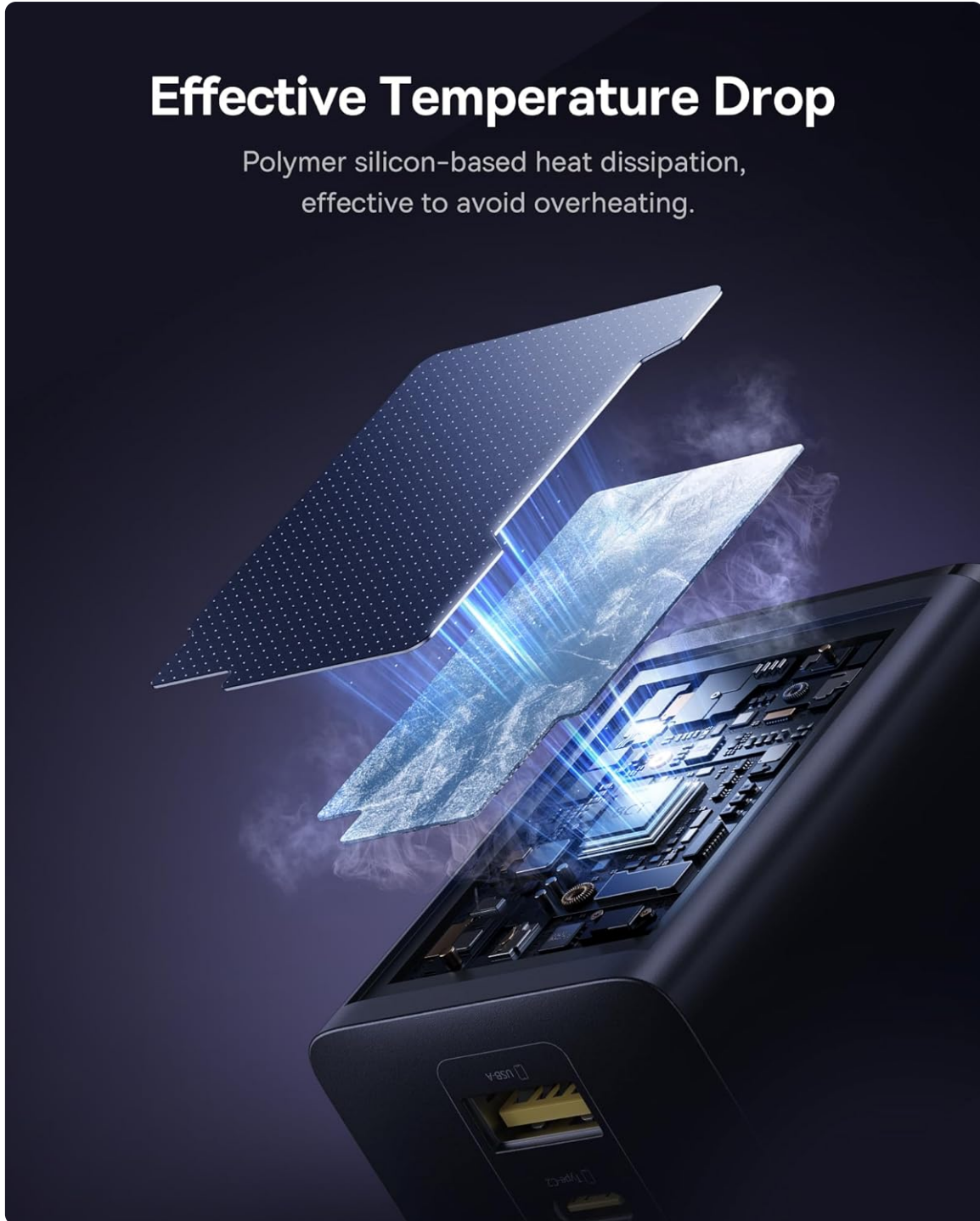
Figure 3.1: The 3-in-1 multiport capability allows for efficient simultaneous charging of multiple devices.

Polymer silicon-based heat dissipation, effective to avoid overheating.