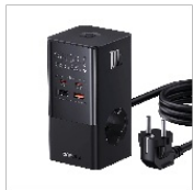
Разклонитель CCGAN100-S2ACE Руководство по эксплуатации

Baseus CCGAN100-S2ACE Power Strip: User Manual and Specifications Comprehensive user manual and technical specifications for the Baseus CCGAN100-S2ACE 100W GaN Power Combo, detailing features, ports, safety guidelines, and operating environment.