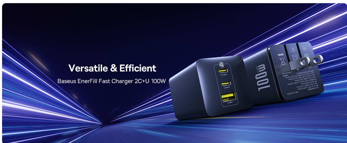
Figure 1.2: Overview of the Baseus EnerFill Fast Charger's versatile and efficient features.